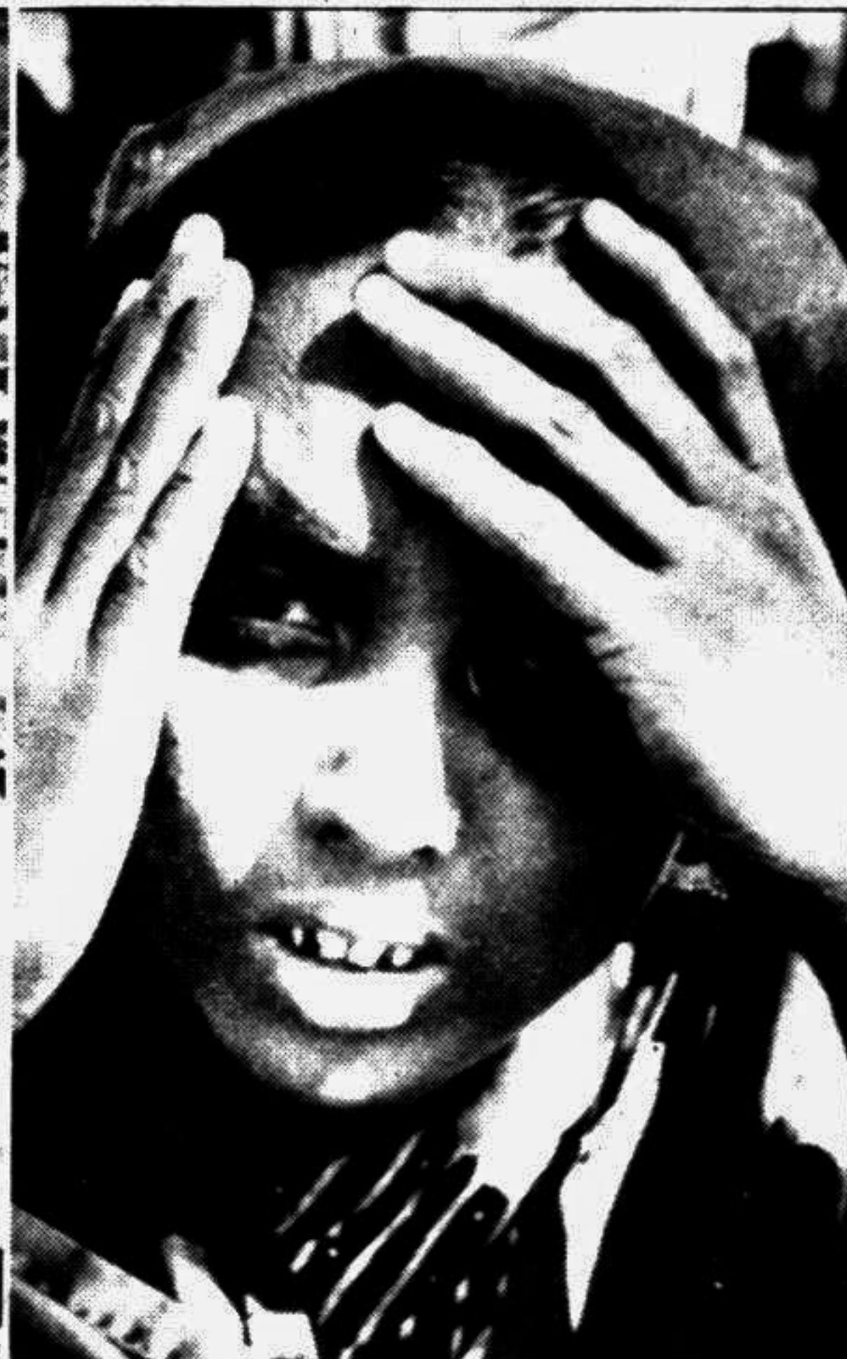
TWO FACES OF A TORNADO : Detritus of Mita Textile Mills at Sripur, left, and the agonies of losing the loved ones, right.