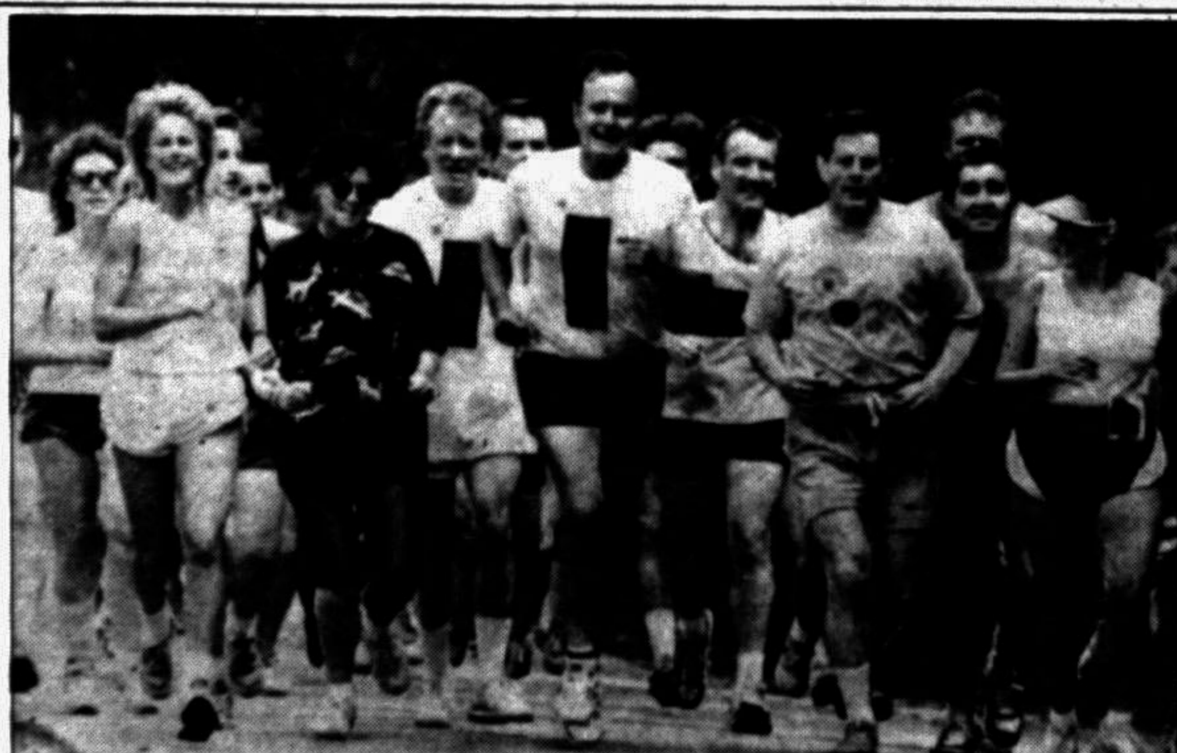
US President George Bush (C) attracts a small crowd while jogging in a Houston, Texas park on April 6.