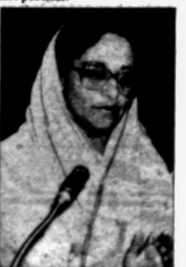
Hasina assures co-operation

She also posed a question to the Leader of the House Begum Khaleda Zia as to why it was not possible.