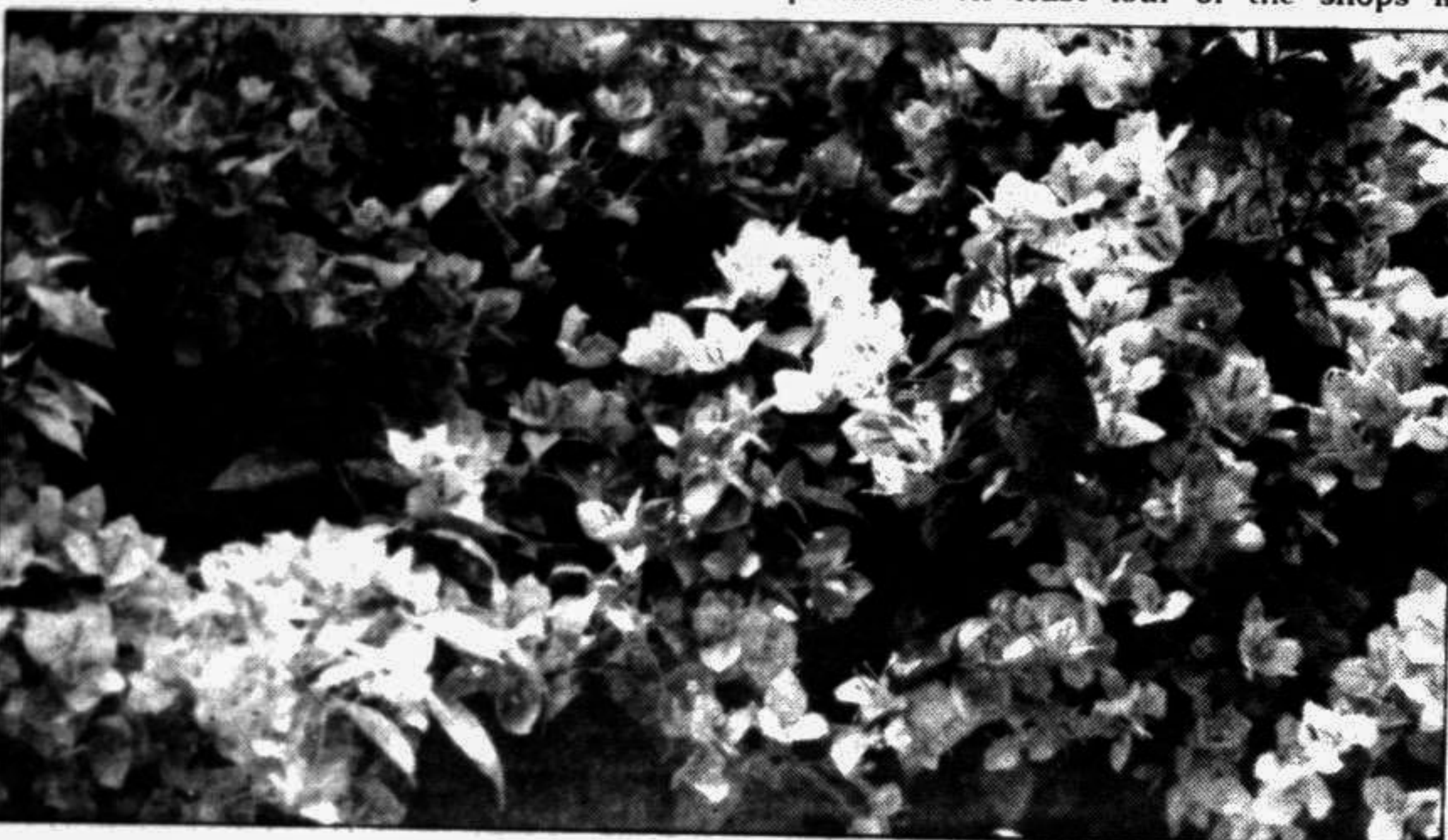
Bougainvillas seen at Baitul Mukarram.

Some of the sophisticated Motijheel offices, such as the prestigious banks, do keep potted plants along with paintings for the benefit of the workers and the visitors. But what surprises me are the plants in front of the sweet shops or places where one can buy spectacles. At least four of the shops in