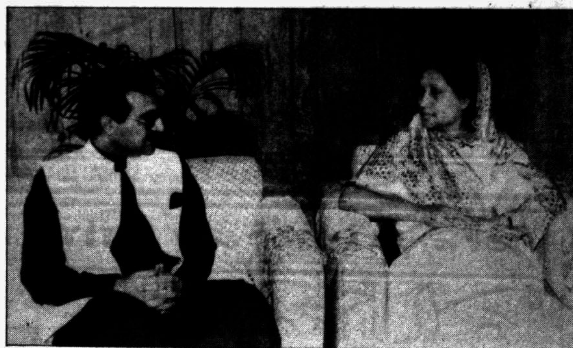
Mir Hazar Khan Bijrani, Special Emissary of Pakistan Prime Minister Nawaz Sharif and Railway Minister called on Bangladesh Prime Minister Khaleda Zia at her Parliament chamber in Dhaka Sunday.