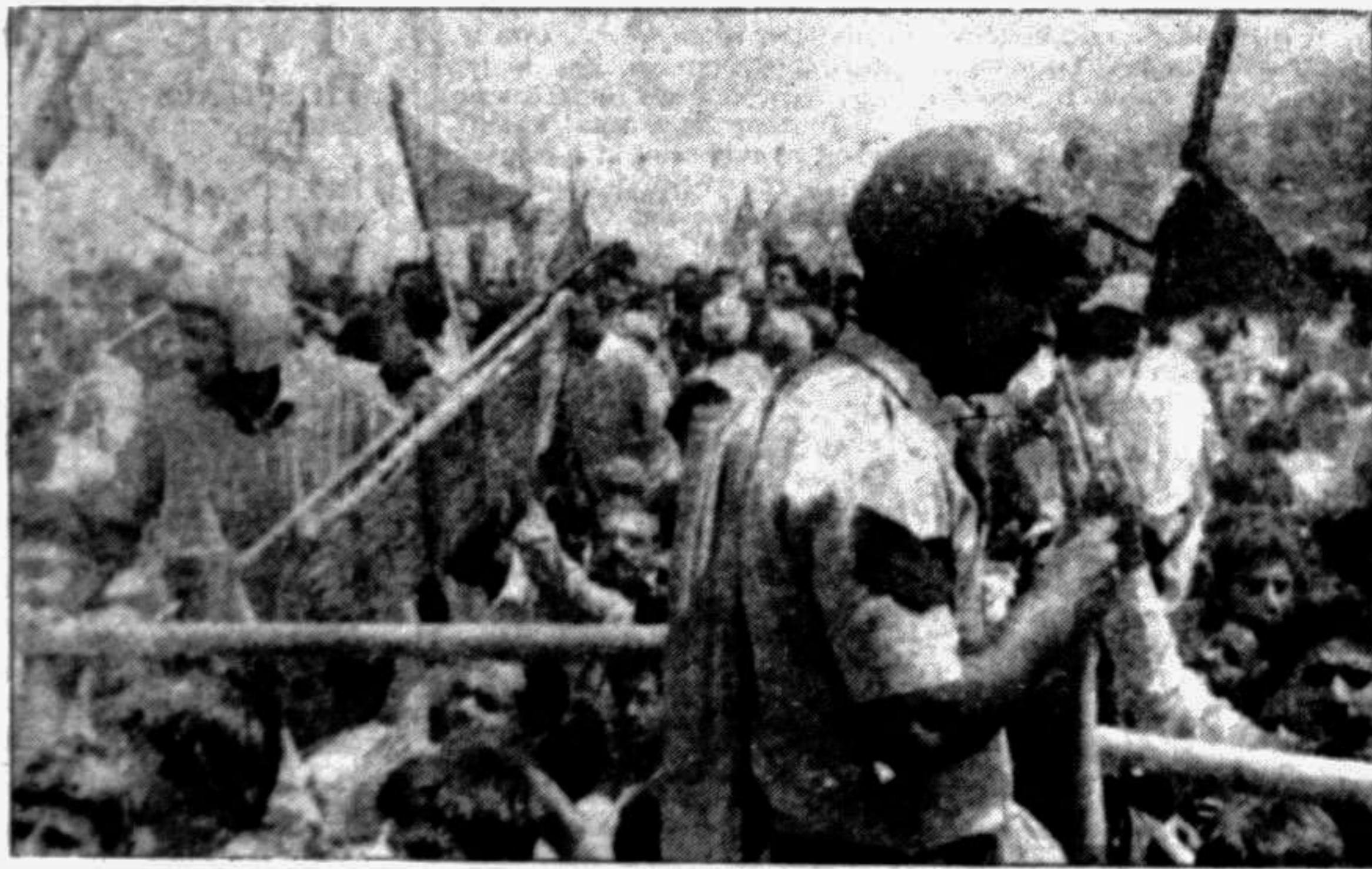
Riot police positioned amidst hundreds of thousand of Hindus in New Delhi during a rally Thursday billed as the greatest show of Hindu strength. Demonstrators were demanding the handover of Babri Masjid.

He quit after Congress (I) MPs started a boycott of Parliament to protest police surveillance at Gandhi's resi- See Page 12 Col. 7