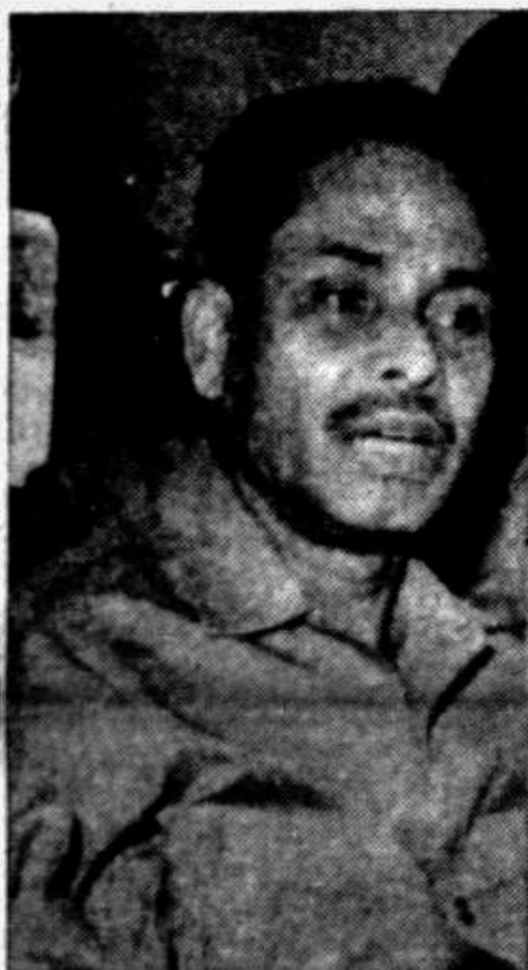
Ershad: nonplussed?

A petition for adjournment of the Tribunal in order to enable deposed President Ershad to attend parliament session beginning today (Friday) was rejected on Thursday.