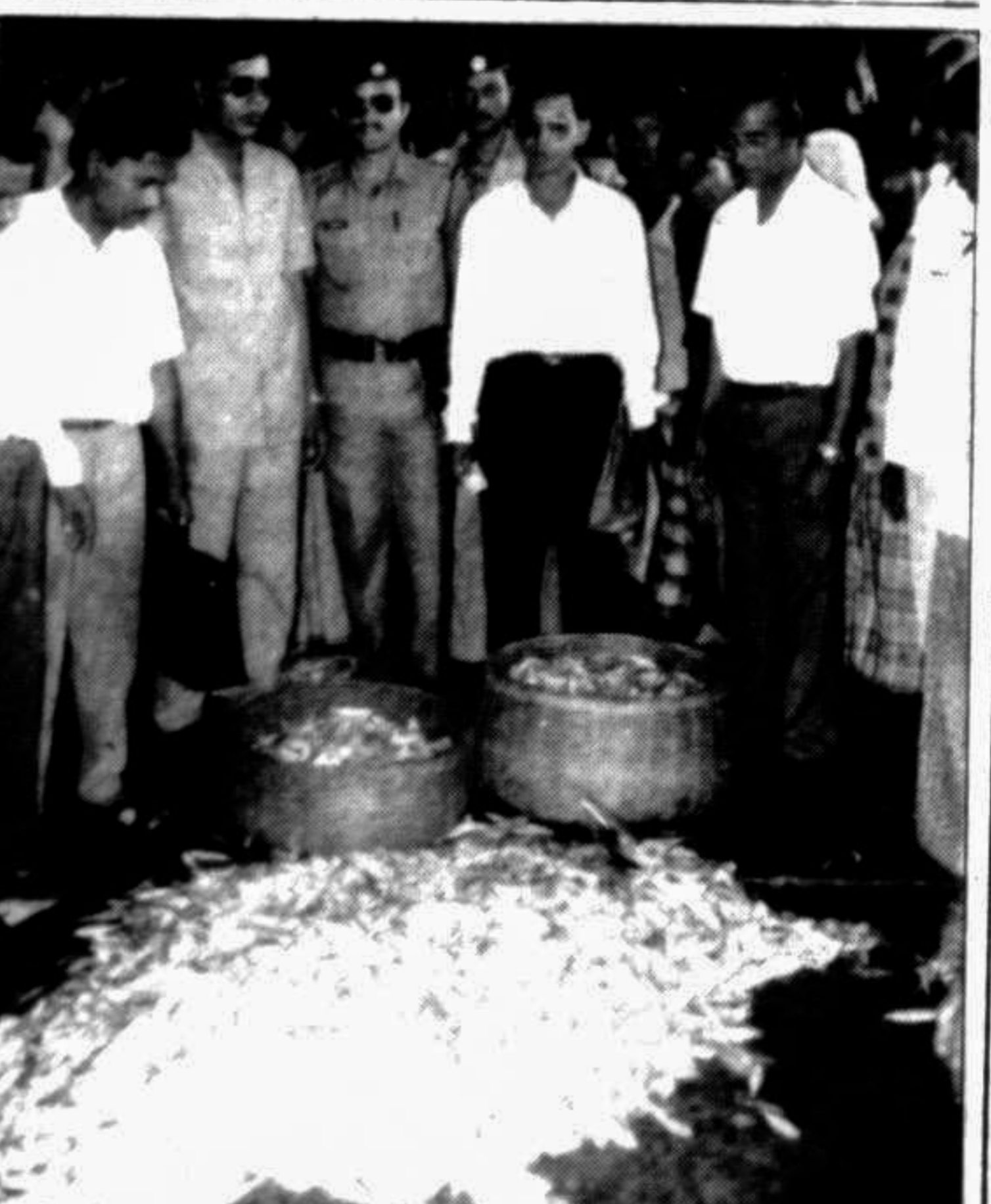
CHANDPUR: Catching of hilsha fry is banned. Police arrested some fishermen and seized a huge quantity of fish fry while selling those in the market.

It is learnt that the Indian national entered Bangladesh without any valid document.