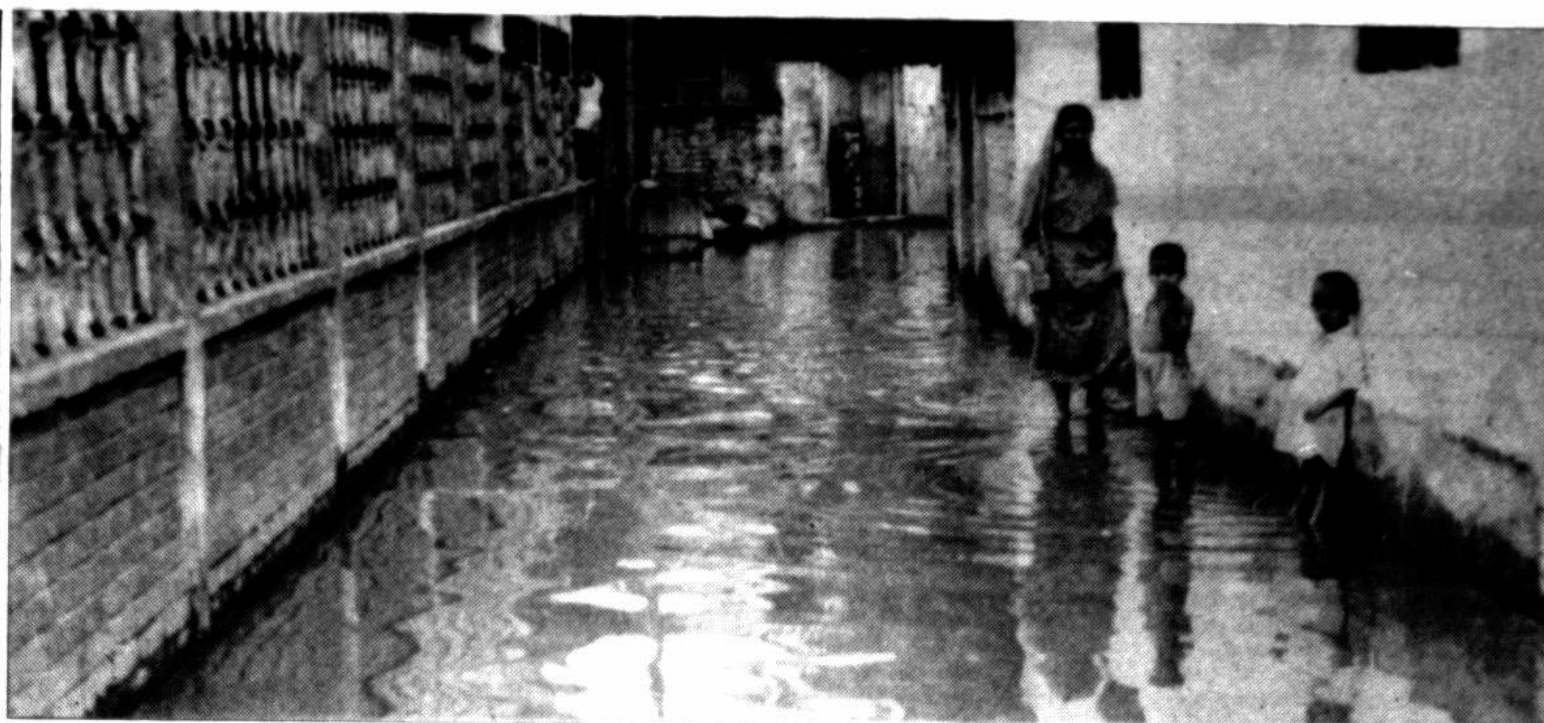
FLOOD IN DHAKA — Bahadurpur Lane of Faridabad in the national capital is under knee-deep water following light rain. Water remains clogged as sewerage lines are blocked. Thousands of people have an ordeal in movement due to water-logging assuming the spectre of a flood.

He said he could not stay there for more than half an hour due to lack of security.