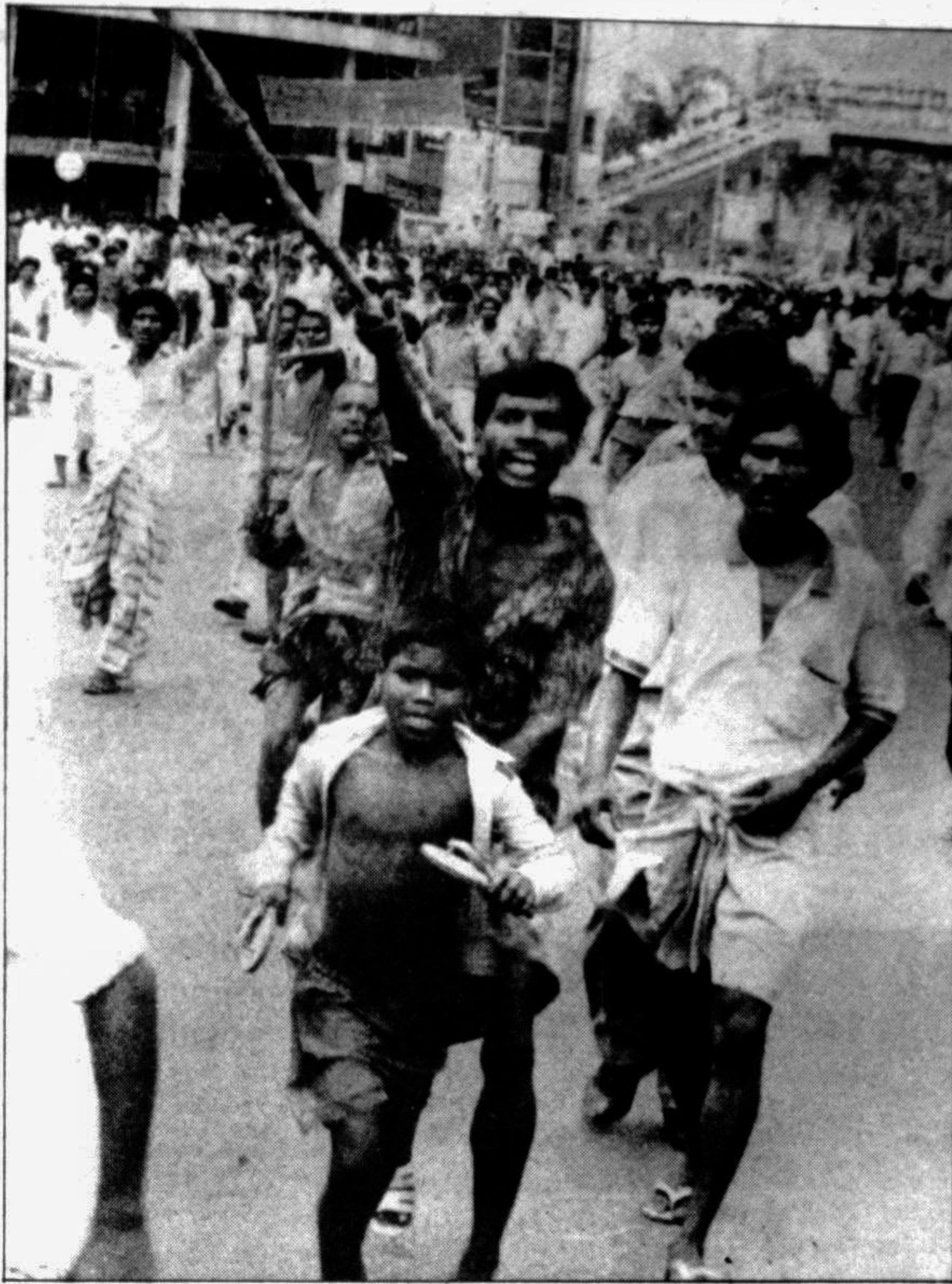
Workers of auto-tempos holding a militant procession at Farmgate on Sunday following their clash with police.

Twenty correspondents will take part in the course.