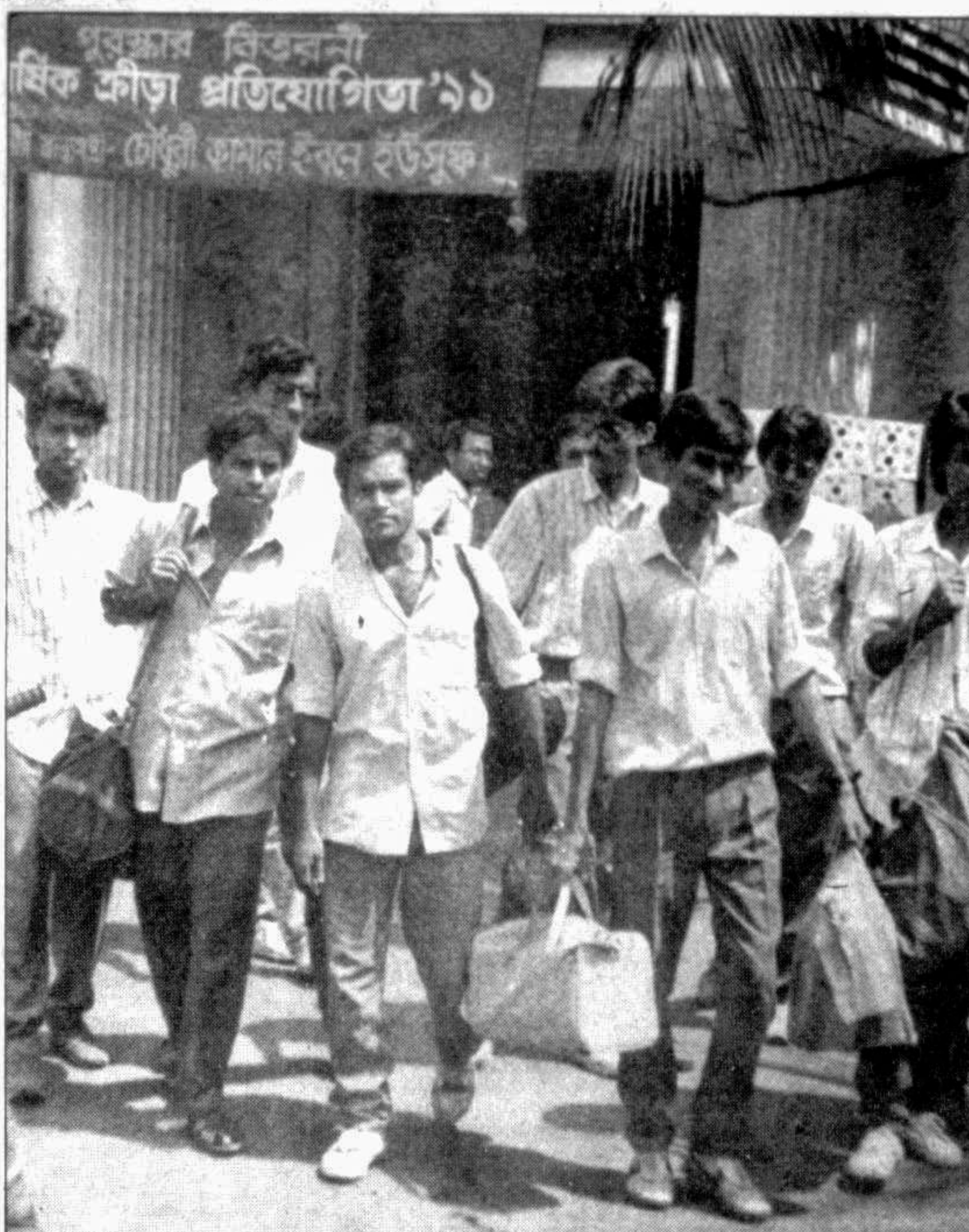
Students leaving hostels following closure of Dhaka Medical College for an indefinite period after renewed clashes between rival student groups on Friday.