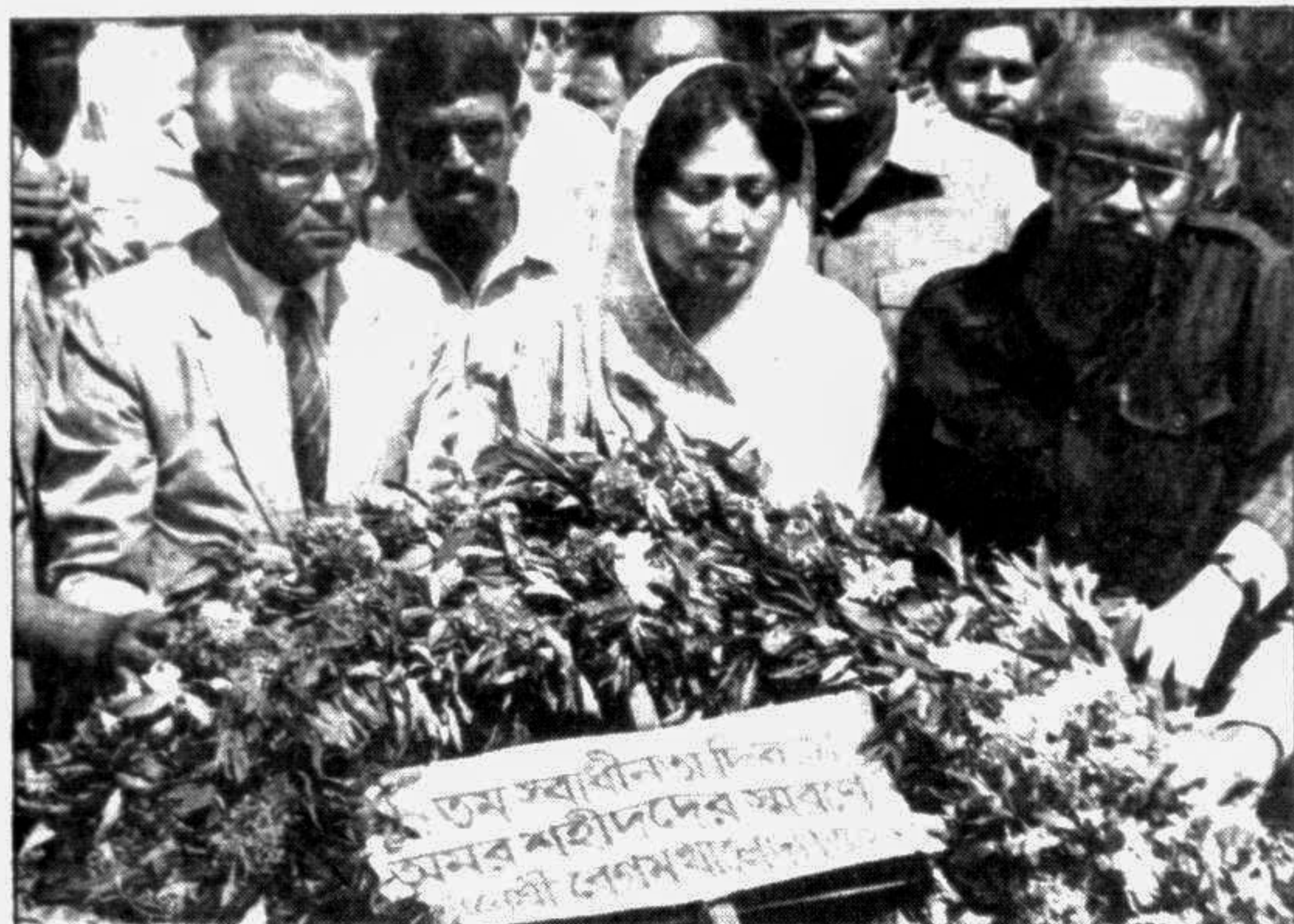
Prime Minister Begum Khaleda Zia placing wreaths at the National Memorial for martyrs at Savar on March 26.

An unprecedented enthusiasm among people from all walks of life was witnessed on March 26 to celebrate the 21st Independence and National Day. The Daily Star presents in this page a selection of pictures that project the Day as it was.