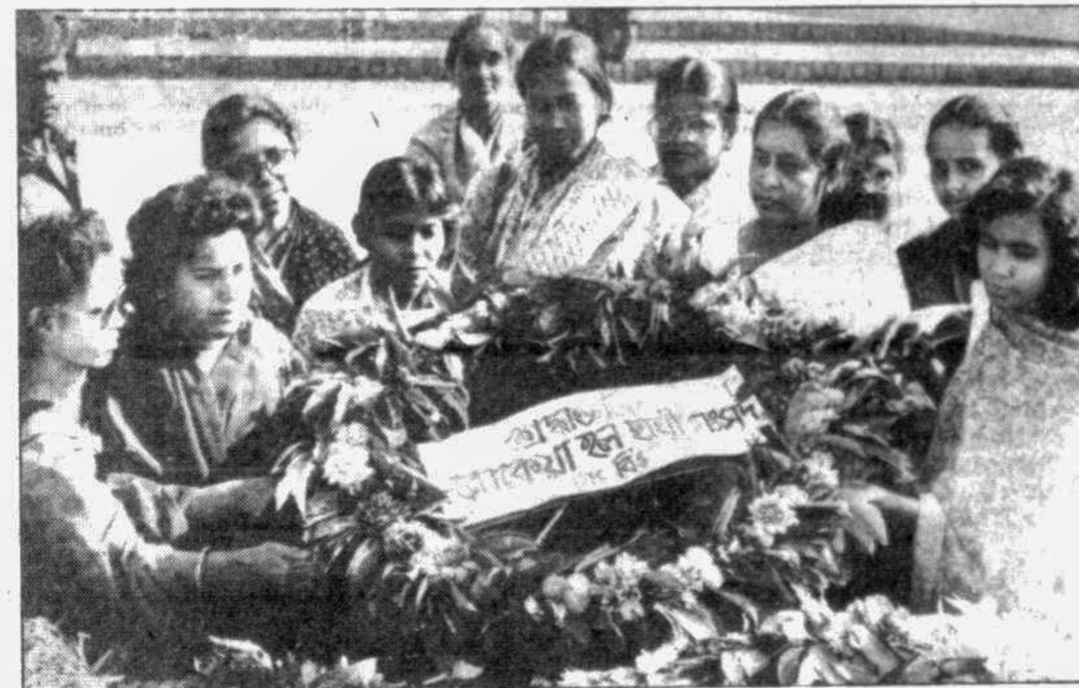
Rokeya Hall Students Union of Dhaka University placing wreaths at the Savar Memorial.