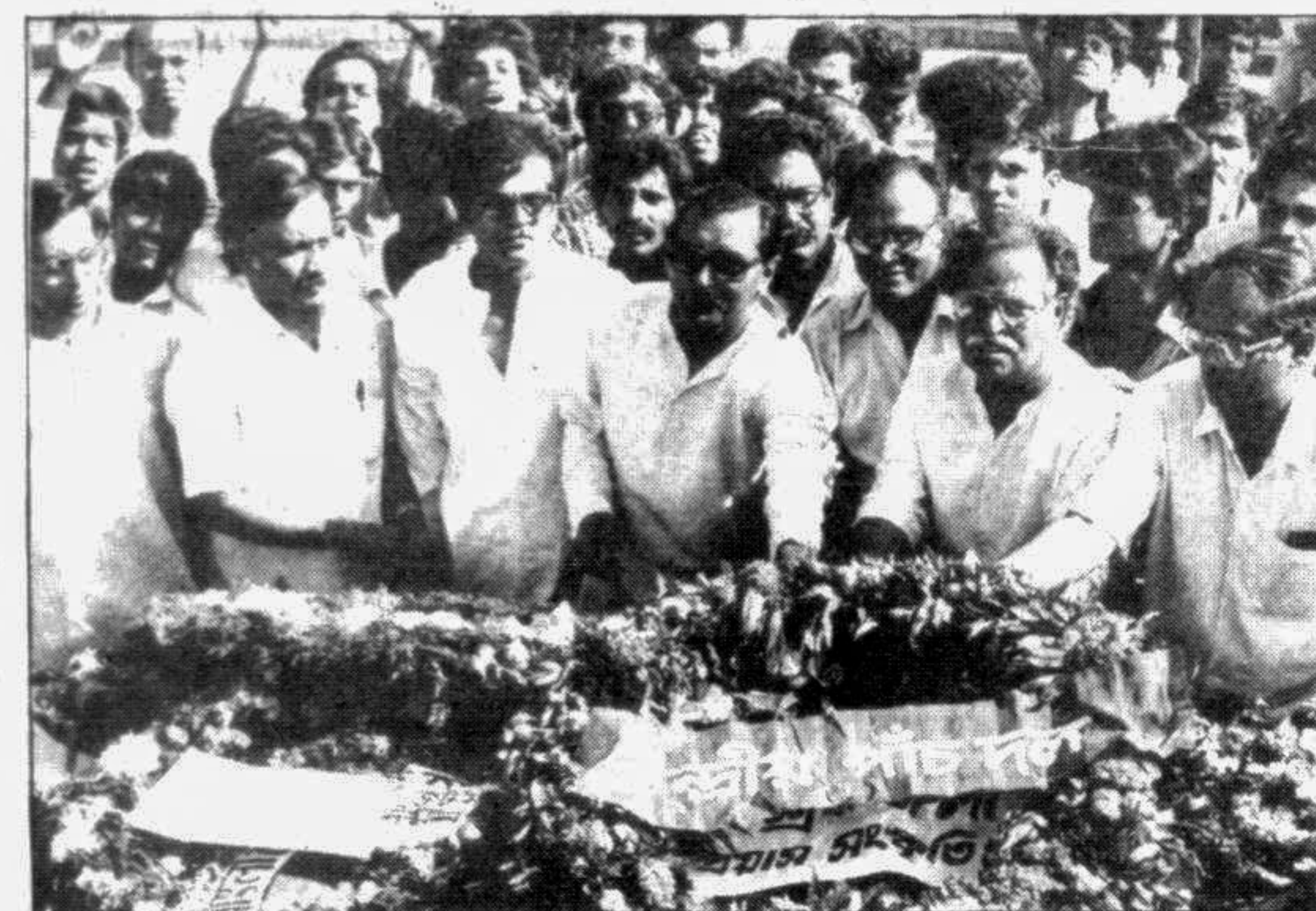
The Five-Party Alliance