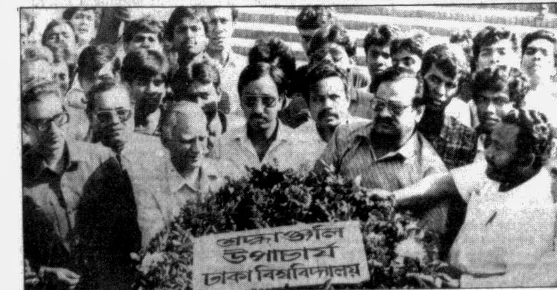
Dhaka University Vice-Chancellor