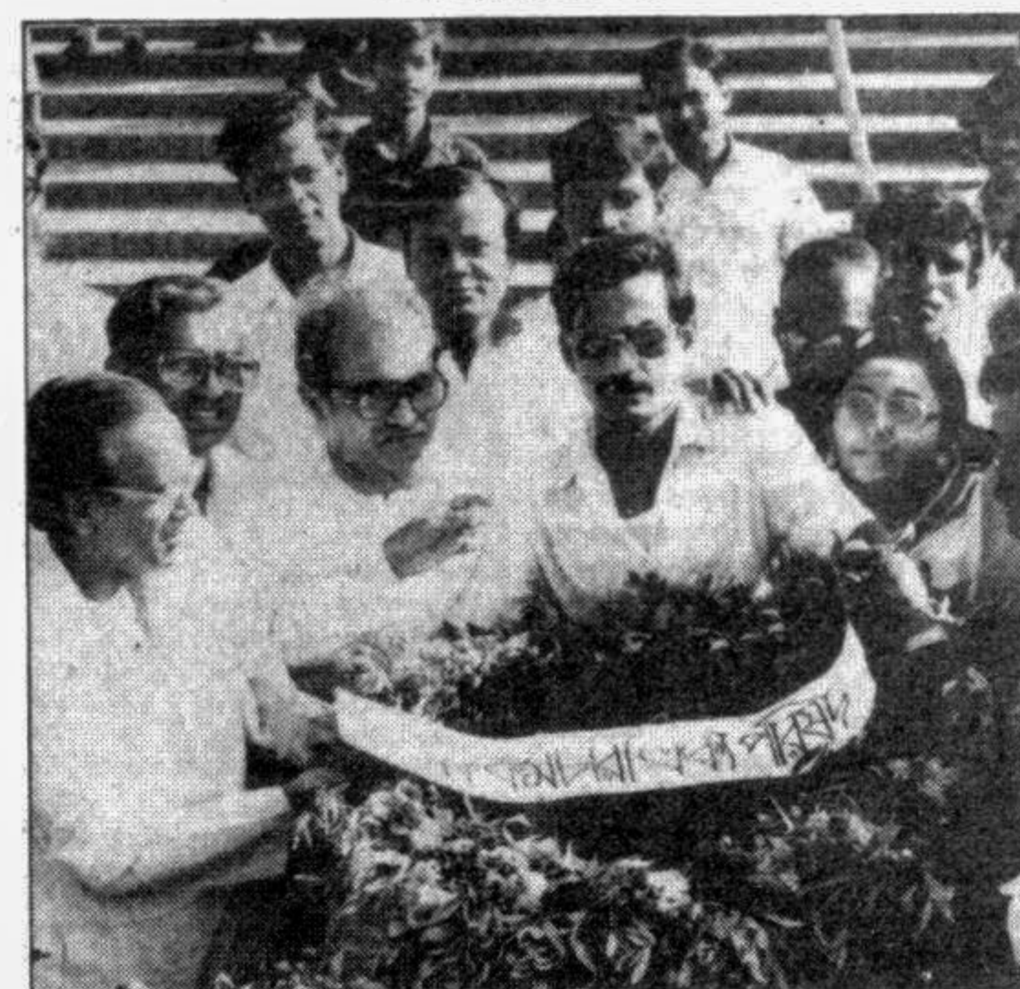
Sramik Karmachari Oikya Parishad (SKOP)