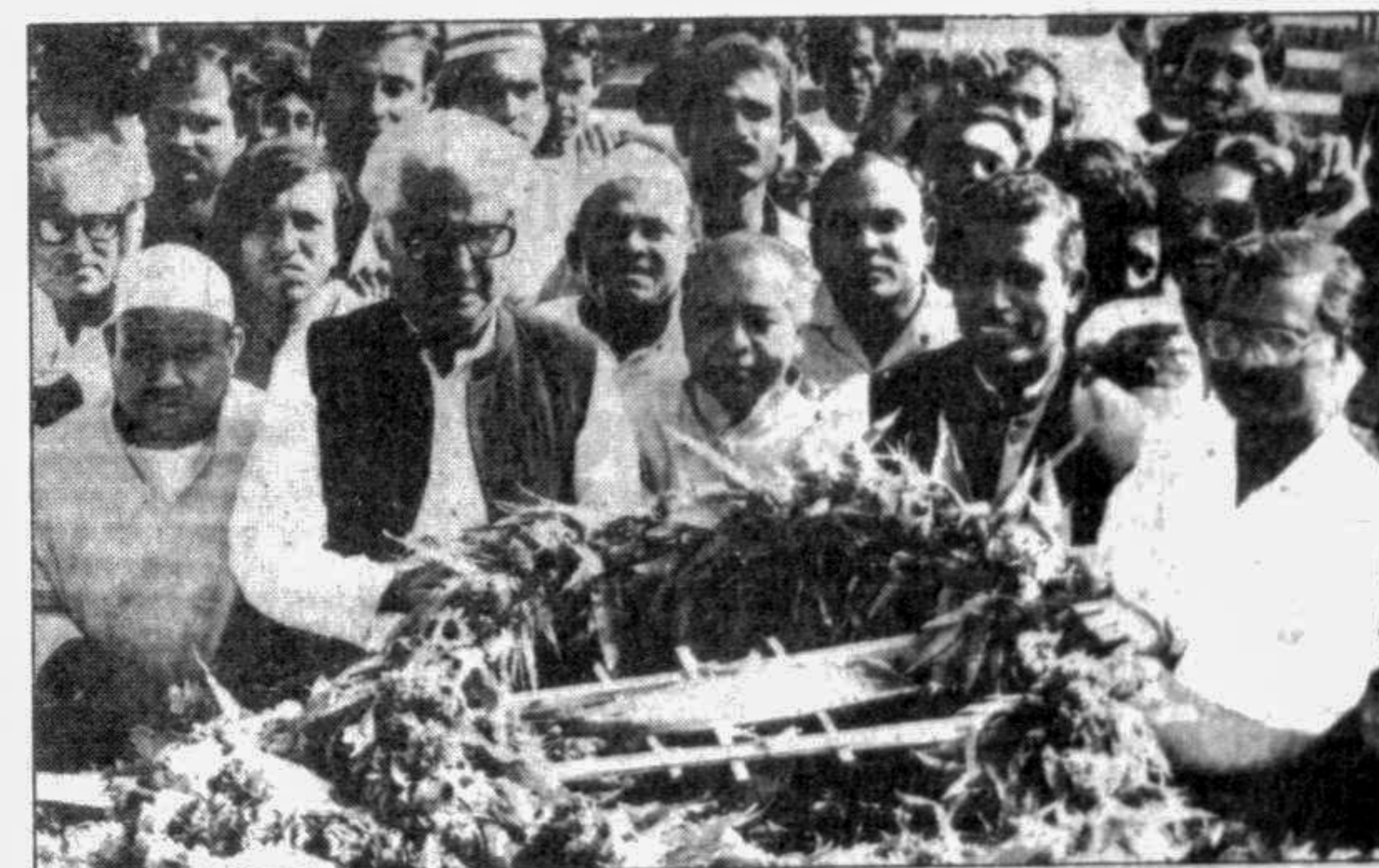
Bangladesh Krishak Sramik Awami League