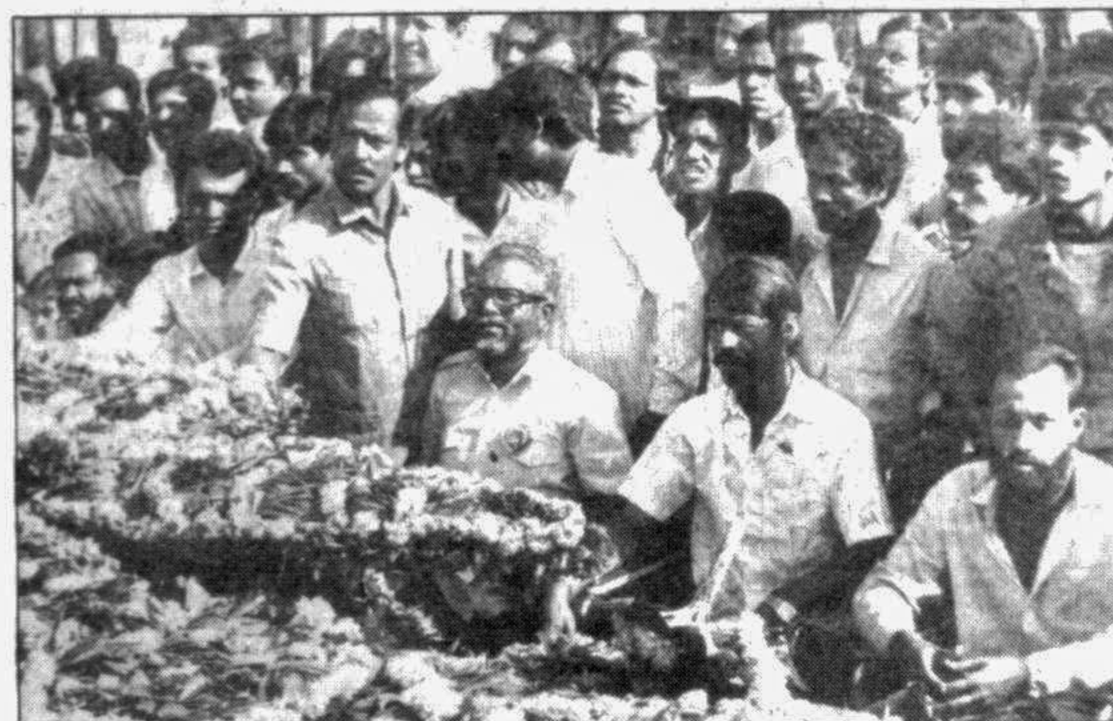
The disabled freedom fighters