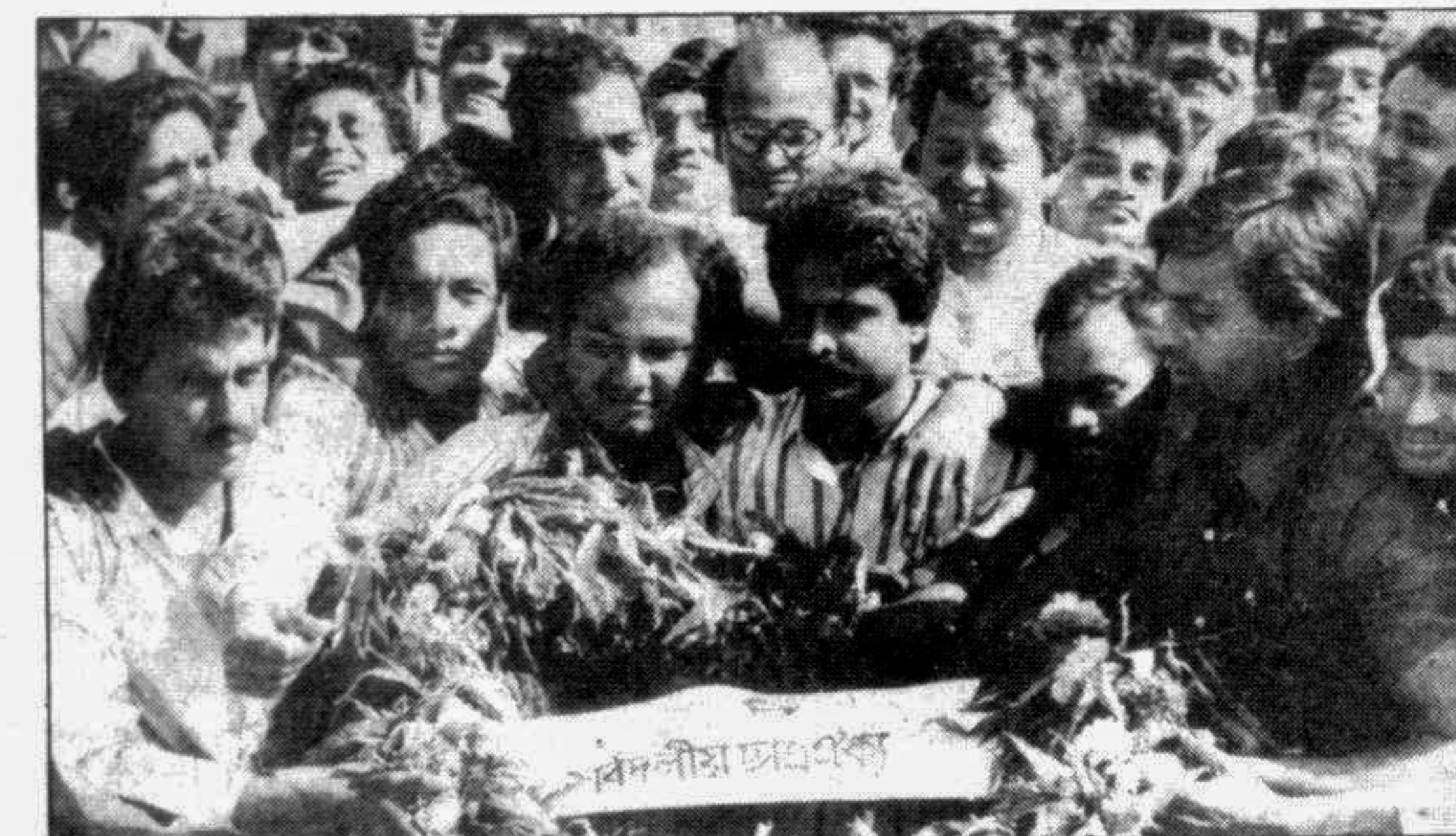
The All-Party Students Unity.