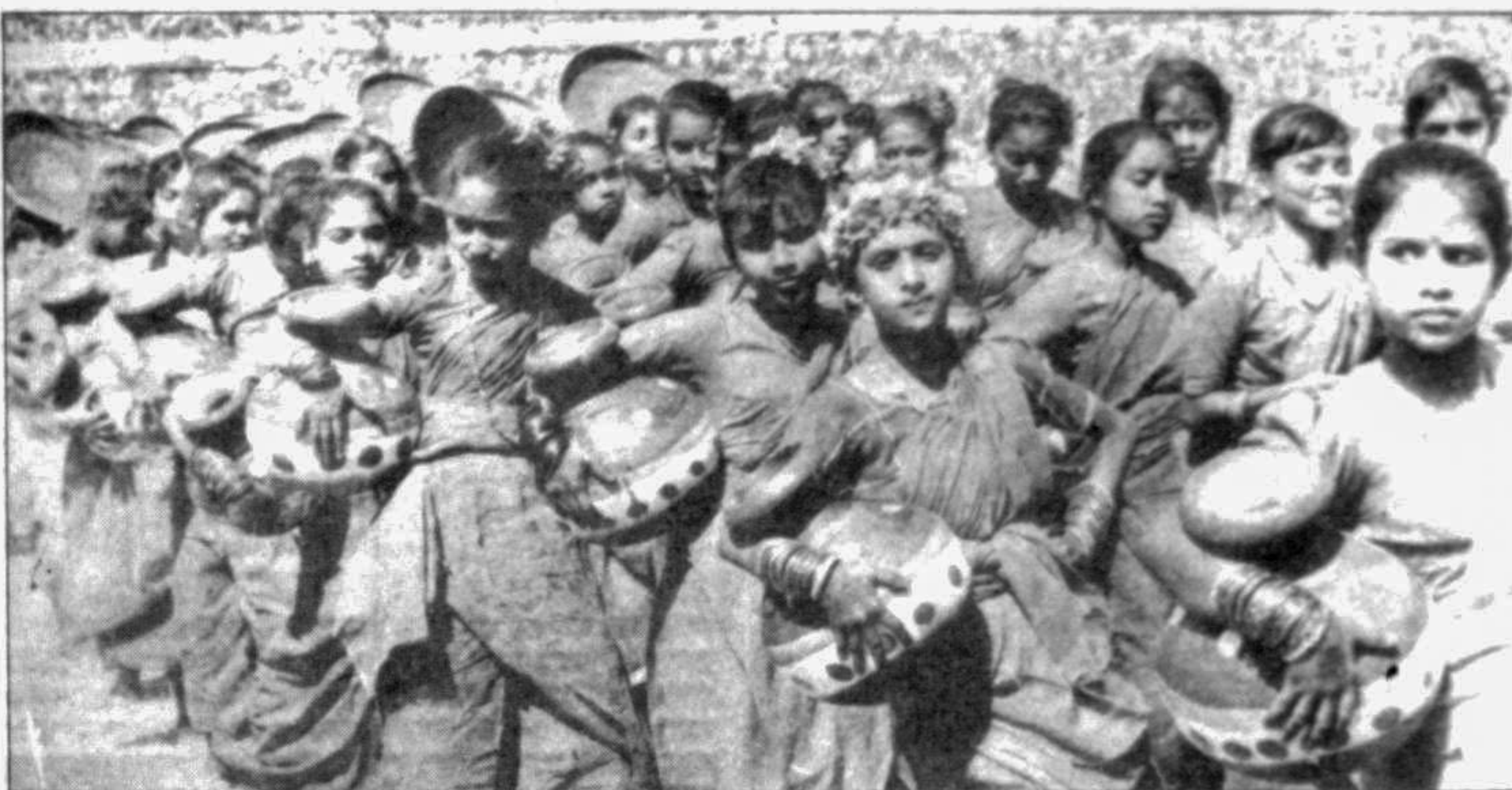
Going to the river to fetch water.