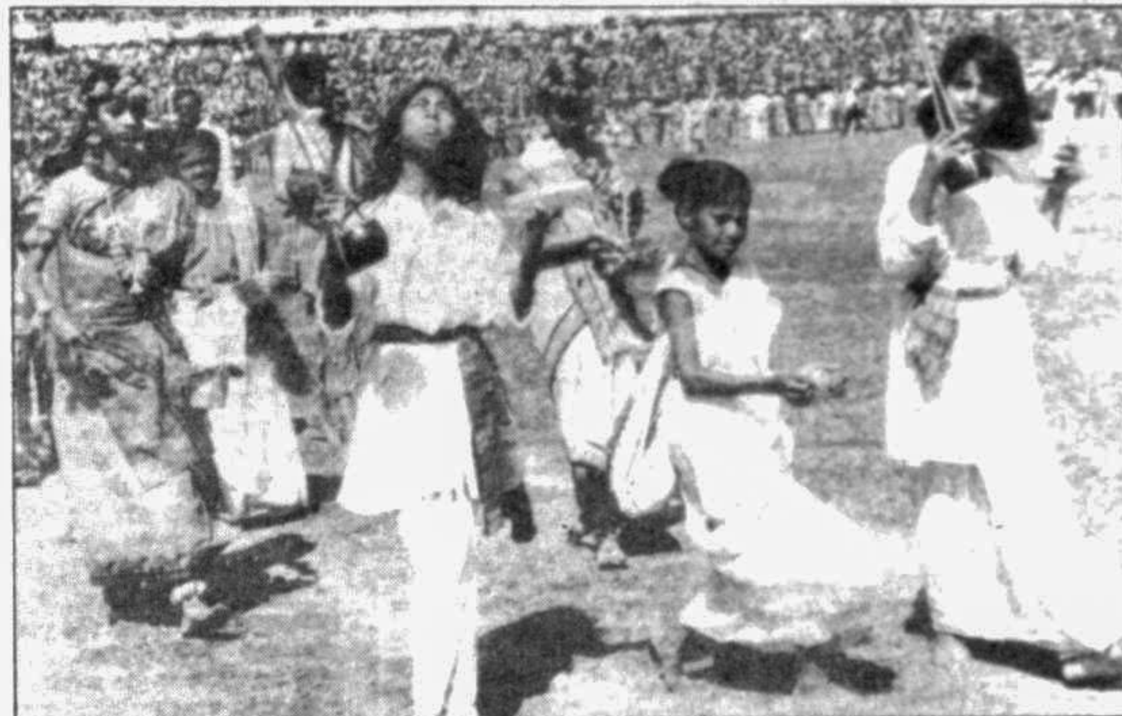
The wandering 'baults' at Dhaka Stadium.