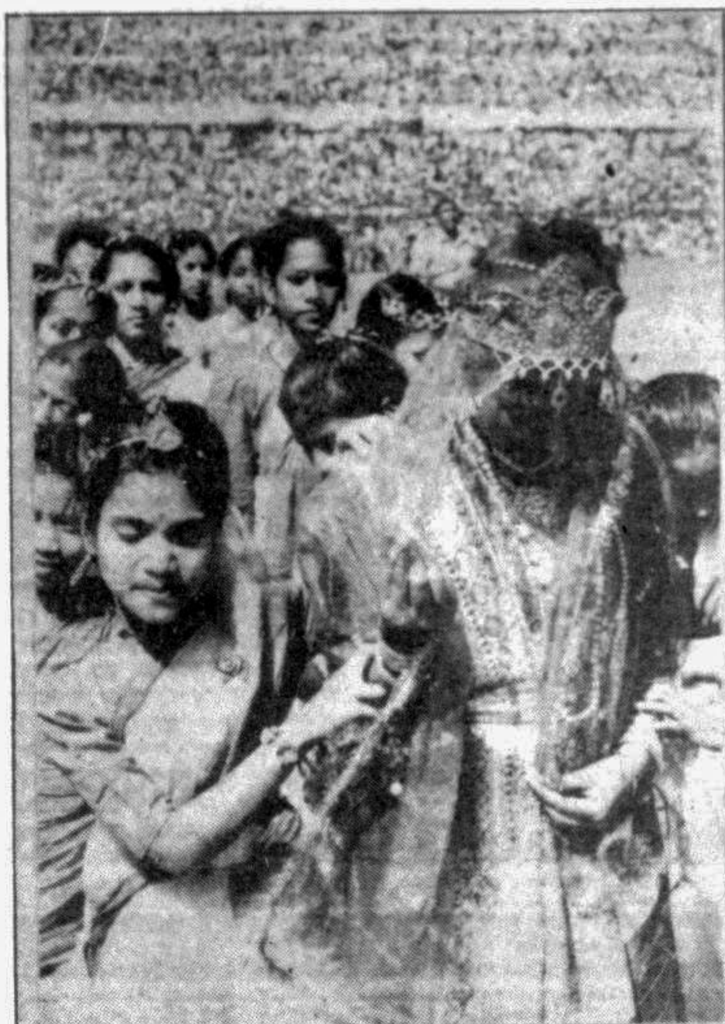
Playing the bride.