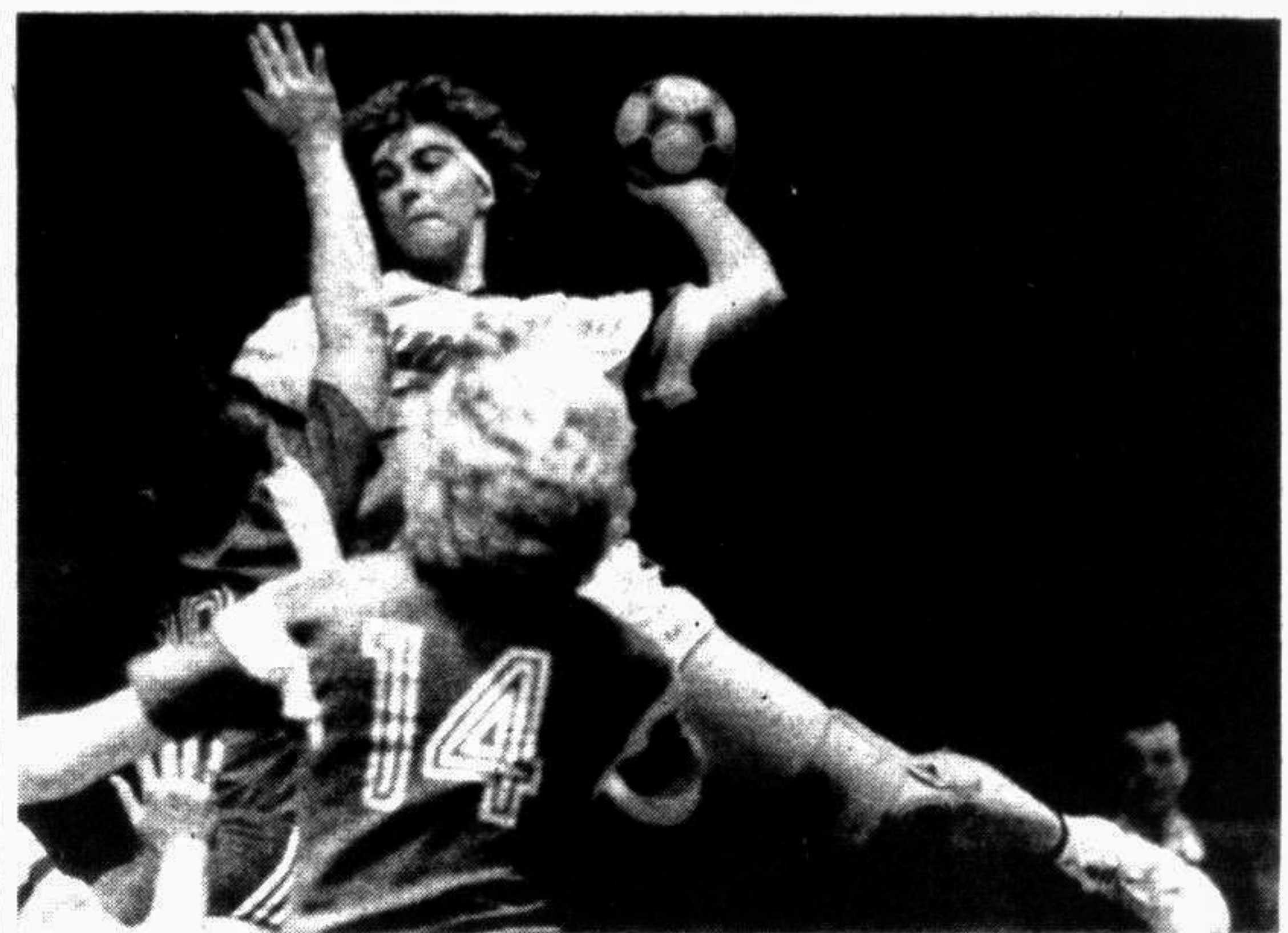
Unification is bound to make the German women's handball team even more strong.