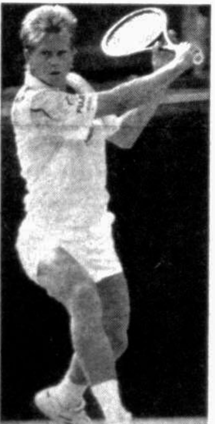
STEFAN EDBERG takes place today. The top-seeded Edberg

The women's final between second seed Monica Seles of Yugoslavia and third seed Gabriela Sabatini of Argentina