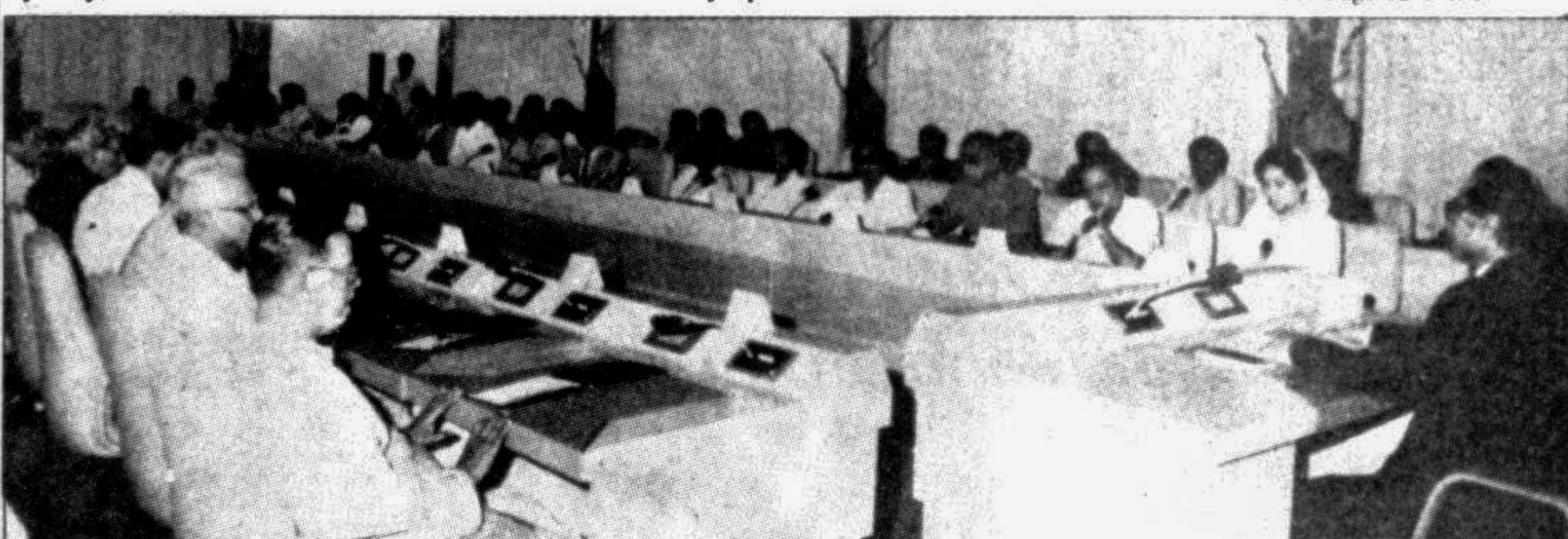
Acting President Justice Shahabuddin presiding over the first meeting of the Council of Ministers Thursday.

Barrister Rafiqul Islam Mia, State Minister for Labour and Manpower said he tried to acquaint himself to the activities of his ministry by having meetings with senior officials. See Page 12 Col. 1