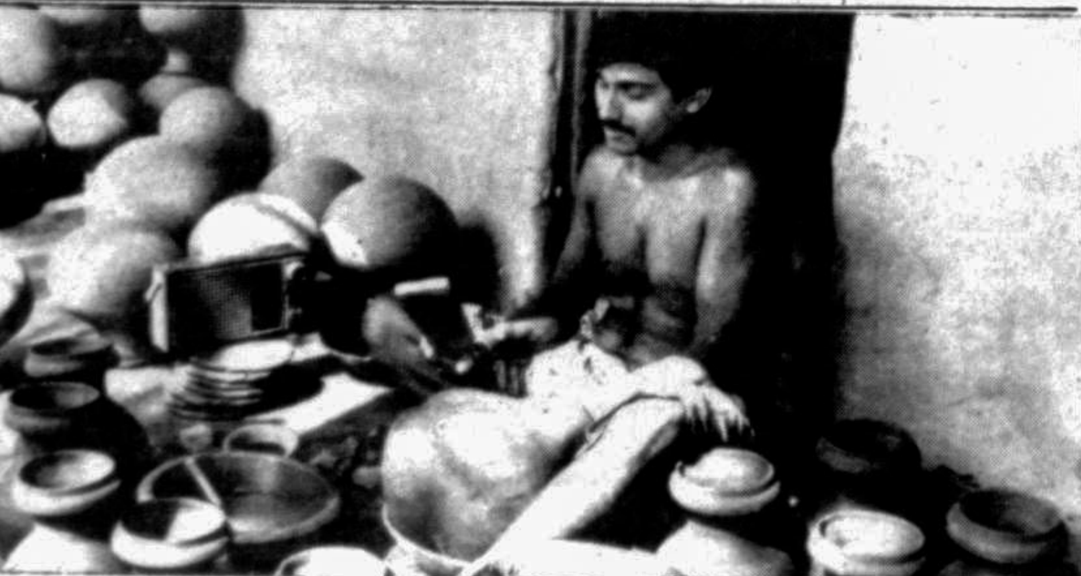
While running his shop at a rural hat this potter is enjoying radio programmes.