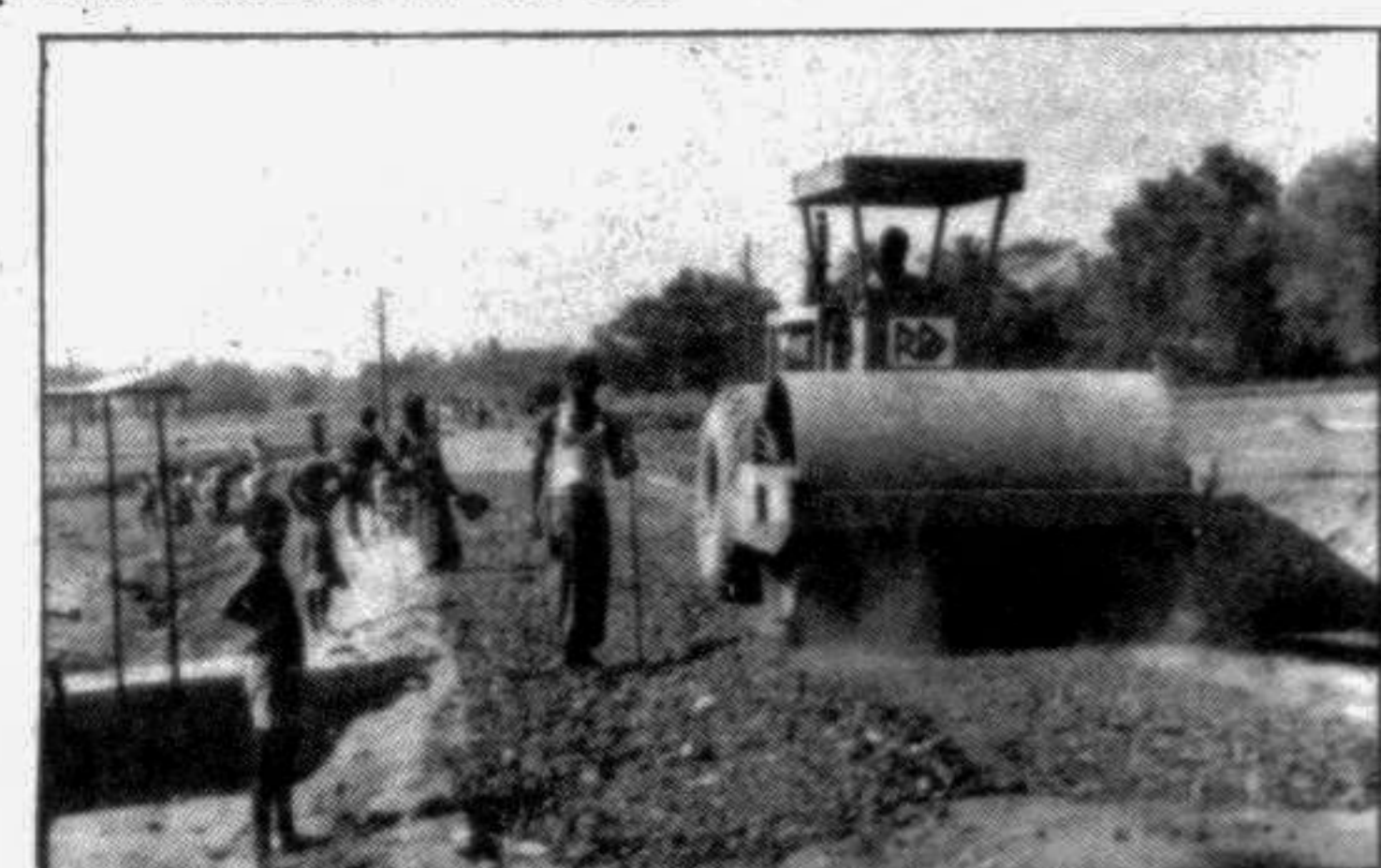
Development work of Mymensingh-Netrakona road in progress.