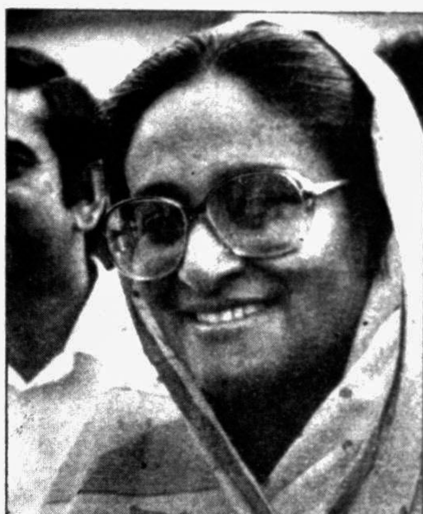
Awami League president Sheikh Hasina at a city committee meeting of the party Friday.

Awami League President Sheikh Hasina on Friday deplored that the Acting President has created a vacuum in the administration by dissolving his Council of Advisers without prior discussion with the three mainstream political alliances.