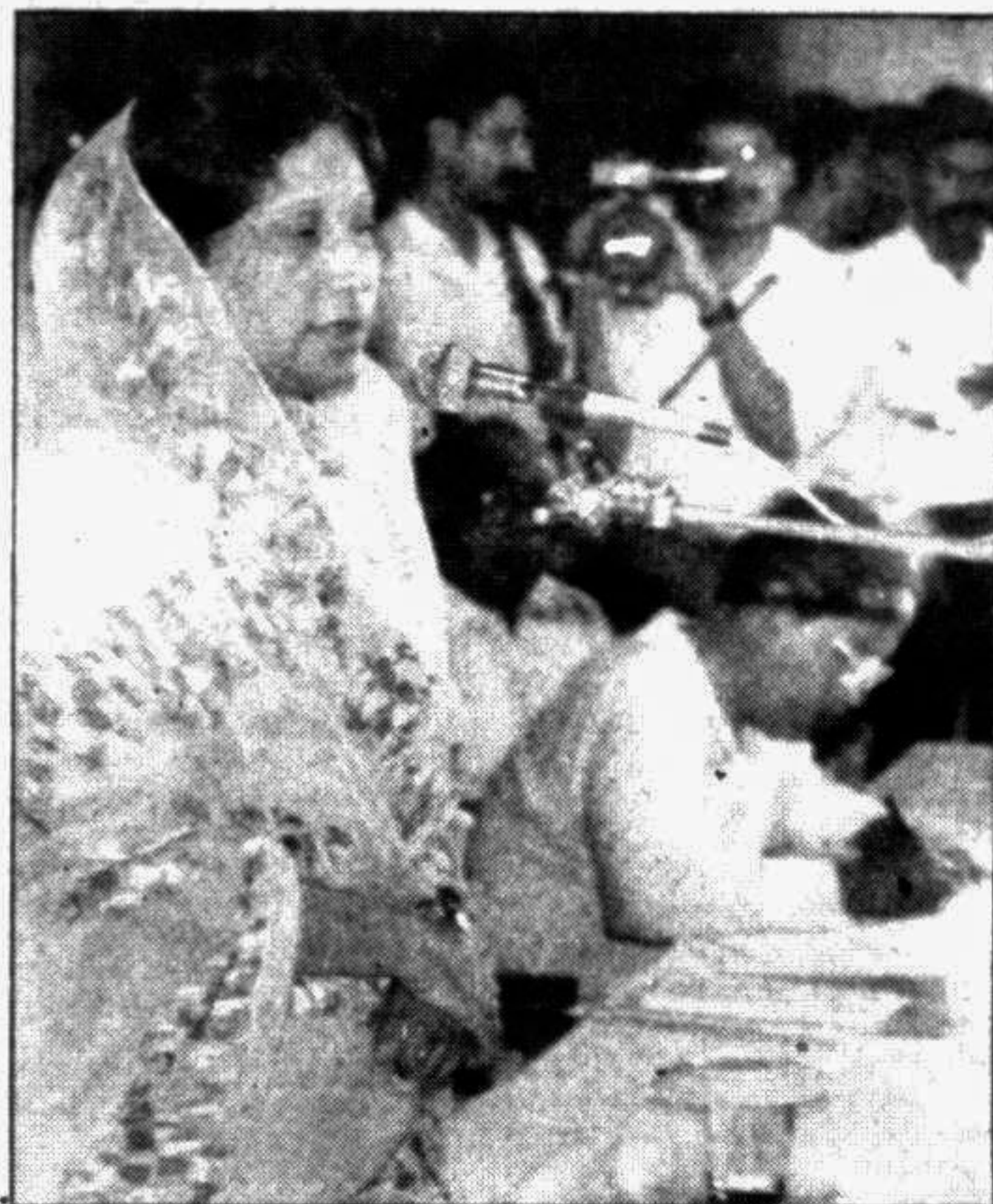
BNP chief Begum Khaleda Zia addressing an extended meeting of the party in the capital Friday.

Begum Khaleda Zia, chairperson of BNP, on Friday asked her party MPs-elect to maintain unity and remain alert against attempts of 'conspirators' to create division, and not to indulge in corruption.