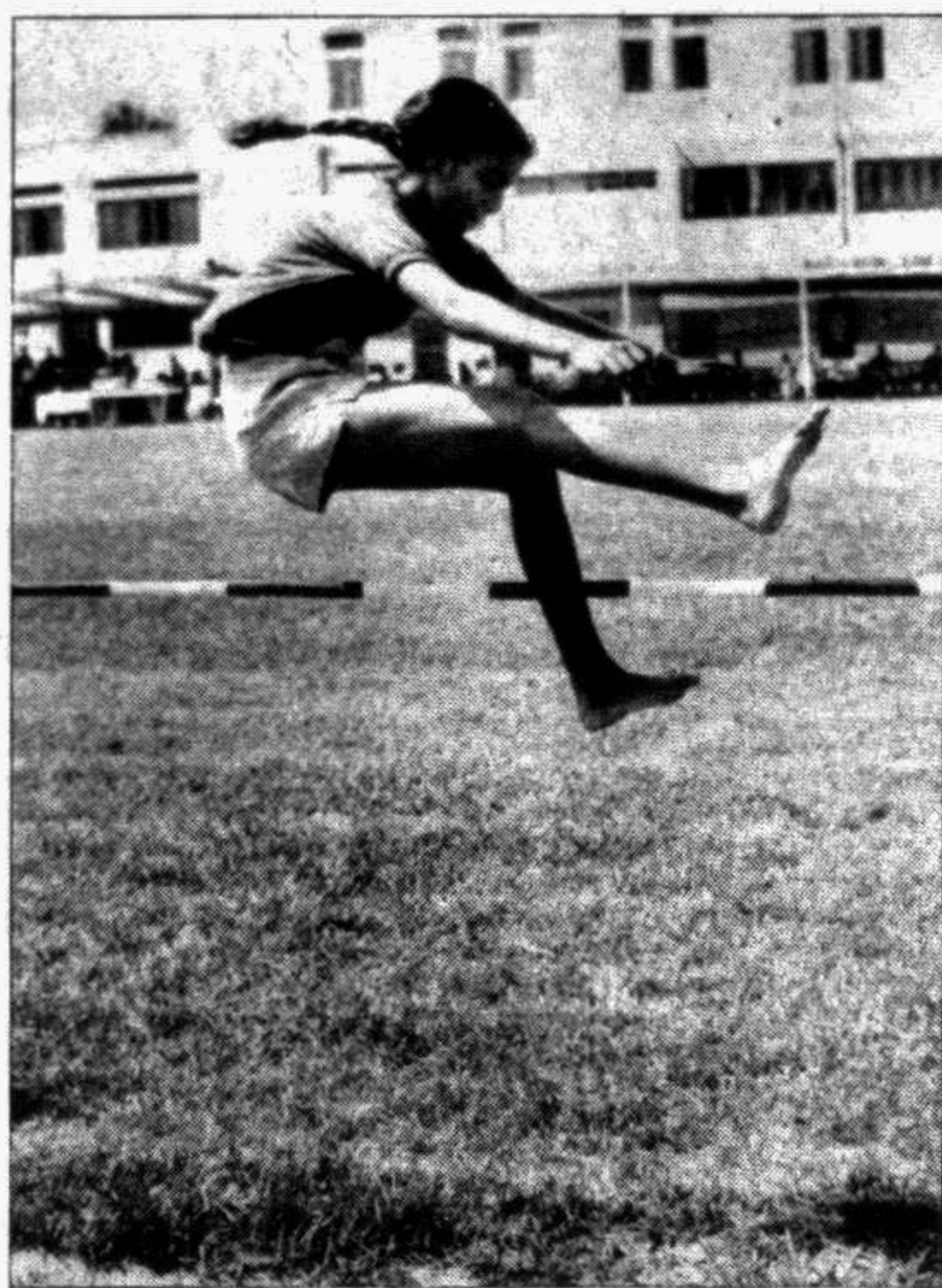
Action from the Dhaka Divisional women's athletics championships at the Dhanmandi Women's Sports Complex yesterday.