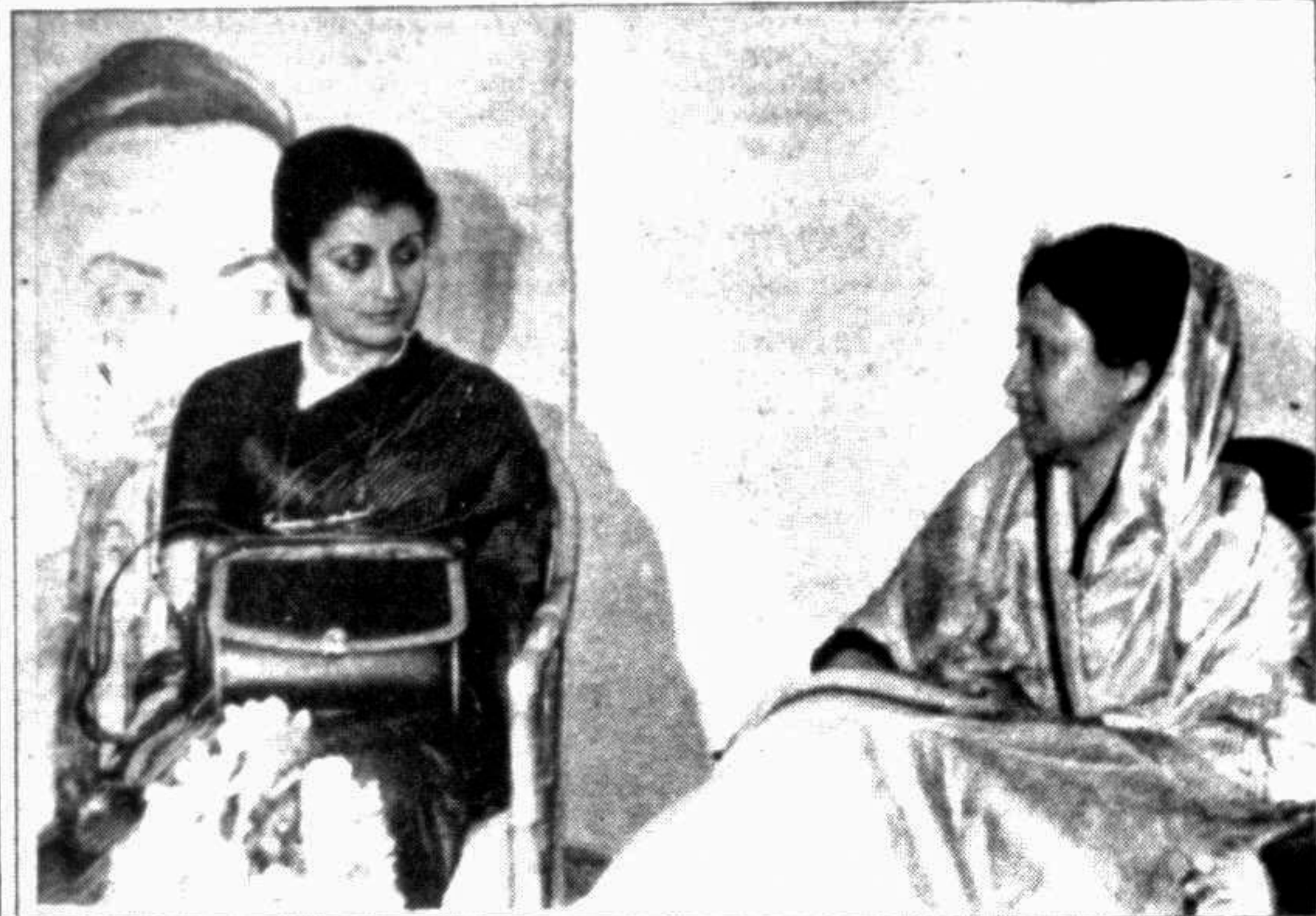
Aparna Sen having a tete-a-tete with the BNP Chairperson, Khaleda Zia.