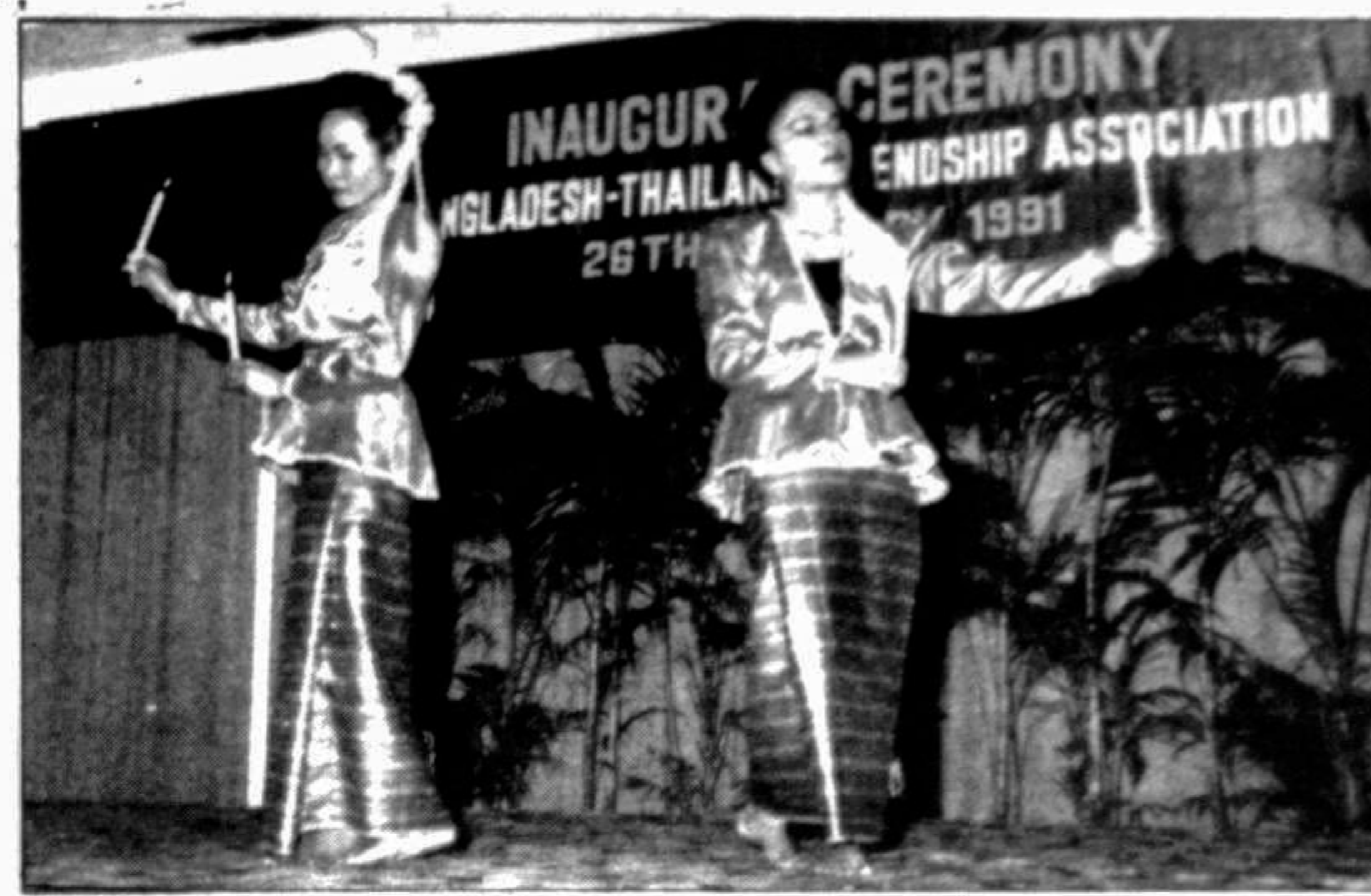
A Thai dancer seen performing during the inaugural ceremony of Bangladesh-Thailand Friendship Association held recently in Dhaka.

The complex comprises academic building, students residential hall and safe quarters it will be completed in nine months.