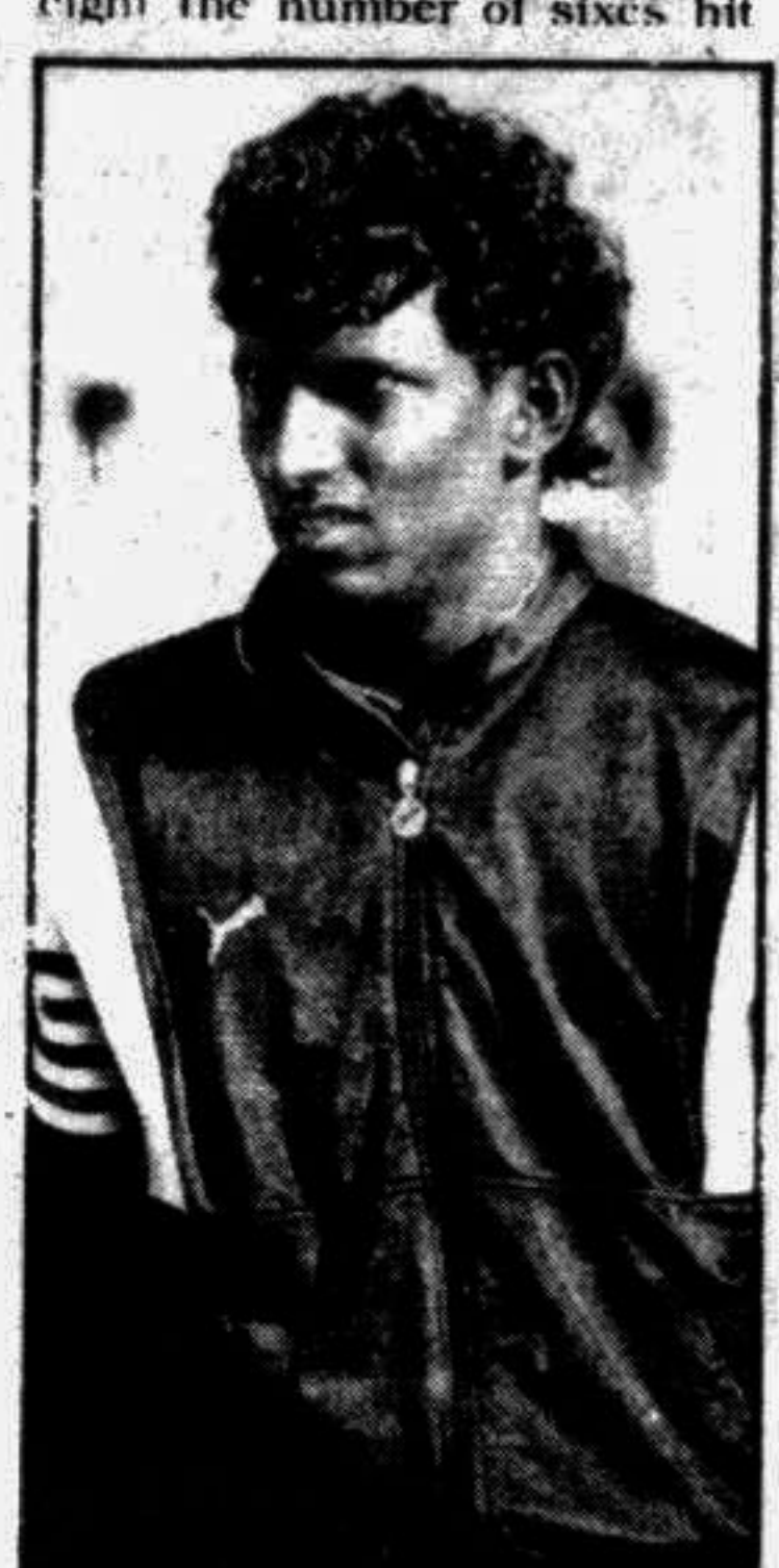
ARAVINDA DE SILVA