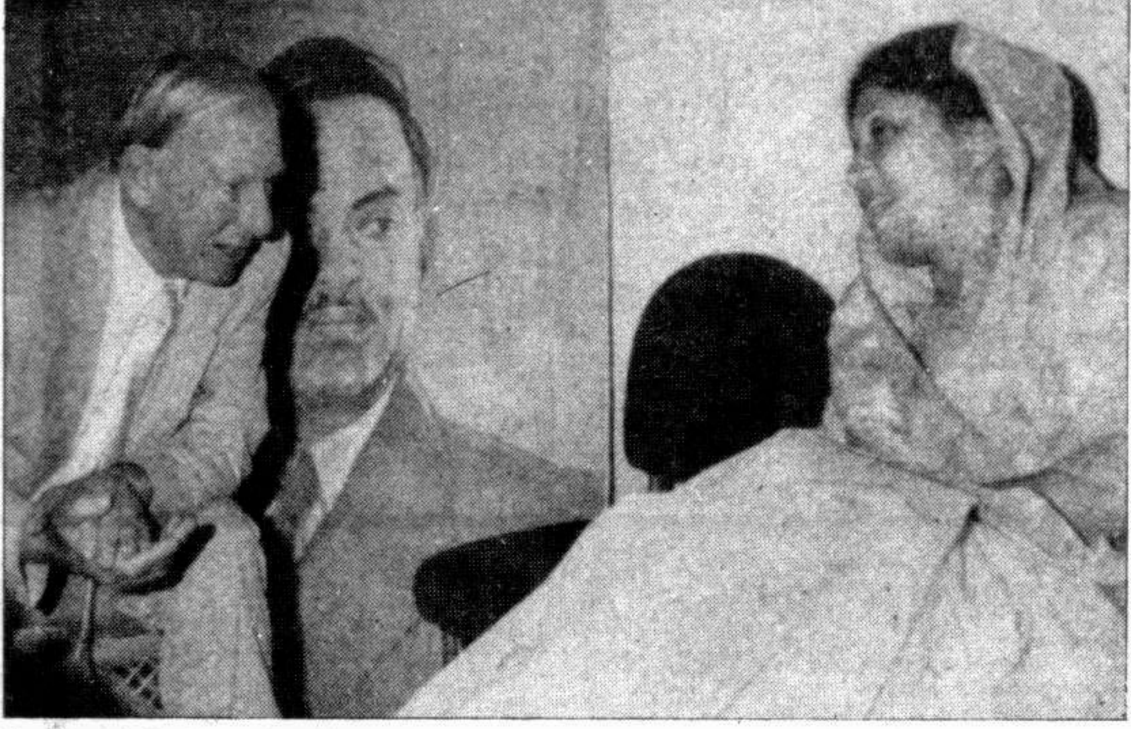
Leader of the British poll observer group Peter Shore and BNP chief Khaleda Zia exchanging views at BNP Banani office Friday.

The political analysts strongly believe that BNP will be able to form the government with clear majority.