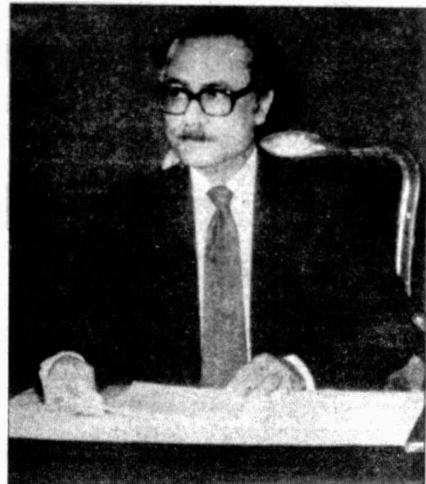
Acting President Justice Shahabuddin addressing nation on Friday.

Justice Shahabuddin said, right from the beginning of his tenure he was saying that he would go back to his original post and if there had been no constitutional obstacles, he