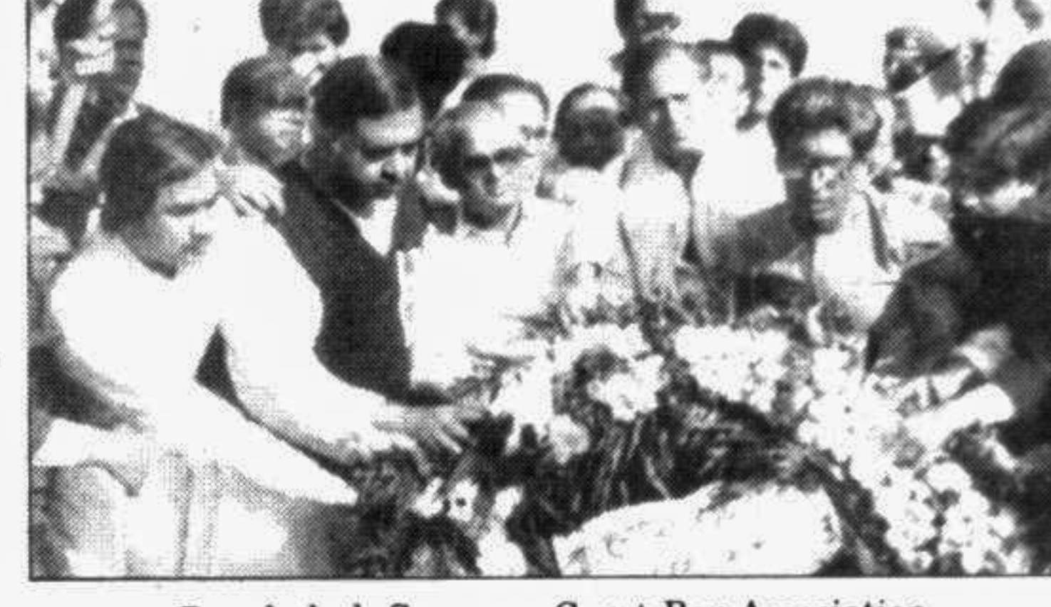
Bangladesh Supreme Court Bar Association