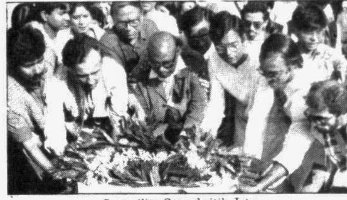
Sammilita Sangskritik Jote