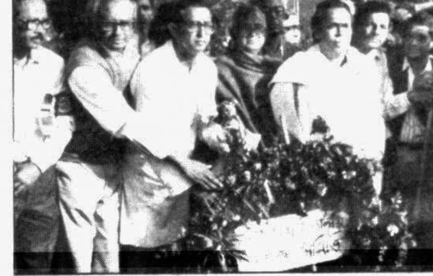
Dhaka University Teachers' Association