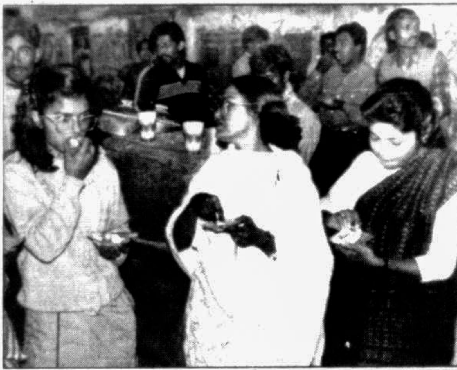
Eating together at the snack-shop on TSC road island.

Nobody would be shocked if a boy or a girl held hands and walked across the campus today. In most ways it has prevented from a stifling atmosphere to creep through the campus walls. Nor are there any "untoward" incidents which could cause anxiety to parents worried about the "moral state" of freshmen and sophomores. That has been achieved because over a period of time the canopy of freedom and responsibility has been raised at the august institution. And in raising that canopy with a flag flying high the humble teacup which brought the girl and the boy together as equals and sparked off the ideas and feelings of the future played an important role. Vive le teacup!