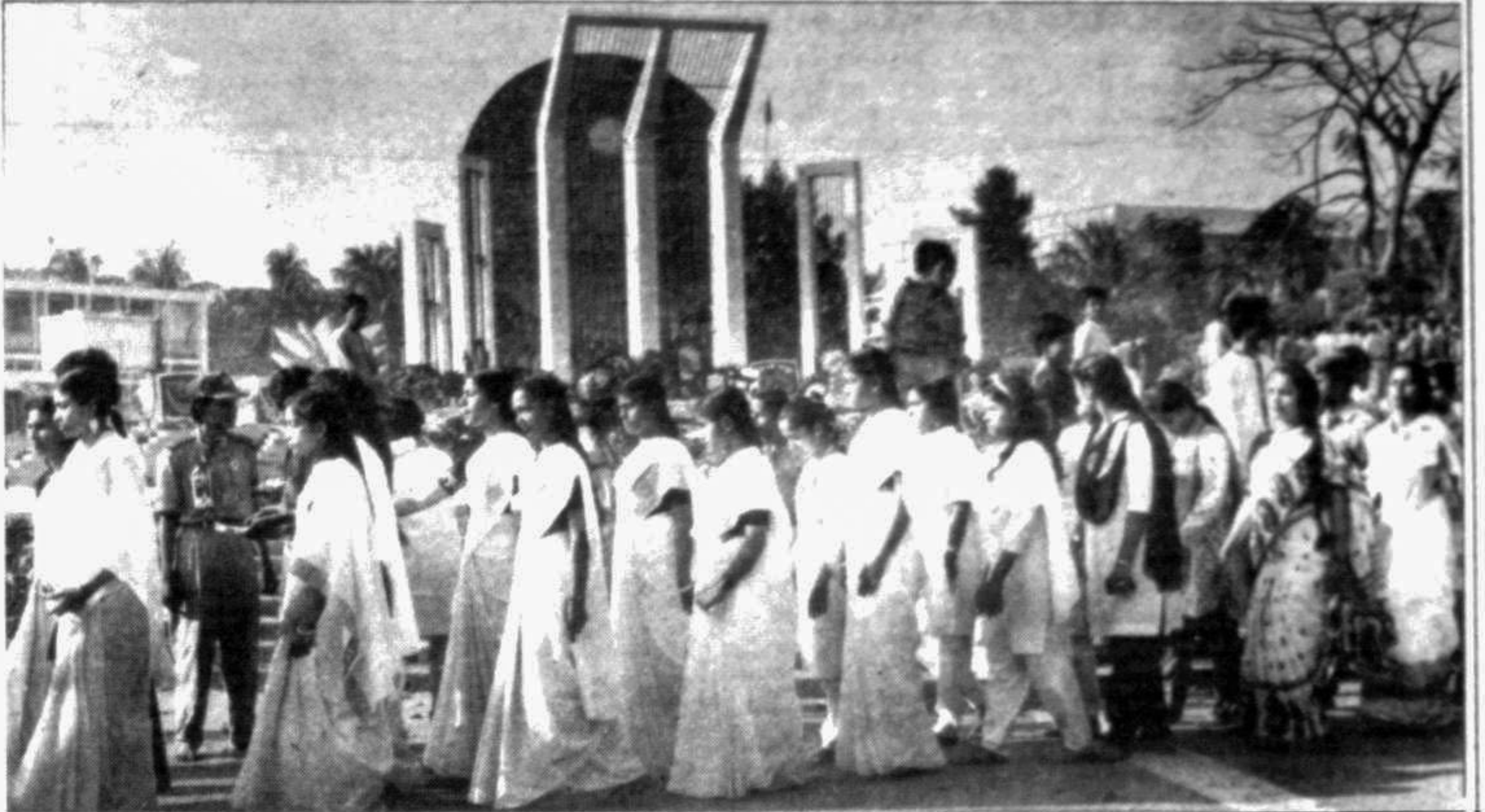
PRABHAT FERY - Barefooted ladies in orderly queue for their turn to pay homage to 1952 language martyrs at Central Shaheed Miner at dawn on Thursday.