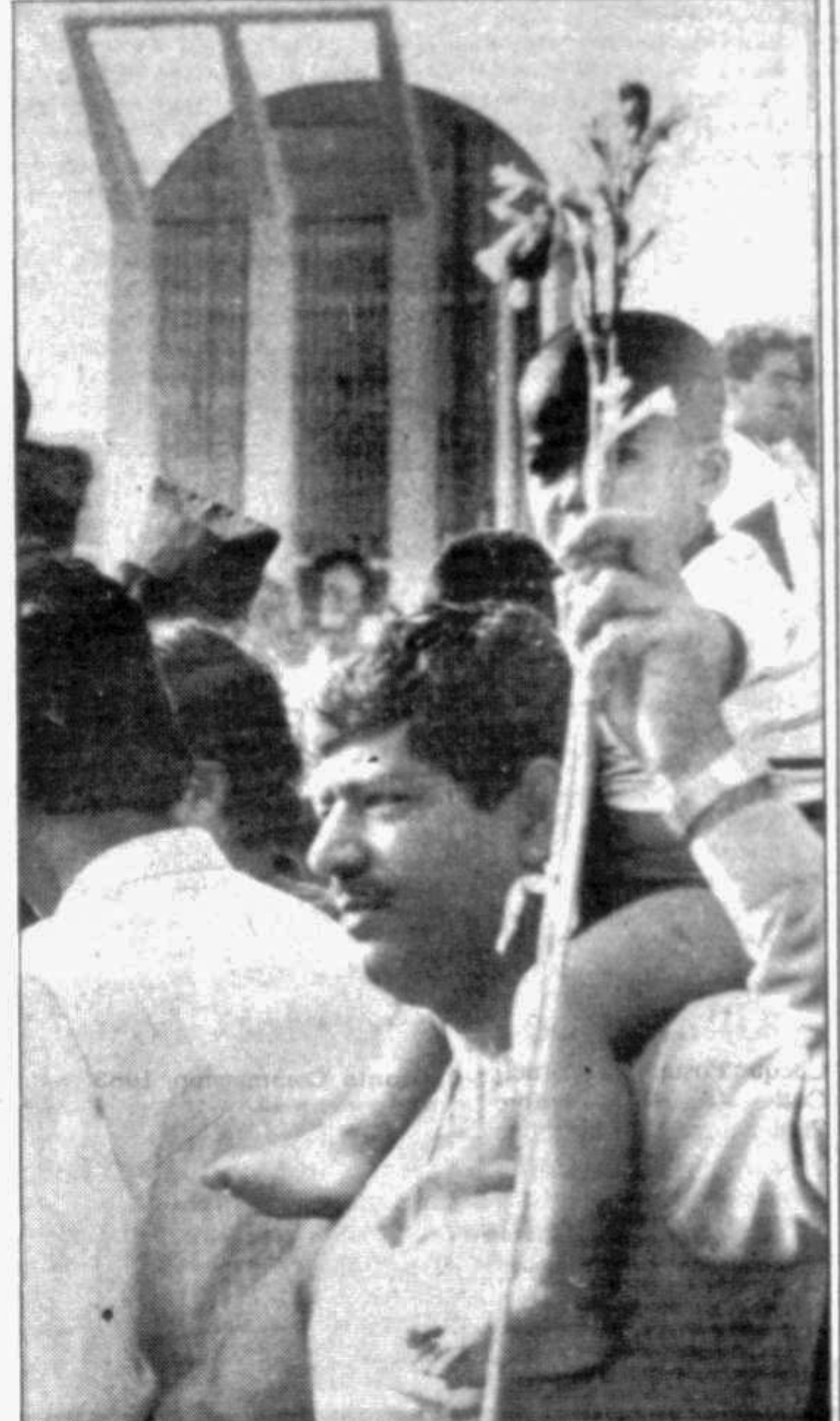
Even an infant does not miss the chance to visit the Minar.