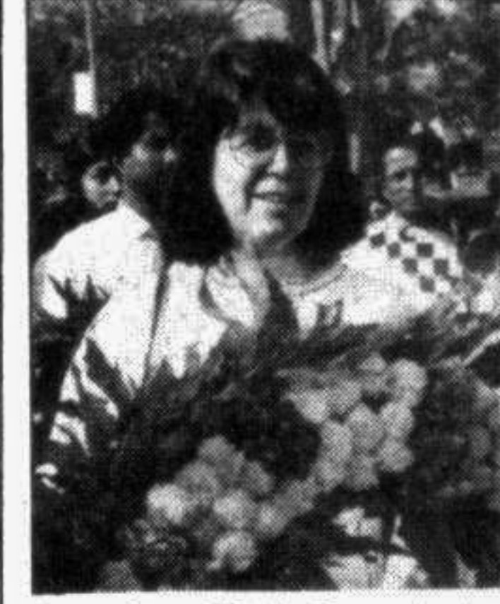
Canadian High Commission