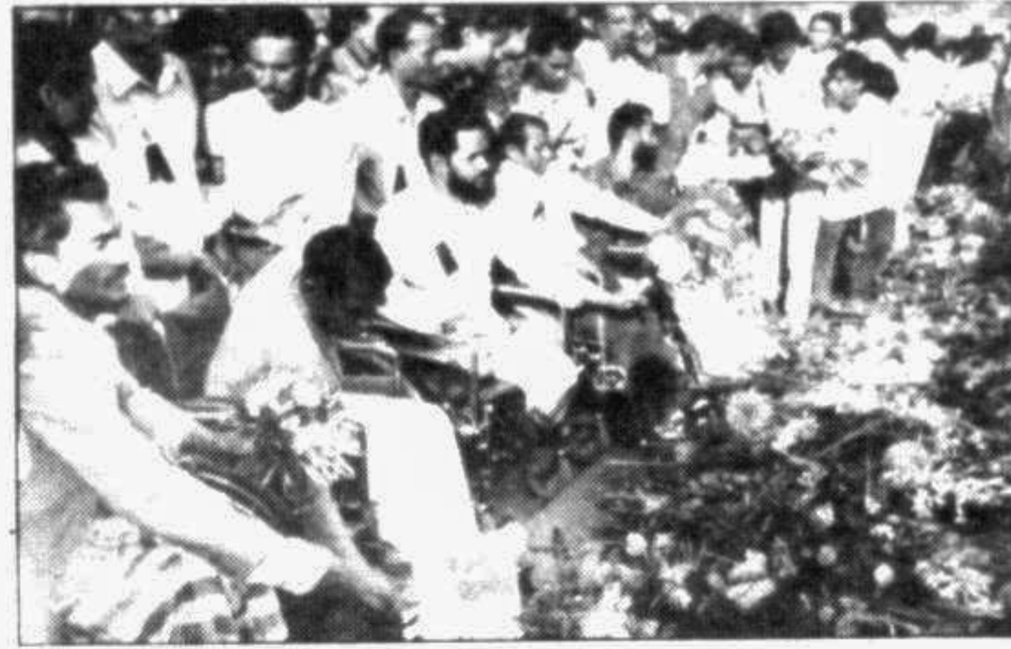
Disabled freedom fighters