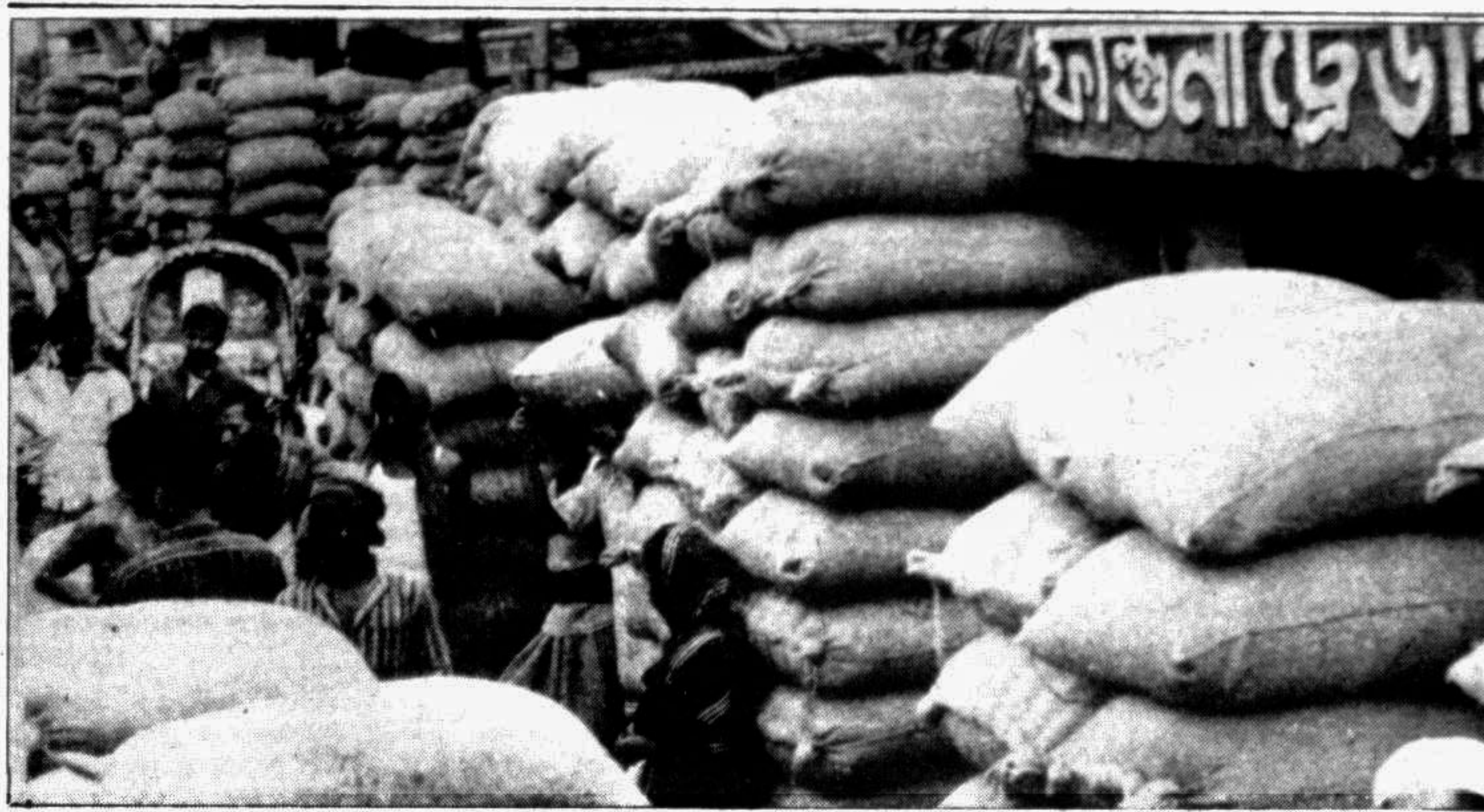
Rice supply is abundant in Badamtali wholesale market after rich harvest of Aman crops this year. Retail prices did not come down but it remains steady in Dhaka city for the last two weeks.