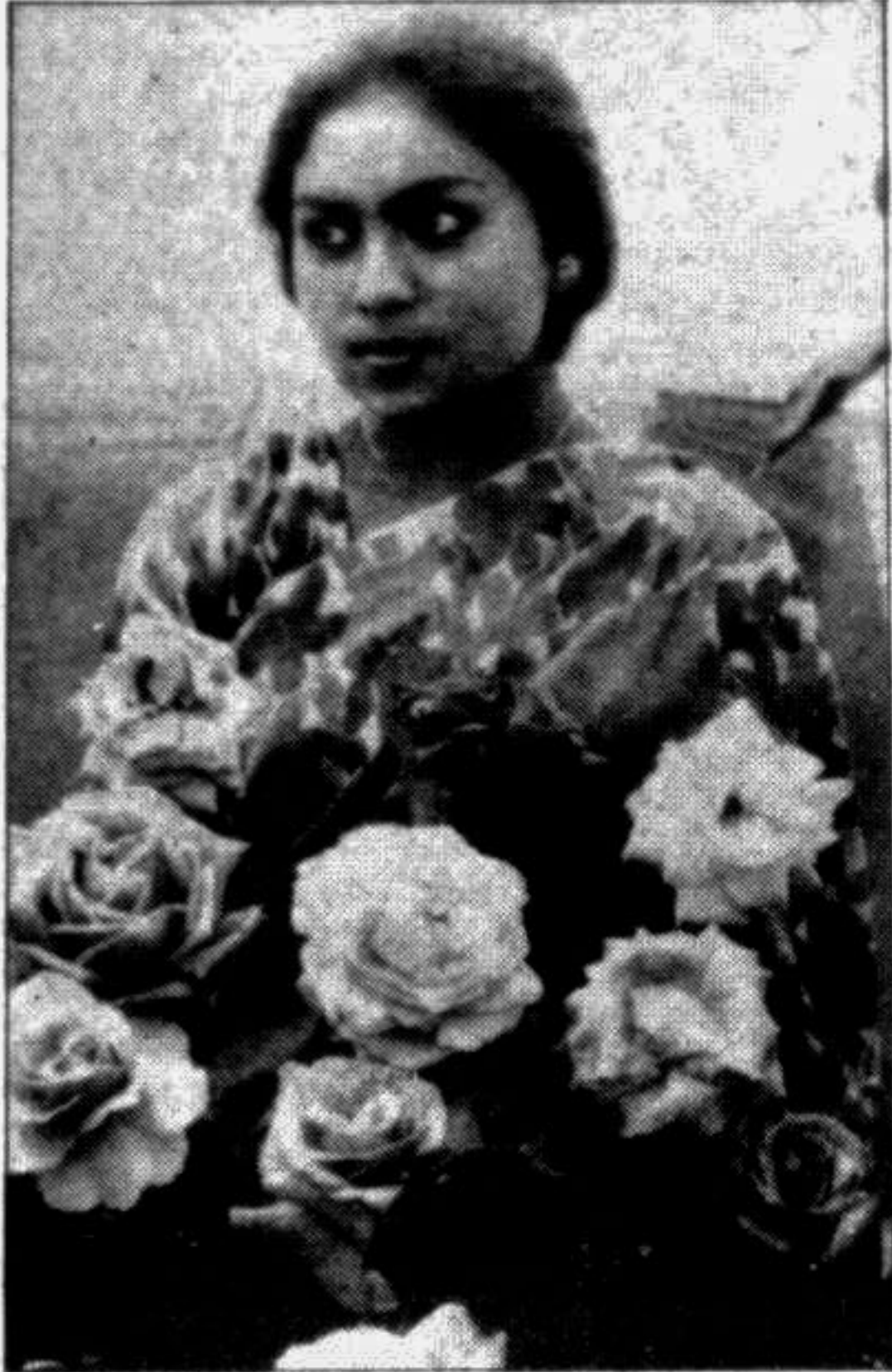
Roses everywhere at the festival in city on Friday.

Few people fail to enjoy the delightful fragrance of most roses which range from the odour of the damask to scents of other kinds that brings spices, fruit and even green tea in mind.