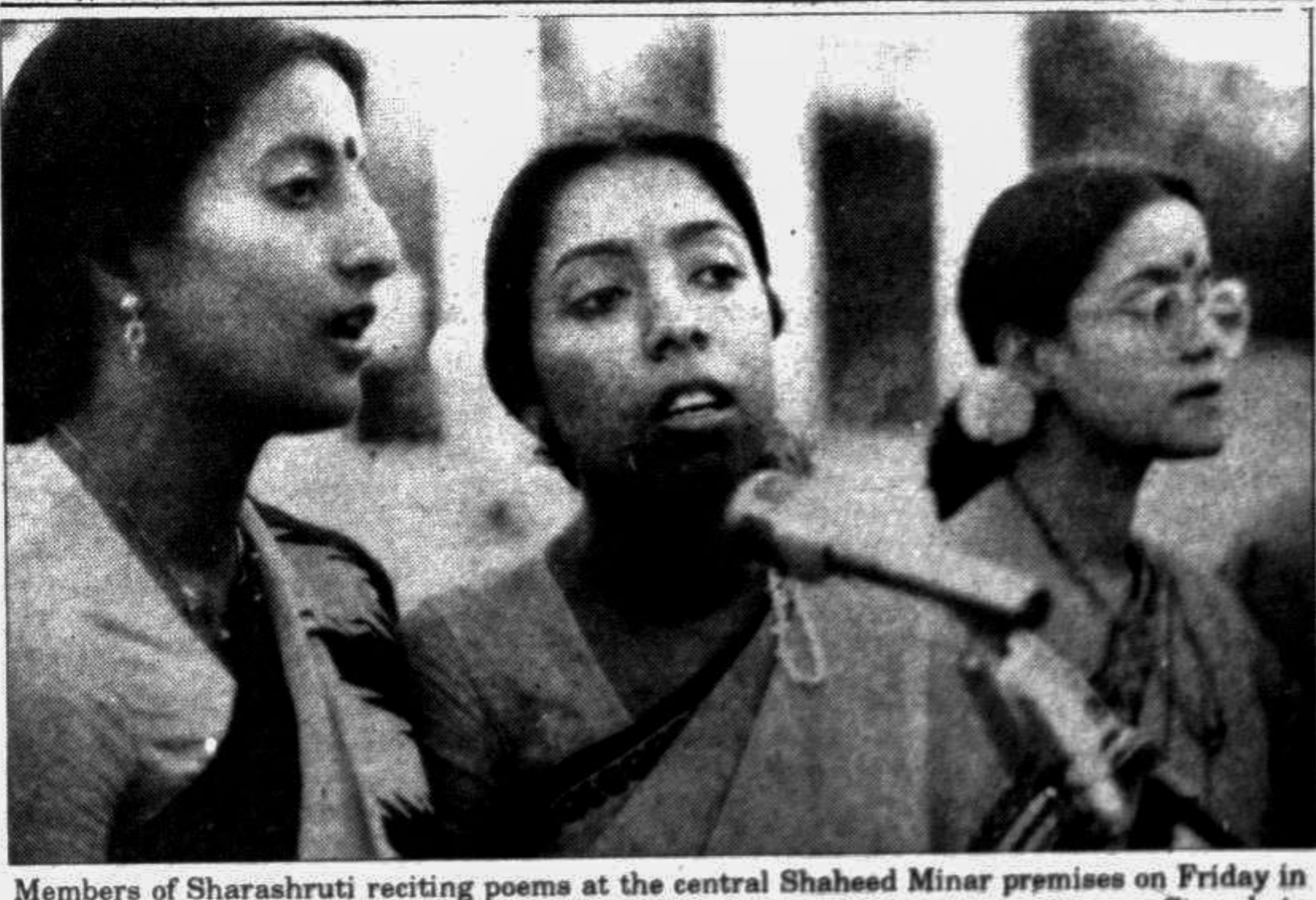
Members of Sharashruti reciting poems at the central Shaheed Minar premises on Friday in commemoration of language martyrs.

A boy was killed and two others injured when a truck turned turtle on Tongi-Joydevpur road on Wednesday evening.