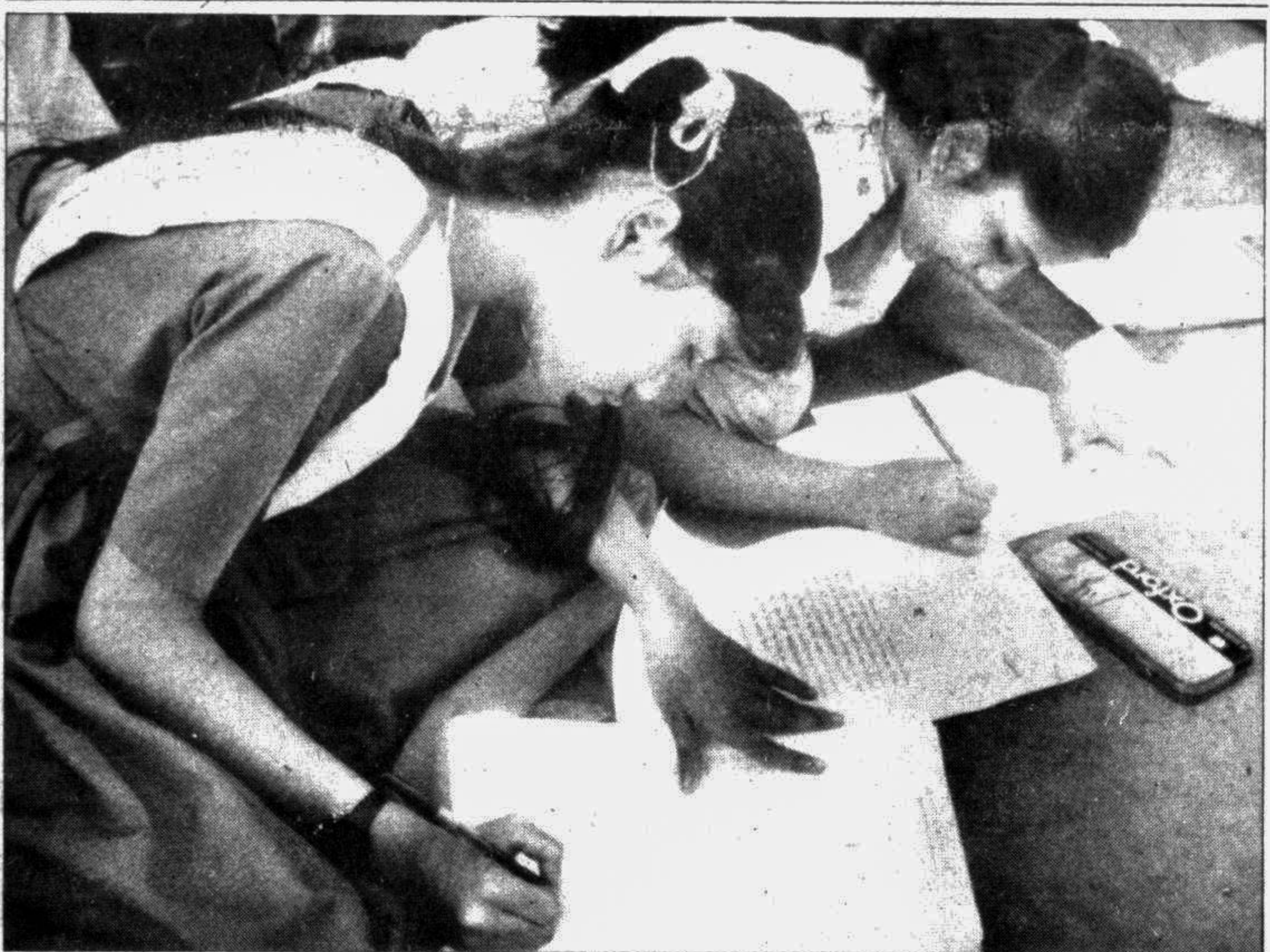
DO YOUR BEST... Children taking part in Bangla handwriting contest organised as part of National Museum Ekushey programme Friday.

BAGHDAD, Feb 15: Low-flying allied aircraft blasted the headquarters of Iraq's ruling Arab Baath Socialist Party in a pre dawn attack Friday.