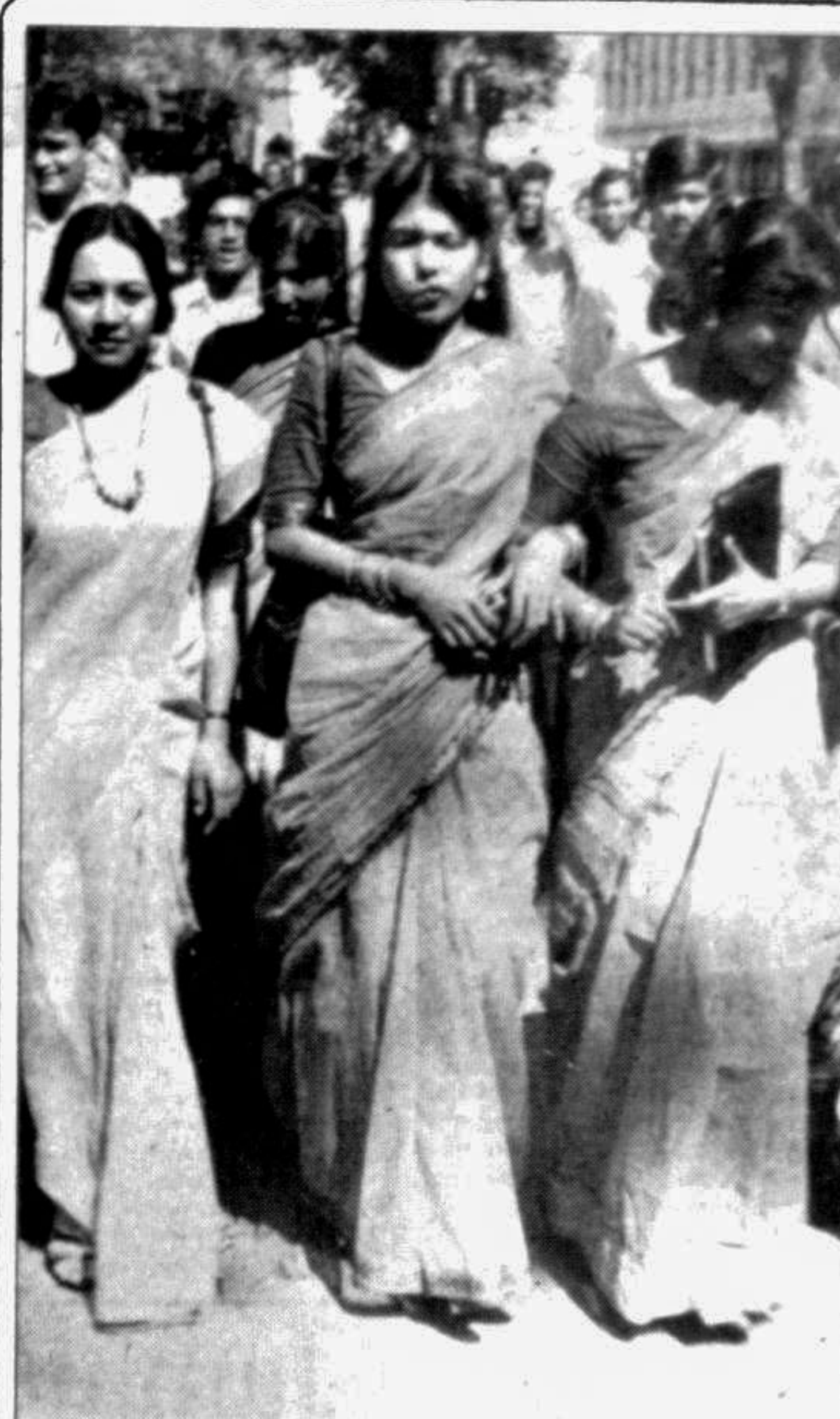
A group of Dhaka University female students in colourful saris and palms balm with 'mehedi' celebrating on Thursday the advent of Spring, the king of all seasons.