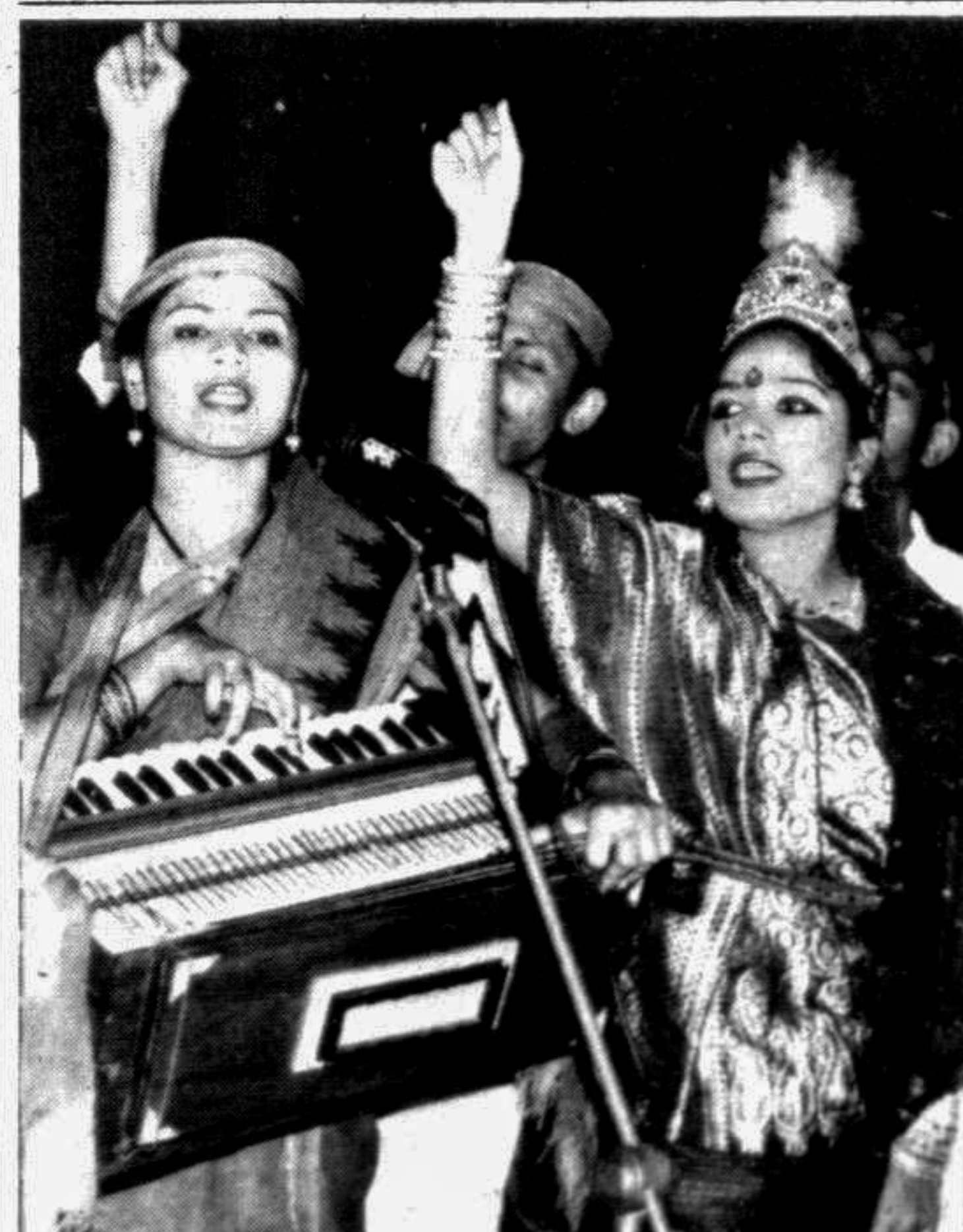
The Theatre, a cultural group from Arambagh staging a musical drama at the Central Shaheed Minar premises on Thursday in commemoration of the language martyrs.