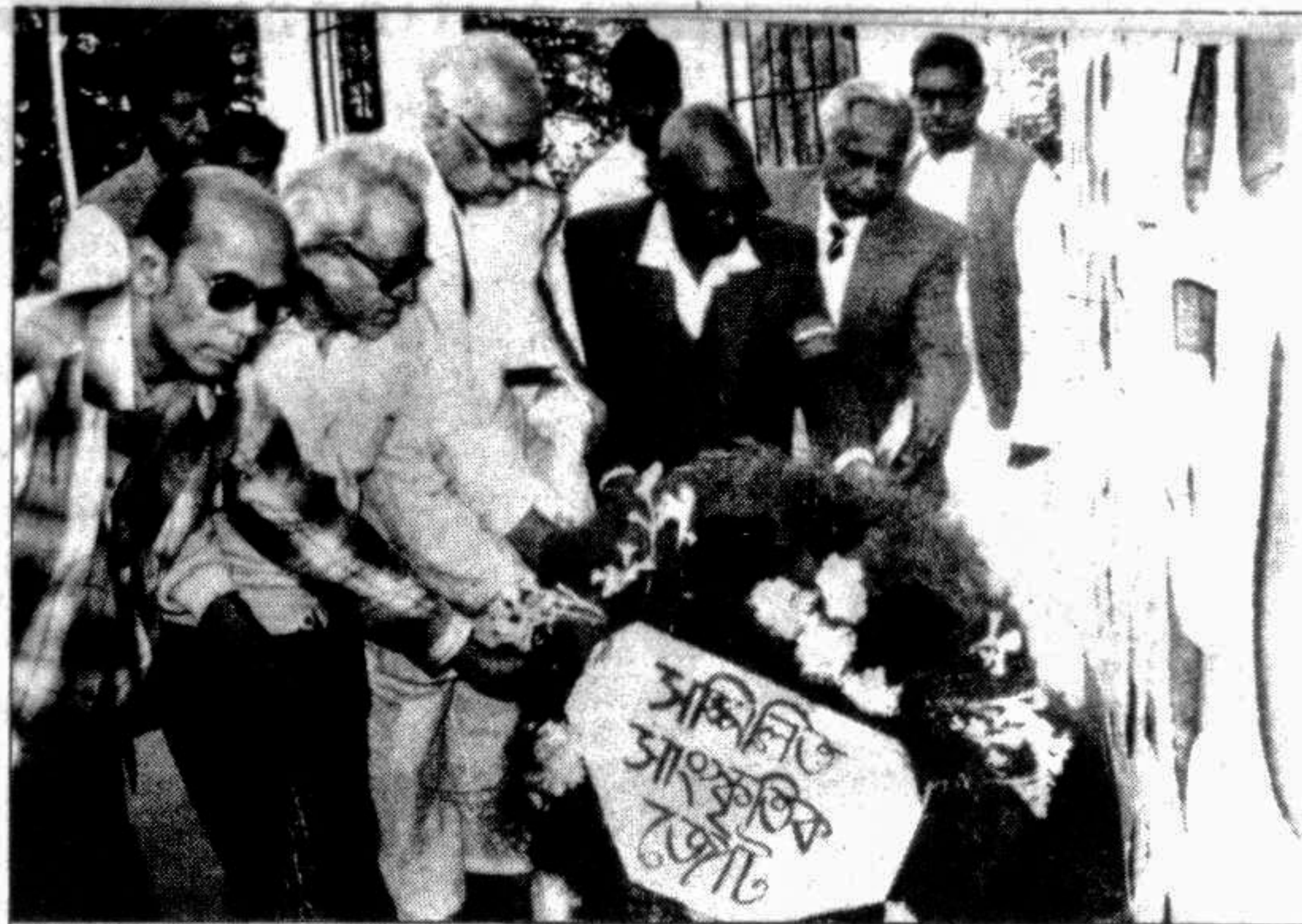
Leaders of the Sammito Sangskriti Jote on Friday laying wreaths at the Central Shaheed Minar to mark the beginning of their 12-day programme on Ekushey.