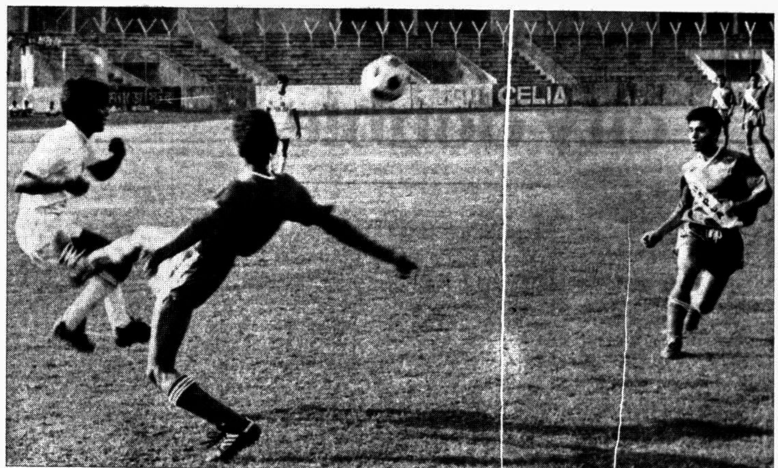
Action from yesterday's exhibition soccer match between BKSP and the visiting Shapla Youth Force of UK at the Mirpur Stadium. BKSP won 4-1.

blows Thursday when at one stage their score read 16 for two, Mohammedans yesterday needed determined batting from their formidable lineup to overhaul Biman's total. But unfortunately for them except for a disciplined knock of 82 from