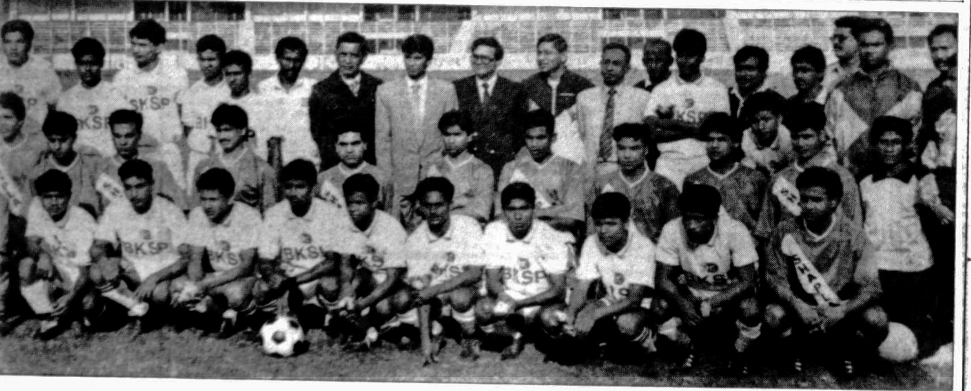
The BKSP and Shapla Youth Force teams pose with officials prior to the start of yesterday's exhibition match at Mirpur.

that they had been snubbed by Football Association officials and that the onset of sub-zero temperatures had somehow been part of the English conspiracy.