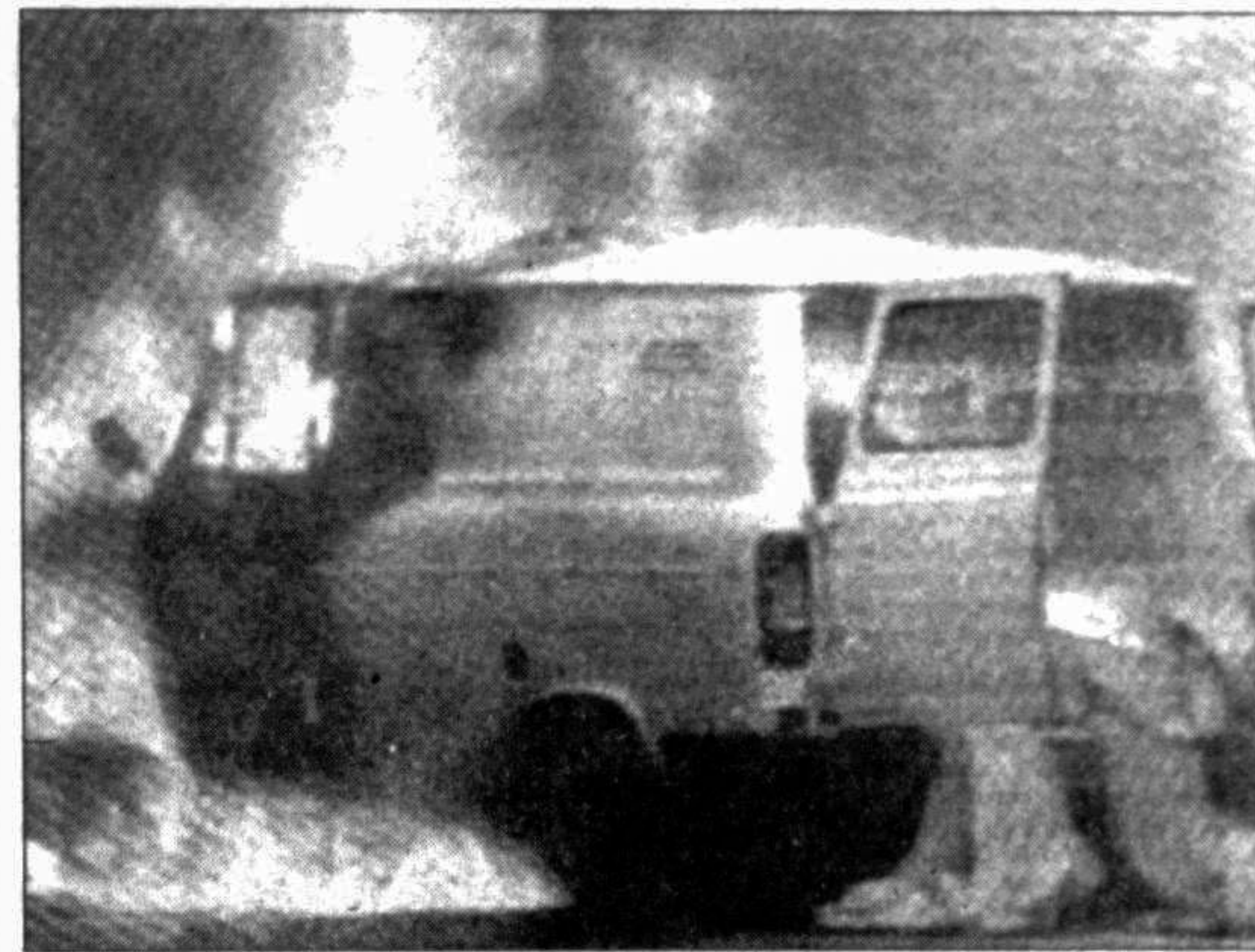
The van used in the attack on British Prime Minister John Major's residence burning Thursday after three mortar rounds were fired from it.

Baghdad Radio said Iraq was eager to start such a conflict and estimated that tens of thousands of American soldiers would die. "Iraq is wait-