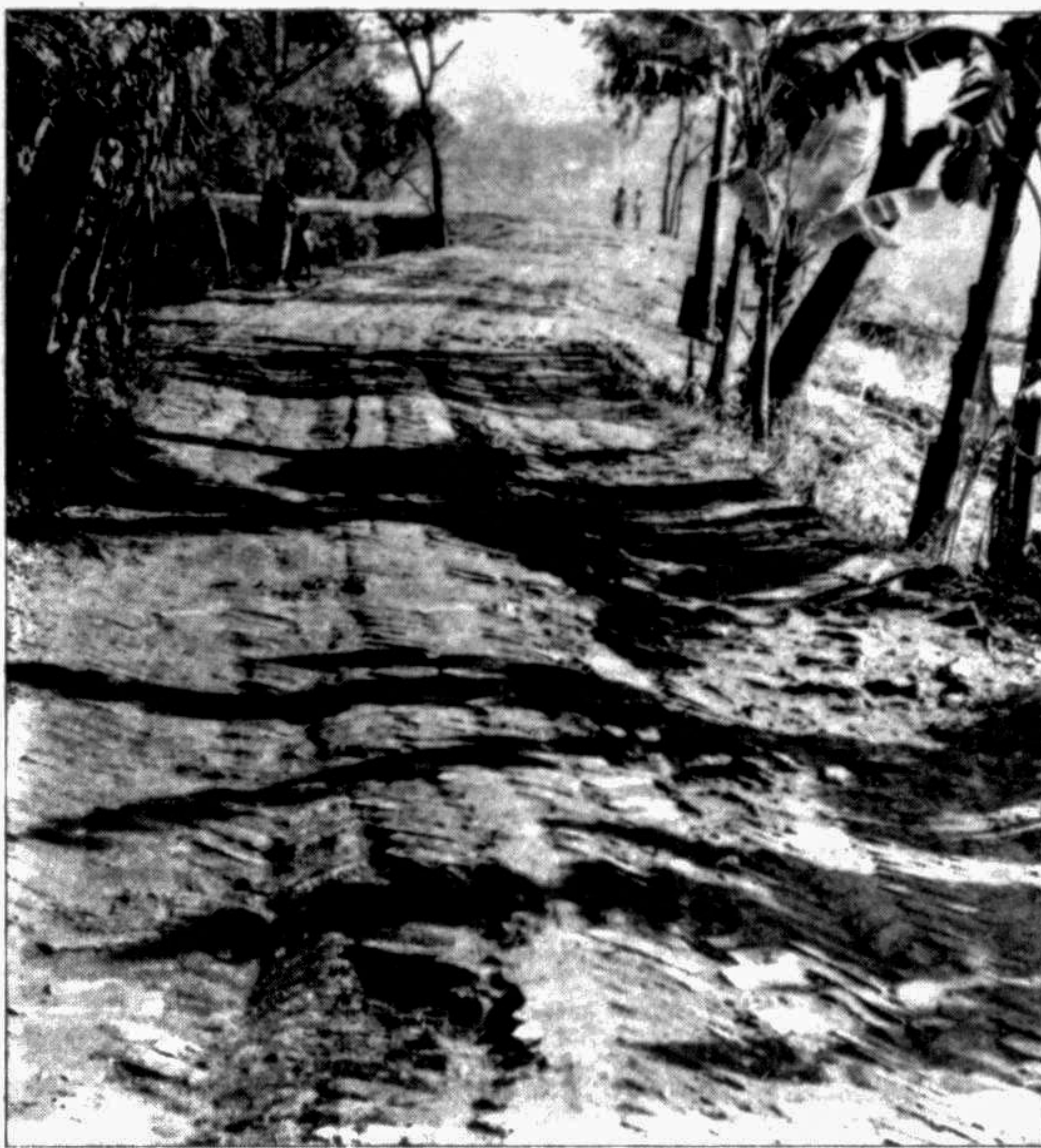
A dilapidated road at Lohajang upazila of Munshiganj district.