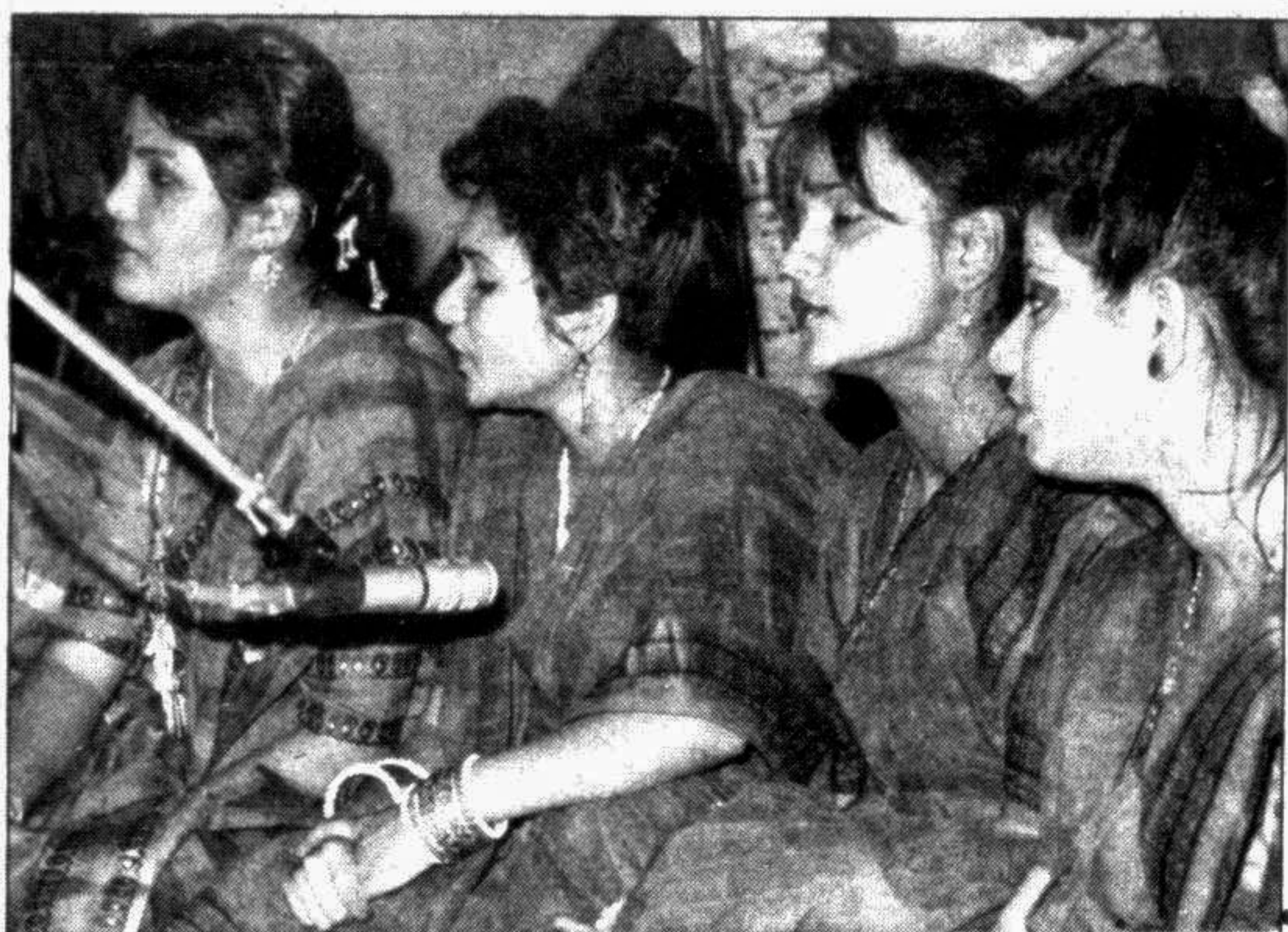
Lokaja Shilpi Gosthi, a cultural organisation, presenting folk songs at the Bangla Academy on Thursday.