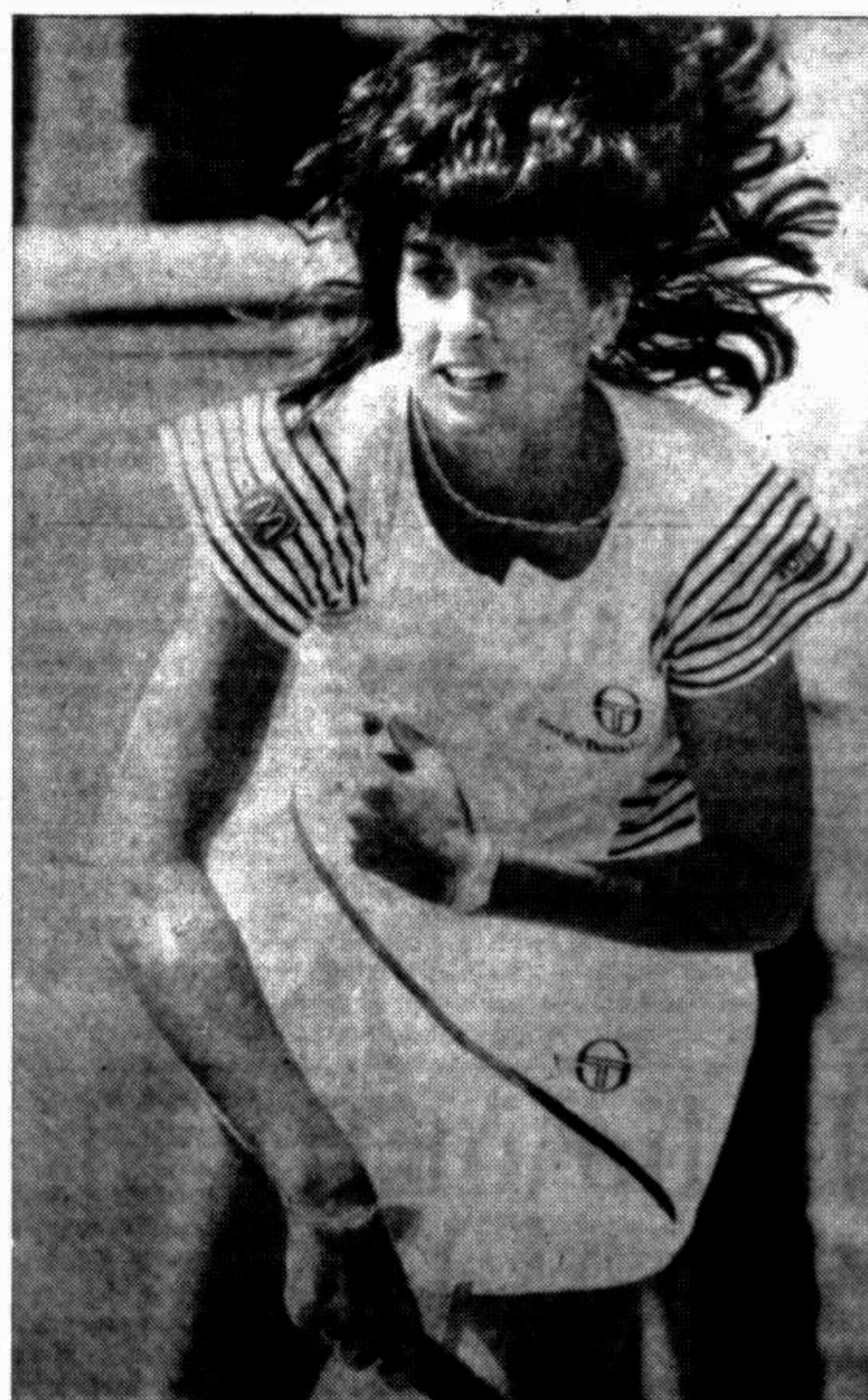
Gabriela Sabatini denied Martina Navratilova a triumphant return to the game by winning the Toray Pan Pacific title. Navratilova broke Sabatini in the first and seventh games of the decider but each time the Argentine leveled the score to 3-all and 4-all with marvelous service returns. "My returns were excellent and my passing shots worked

TOKYO, Feb 3: Gabriela Sabatini of Argentina staged a remarkable come-from-behind victory over former world no.1 Martina Navratilova of the United States here Sunday to win the 350,000 Dollar Toray Pan Pacific Open women's singles title, reports AFP. The 20-year-old Argentine, who shocked her archrival Steffi Graf of Germany in the quarter-finals, overcame one break down twice in the final set for a 2-6, 6-2, 6-4 victory to take the title she won in 1987. "I feel very happy and I'm very satisfied," she said afterward. "It's great to start the year with this win. It was great to beat Steffi first. That gave me a lot of confidence to be back again with my game that I finished last year." "Match by match, I kept playing better and better. That's why I feel very satisfied and very happy," she added. Sabatini, who clinched her first-ever Grand Slam title by beating Graf in the U.S. Open final in September, got off to a slow start, going down 0-5 in the opener. Her aggressive serve-and-volley tactics were not enough against the nine-time Wimbledon champion, who was the better player at the net. "I was eager to win this match, and I think I was rushing too much," Sabatini said later. The Argentine, ranked fourth in the world, changed her pattern and, although she lost the set eventually, came back strongly to tie the match at one set all, showing her signature heavy topspin shots.