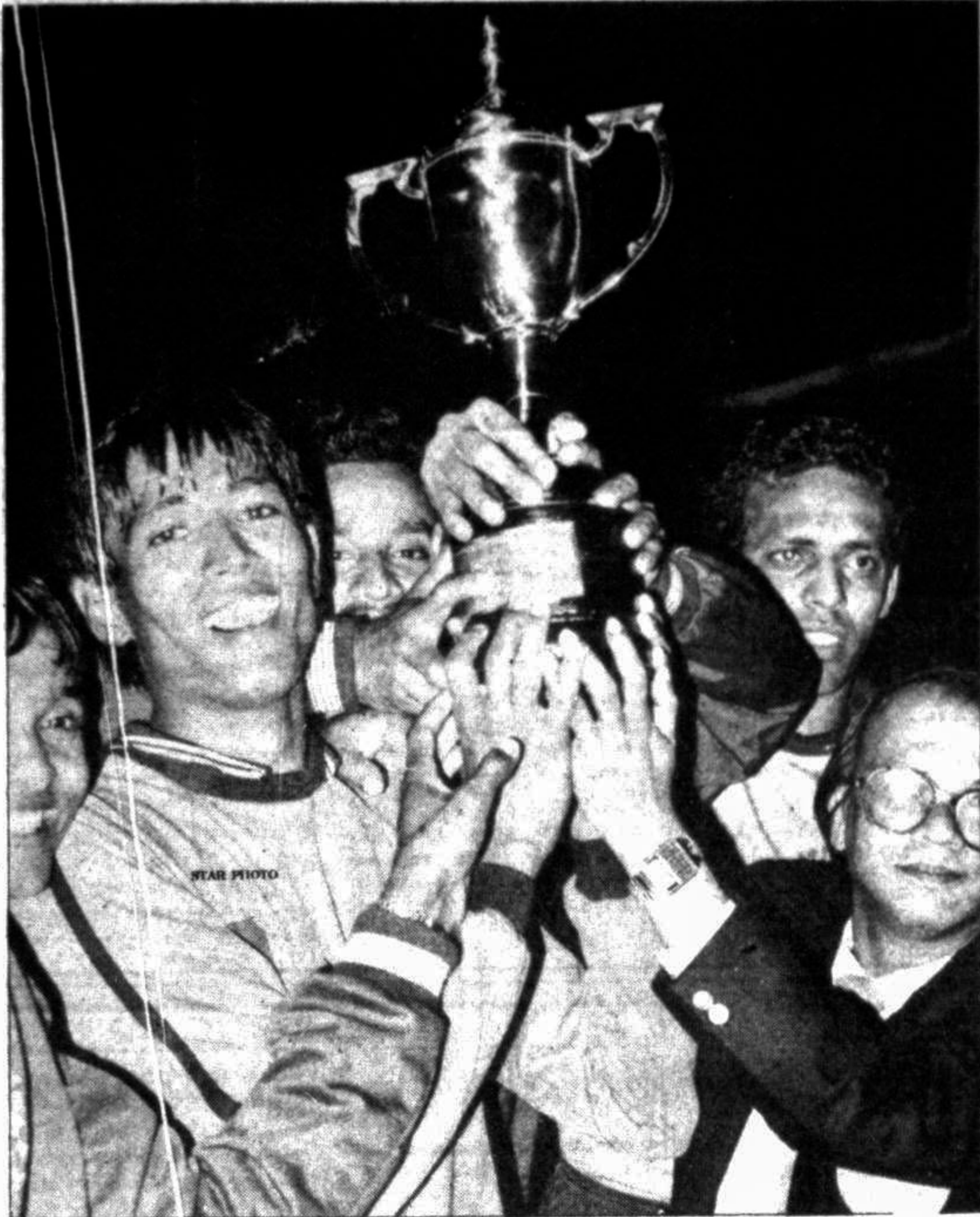
Titans Club show off their cup of joy after clinching the First Division volleyball league title beating BDR in yesterday's final.