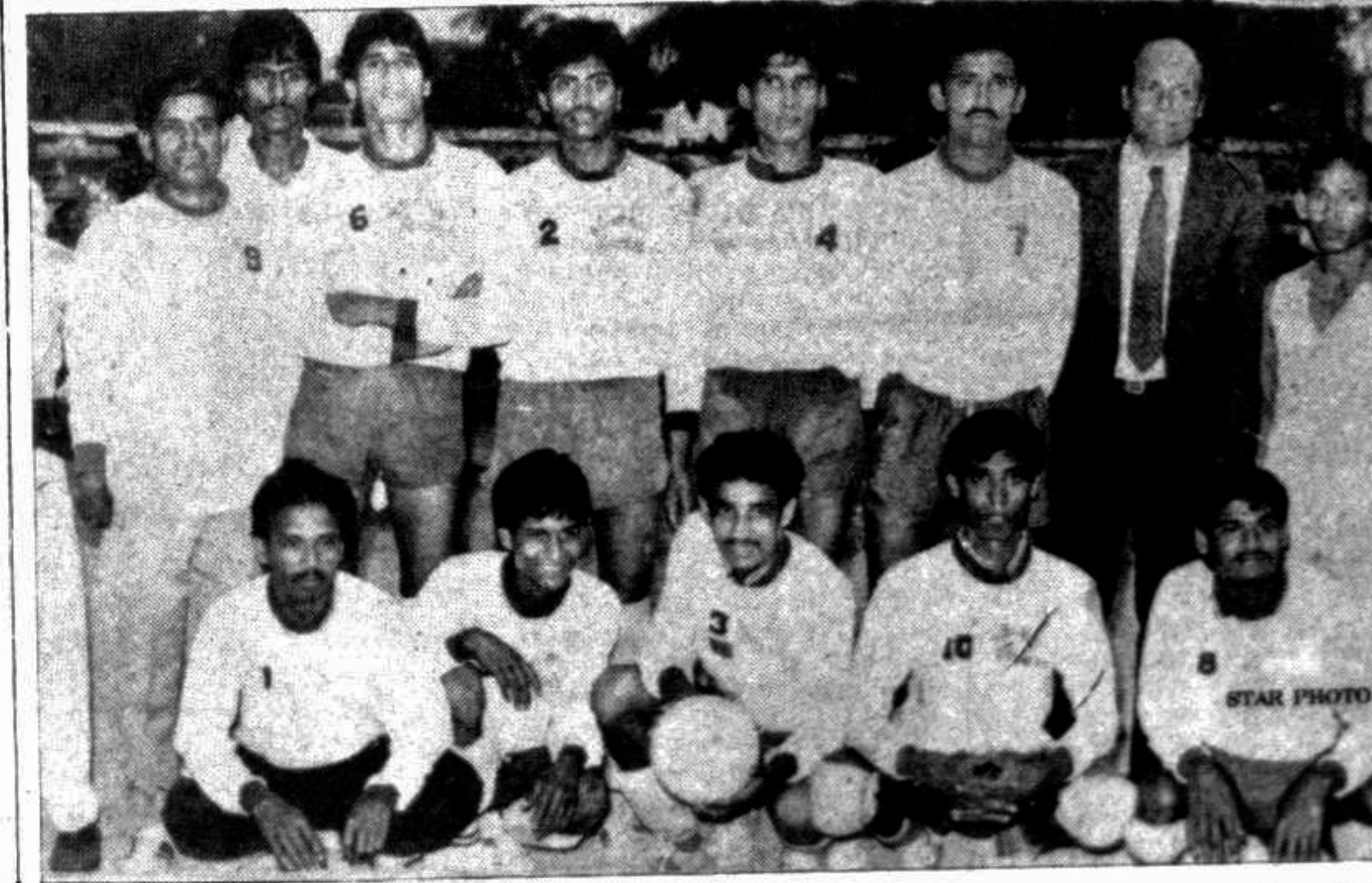
Second Division volleyball league champions East End Club.

The main event of this season will be the 10th Summer Games of the USSR peoples. The competitions are expected to attract 9,000 athletes. They include 39 events that will be held in stadiums and courts in twenty-one cities in the Russian Federation, Byelorussia and the Ukraine.