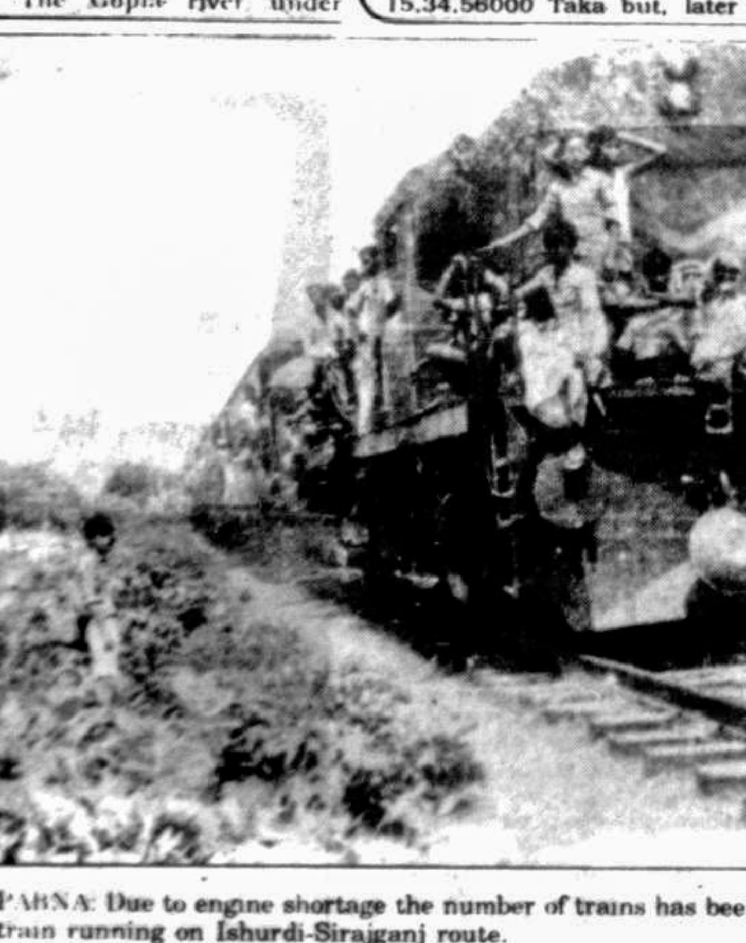
PABNA: Due to engine shortage the number of trains has been reduced. Here an overloaded train running on Ishurdi-Sirajganj route.

From Our Correspondent KISHOREGANJ, Feb. 1: A scheme has been undertaken to bring 34,594 acres of land under wheat cultivation in 13 upazilas of Kishoreganj district during the current season. According to the Agriculture Extension Department sources, 27,677 metric tons of wheat were estimated to be produced during the season. Engine shortage hampers rly service in W. zone From Our Correspondent PABNA, Feb 1: Railway service in the Western Zone suffers badly following the shortage of engines. At present only 140 railway engines are in operation of which 70 have been put into broadgauge in Paksey Division and 70 in metre gauge section in Lalmonirhat Division. The engines put into broad gauge section maintain services for intercity and local trains, shunting, transhipment of goods. As many as 14 engines are now lying in the workshop for repair. Engines allotted for metre gauge section are put on carrying intercity, local and goods trains, five for shunting, one for pilot train, one for carrying spares to Saidpur Railway workshop, three for transhipment, two for Railway Project Division and two to function as shuttle trains. Twenty-nine engines now await repair at different workshops. The total length of railway track in the Western Zone is 14,946 kilometre. Most of the engines with 875 horse power capacity were imported in 1953. The longevity of these engines expired about 15 years ago. But these are still being used.