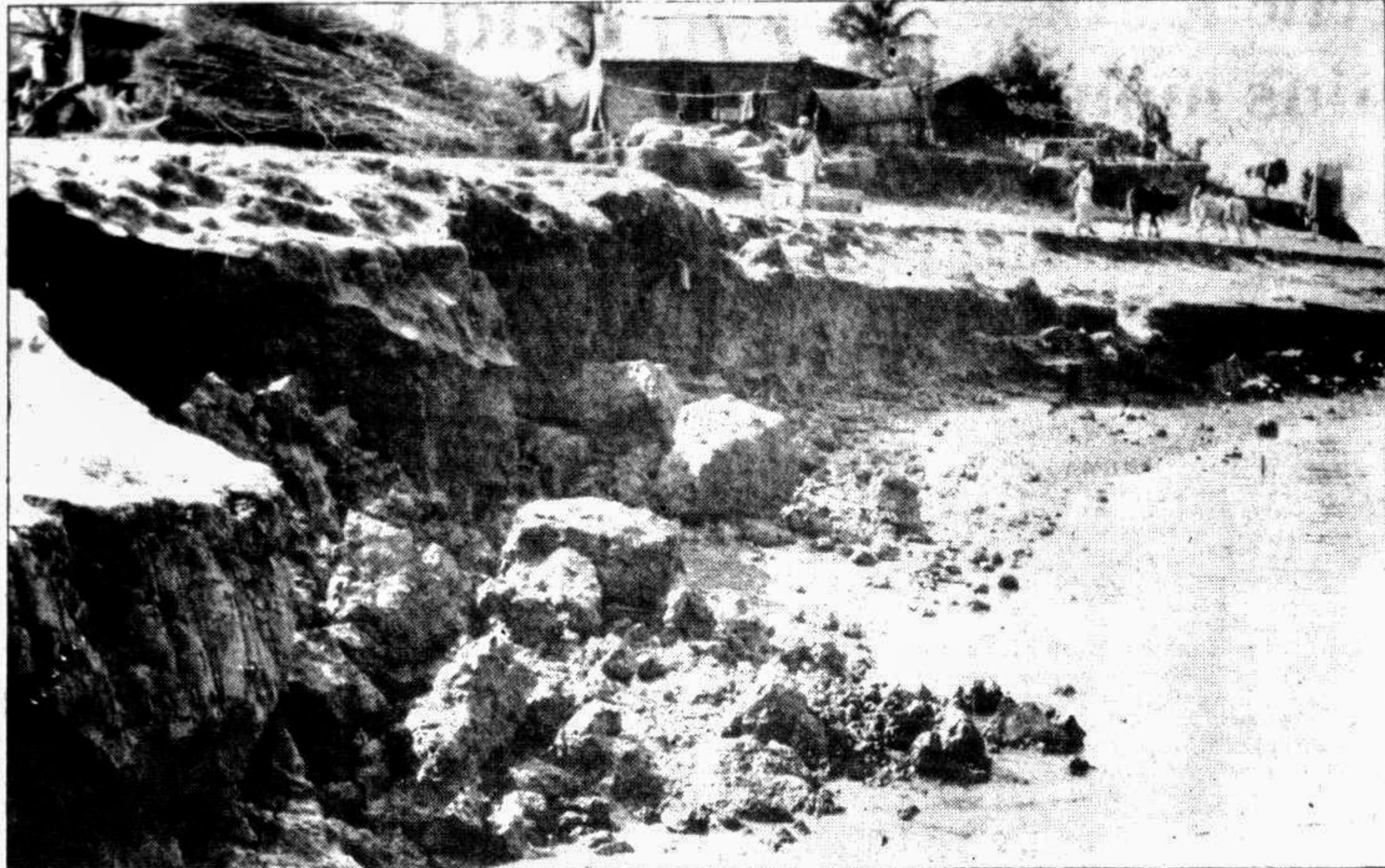
MUNSHIGANJ: Erosion by Dhaleswari continues unabated rendering many families homeless.