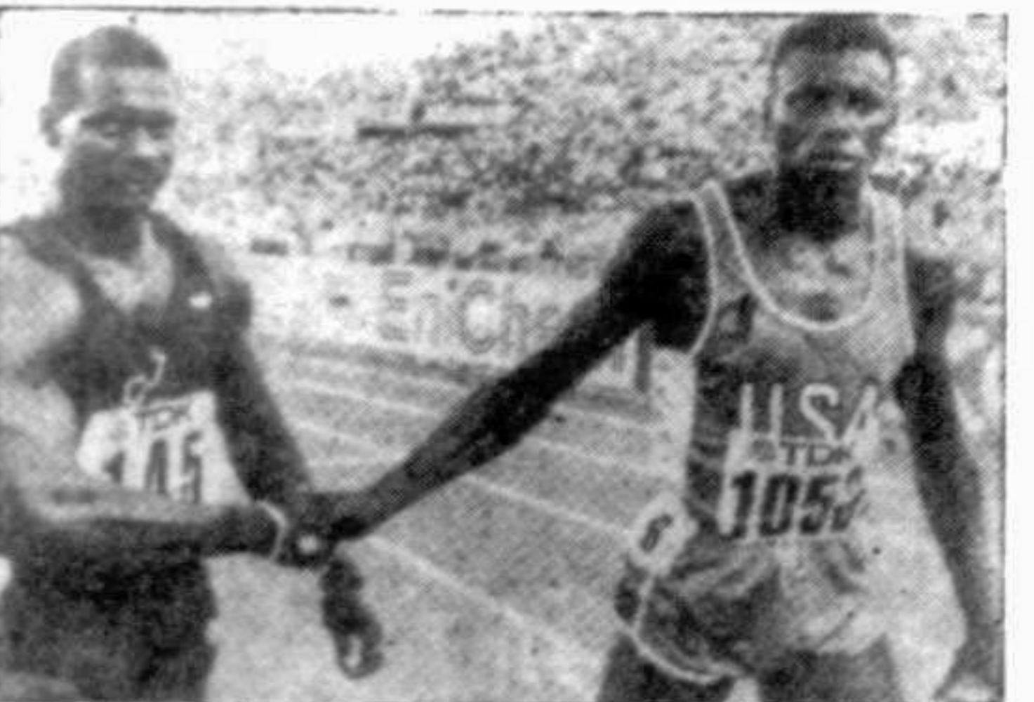
BEN JOHNSON and CARL LEWIS

MALMO, Sweden, Feb 1: Ben Johnson and Carl Lewis will race each other in an international athletics meeting here on August 5, organisers said on Thursday, reports Reuter.