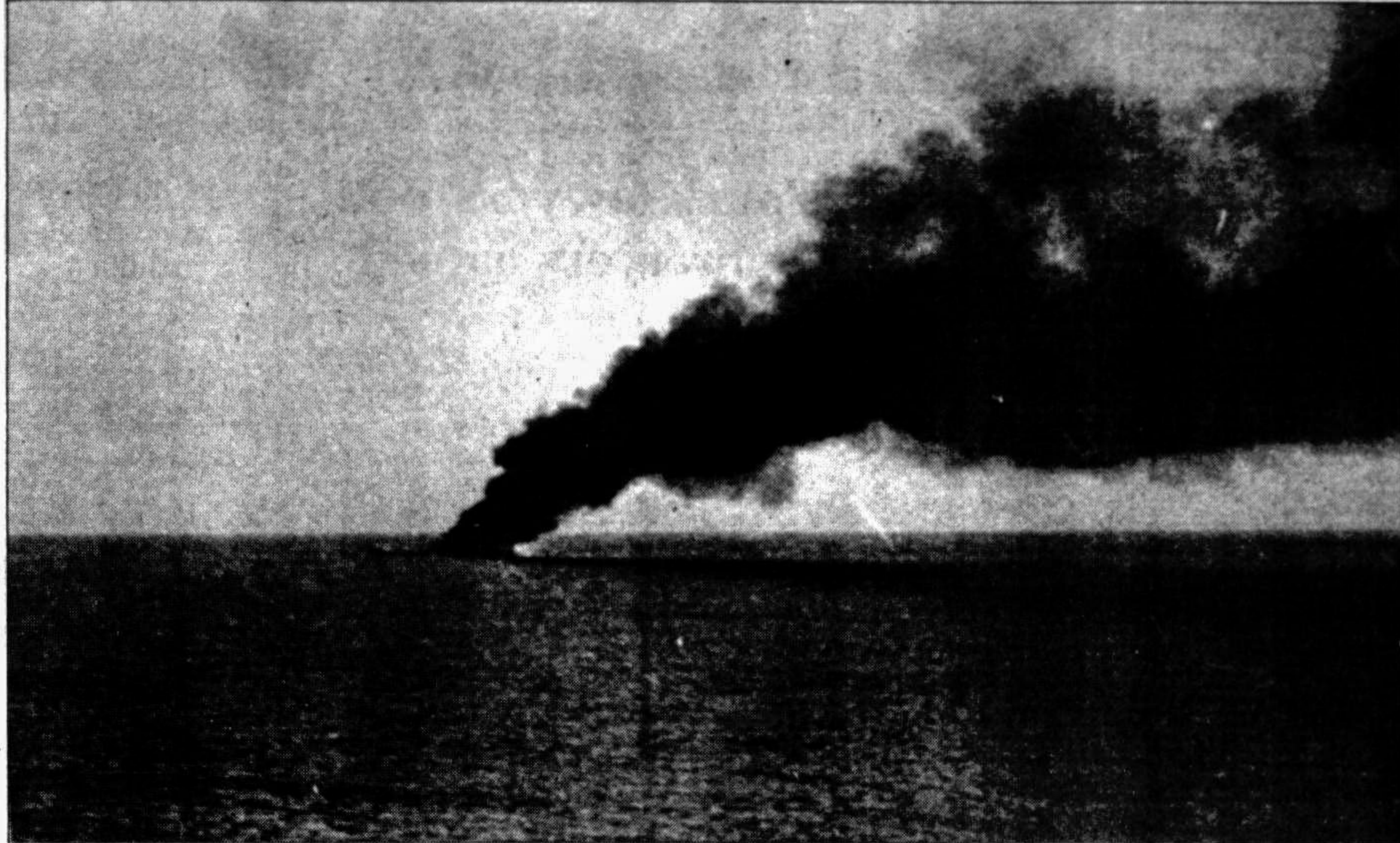
An Iraqi gunboat goes up in smoke after being hit by an air-to-surface missile fired by a Royal Navy Lynx helicopter from the British ship HMS Cardiff.

A British military spokesman said on Friday that more than 300 Iraqi soldiers died in fighting around Khafji, and the US military said more than 500 had been taken prisoner. Iraqi armoured columns struck across the border from Kuwait on Tuesday night and early Wednesday, seized the town some five km (three