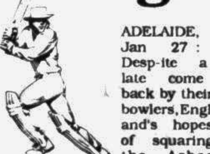
ADELAIDE, Jan 27: Despite a late come back by their bowlers, England's hopes of squaring the Ashes series crumbled along with their batting on the third day of the fourth cricket Test today, reports Reuter.

Australia, 2-0 ahead in the five-match series, lead the touring team by 225 runs with six wickets remaining in their second innings.