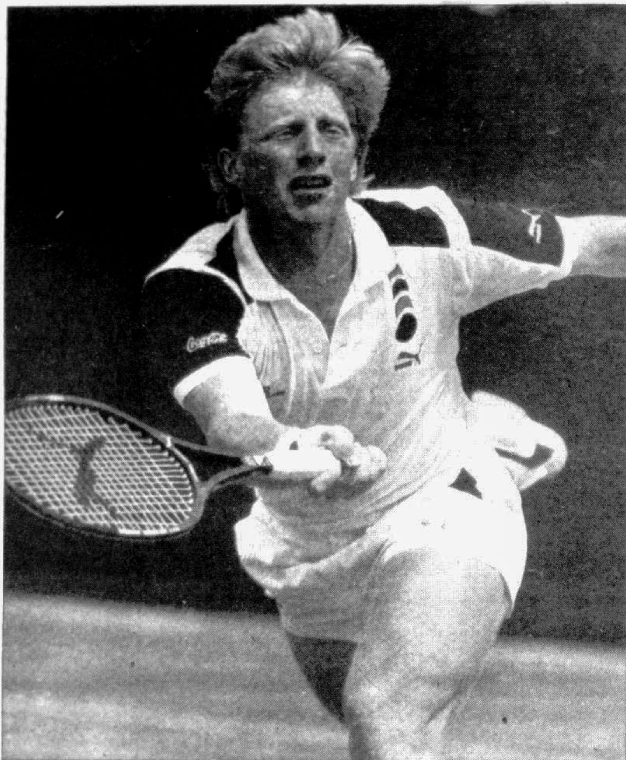
Boris Becker became the world's top ranked men's player after winning the Australian Open defeating title holder Ivan Lendl, 1-6, 6-4, 6-4, 6-4, in Melbourne yesterday.

"It was a great shot. He would not have gotten to it," Lendl said. "If I would have broken ... it would have been a rout."