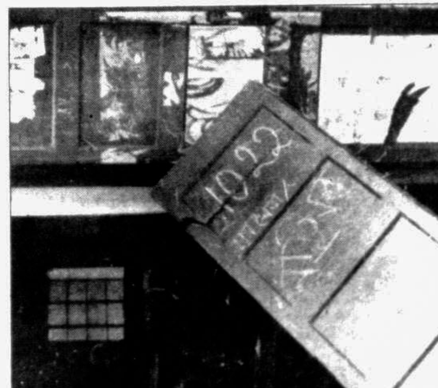
The agrieved students who were appearing in the admission test for medical colleges damaged the doors and windows of the Dhaka University Arts Building on Friday.

Examinations of all year classes of Architecture Department will begin on February 2.