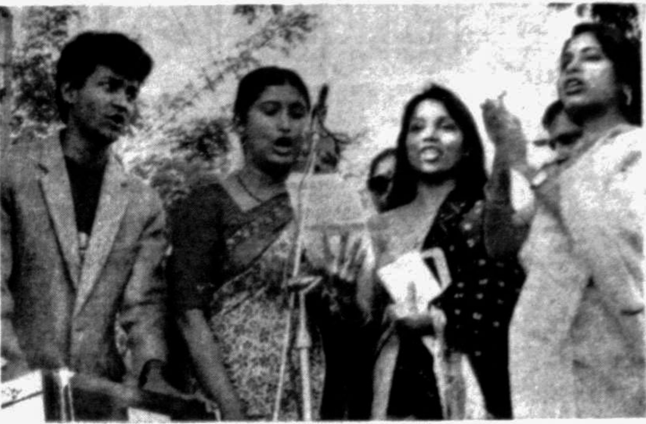
Members of Udichi Shilpi Goshthi rendering songs at a function organised by Sammilita Sanskritik Jote in city on Friday.

On Friday the night temperature fell by two to four degree Celsius over Dhaka, Faridpur, Madaripur, Ishurdi, Jessore, Khulna, Satkhira and Chuadanga, and rose by two degree Celsius over Cox's Bazar. Elsewhere the night temperature remained nearly unchanged.