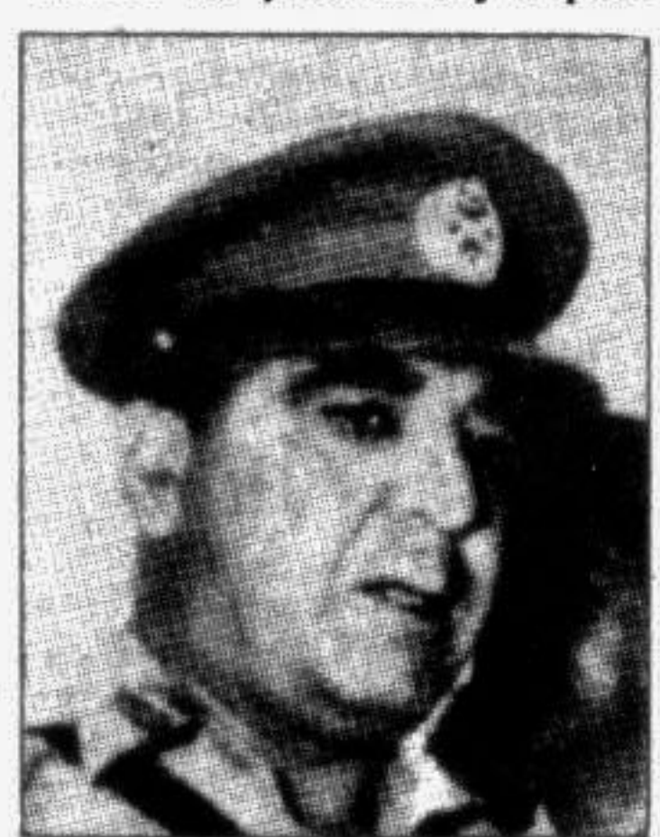
Gen Yahya Khan