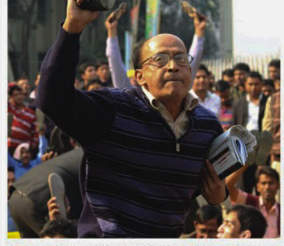
A small investor in the share market raises his shoe during a sit-in in front of Bangladesh Bank yesterday. Investors took to the streets after the market was suddenly closed.