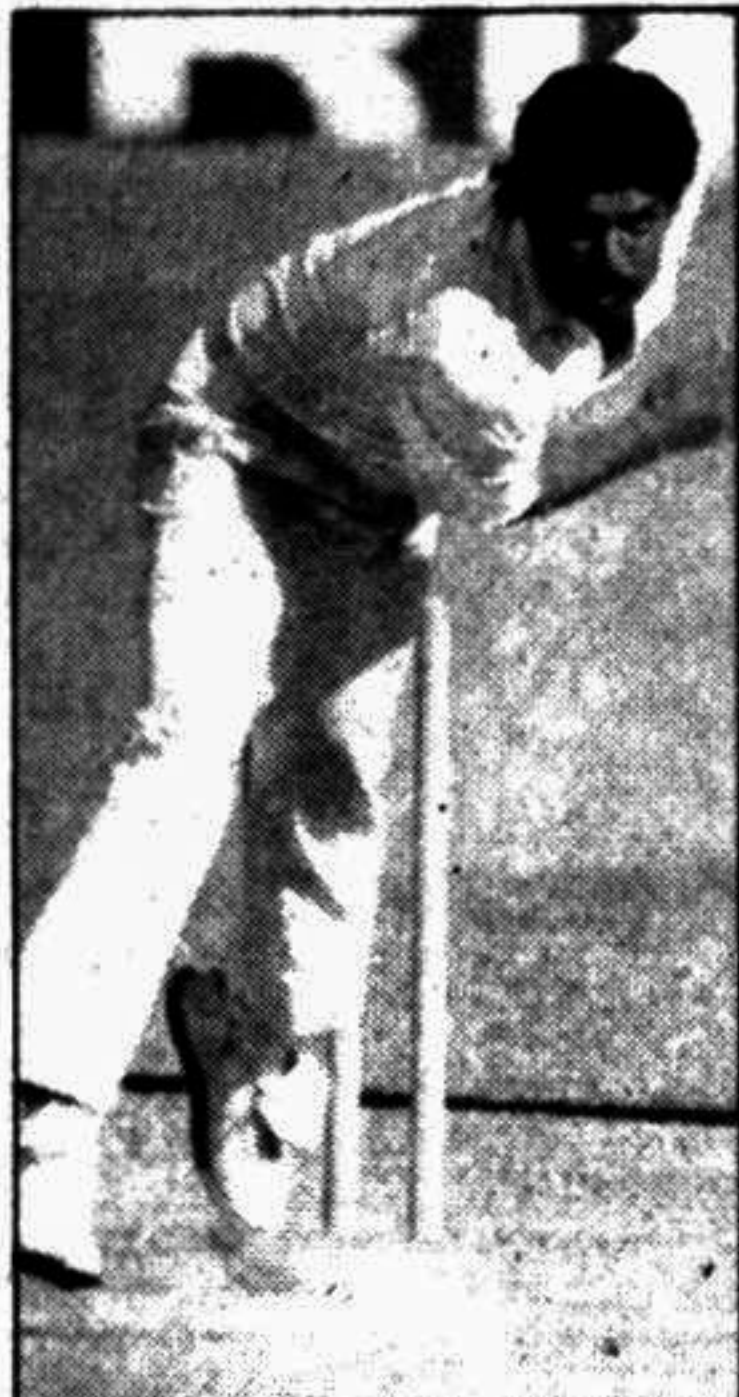
KAPIL DEV...5 for 97

performance of the early-order batting. Heisman Healy was well assisted by Merv Hughes whose attractive, if unorthodox, 36 included a big six over square leg and was ended only by a well-judged catch in the deep by Sachin Tendulkar.