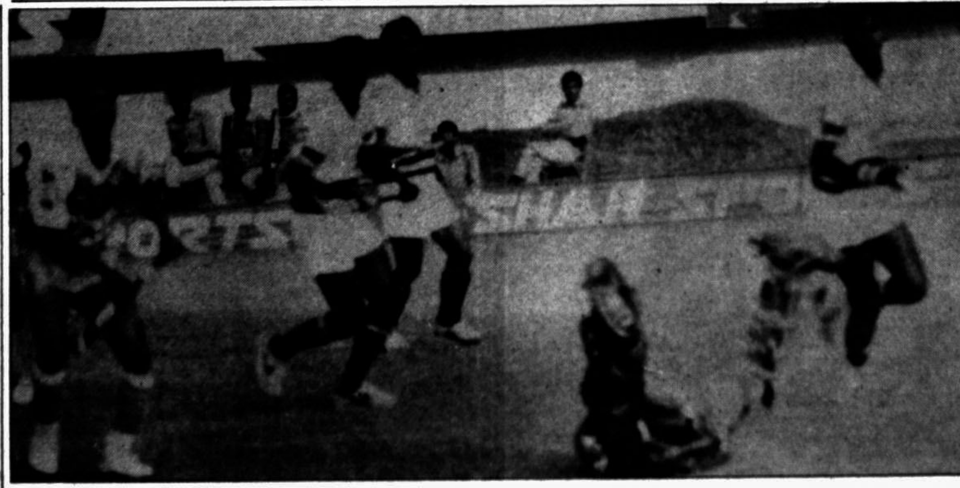
Action from yesterday's thrilling Victory Day tournament semi-final between Abahani Krira Chakra and Ajax Sports Club at the Hockey Stadium. Abahani rallied to win 3-2.

TODAY'S MATCH Mohammedana SC vs Army — (semi-final) : 3 P.M.