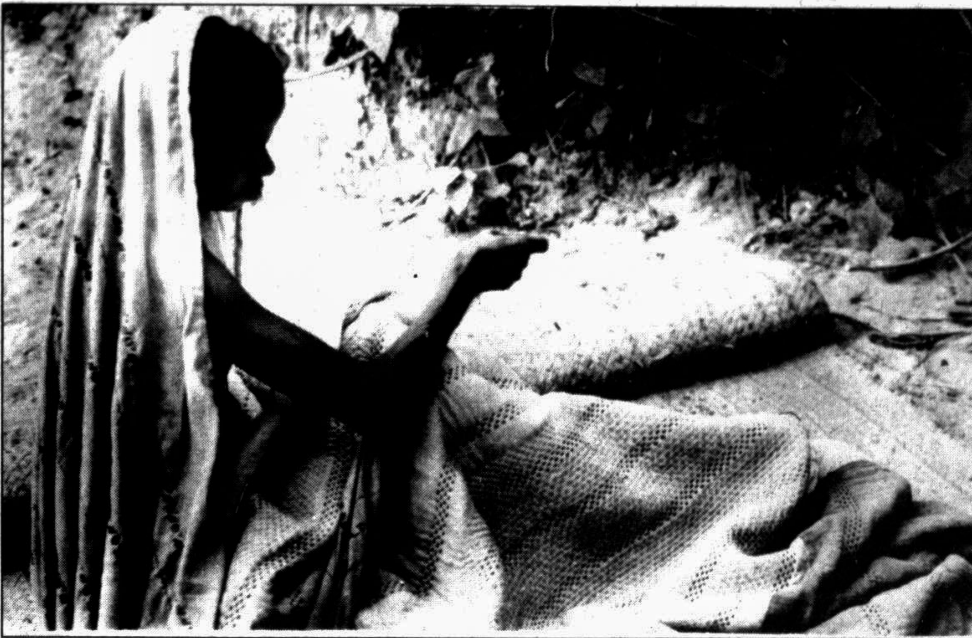
NAKSHI KANTHA : A village woman in a bid to earn livelihood by sewing traditional 'Nakshi Kantha' (Embroidered Quilt)