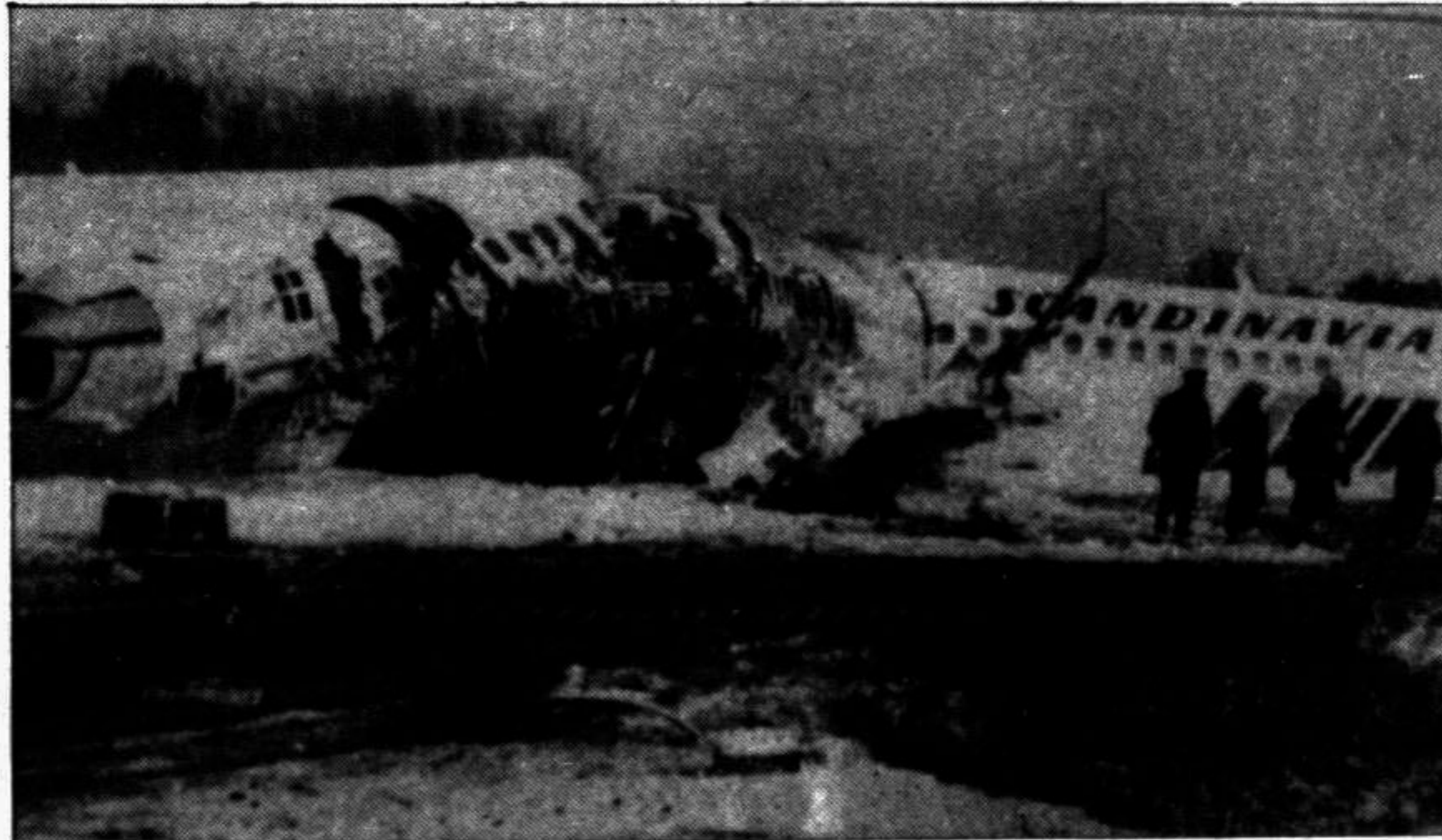
Rescuers stand near the wreckage of a Scandinavian Air-line System (SAS) plane that crashed shortly after take off. The plane with 122 persons on board was bound for Copenhagen with a final destination of Warsaw, broke in two upon making an emergency landing away from the airport.

Meanwhile, a freed political prisoner vowed that bloodshed would continue if President Zviad Gamsakhurdia does not bow to opposition demands that he resign.