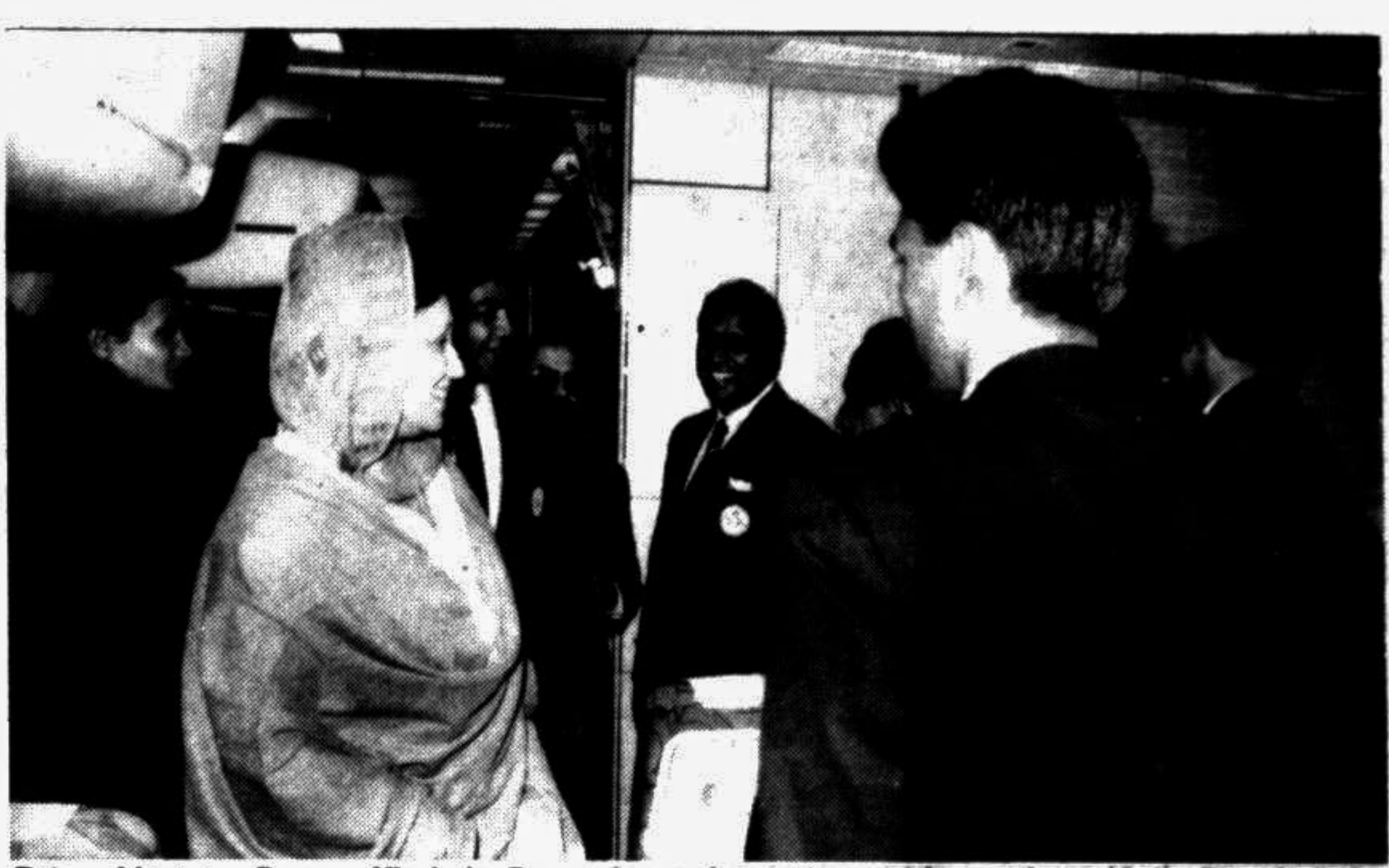
Prime Minister Begum Khaleda Zia exchanged greetings with members of the Bangladesh SAF Games-bound contingent aboard the aircraft on way to Colombo Dec 20.