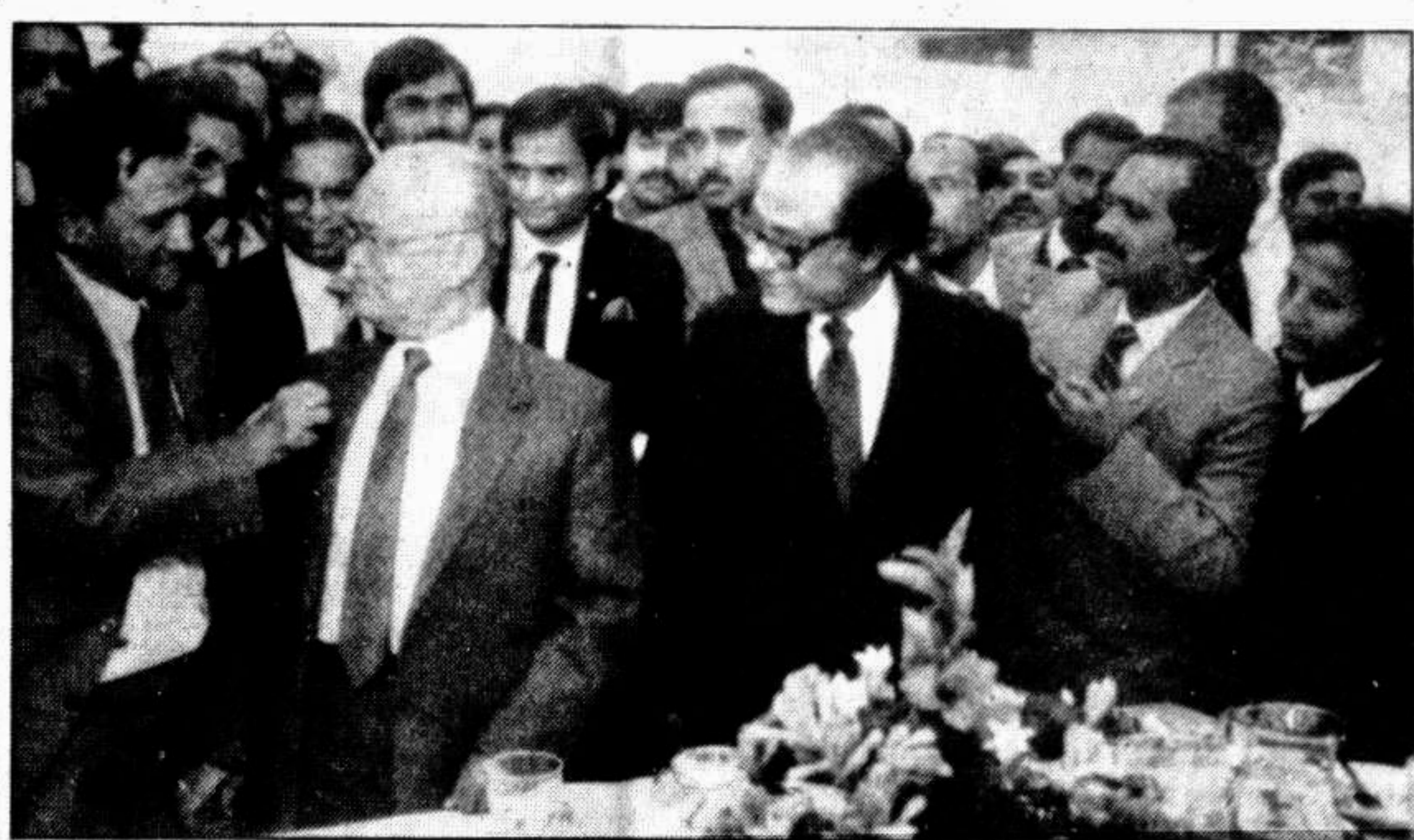
President Abdur Rahman Biswas with the Bar members at a luncheon hosted by Bangladesh Supreme Court Bar Association in the city on Thursday. Chief Justice and former Acting President Shahabuddin Ahmed is also seen in the picture.