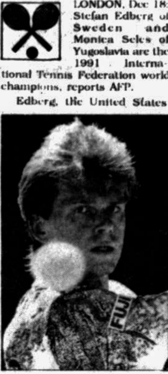
STEFAN EDBERG Open champion, was the unanimous choice of the ITF

LONDON, Dec 18: Stefan Edberg of Sweden and Monica Seles of Yugoslavia are the 1991 International Tennis Federation world champions, reports AFP. Edberg, the United States panel of Fred Perry, Frank Sedgman and Tony Trabert, while Seles won her title by virtue of finishing top of the points standings. In addition to winning the United States Open title, Edberg won five other tournaments during the year, more than any other player. He was also a semi-finalist at the Australian Open and Wimbledon as well as a quarter-finalist at the French Open. A major factor in the panel's decision was Edberg's improved consistency over 1990, when he lost twice in the first round of Grand Slam events and the first round of the Grand Slam Cup. Edberg, 25, made a slow start in 1991 but the second half of his year was most impressive. He reached a peak at the US Open and sustained it for the next two months before injury intervened. The choice of Seles was virtually automatic. She reached the finals of all the 16 tournaments she played in 1991 and won 10 of them, including the Australian, French and US