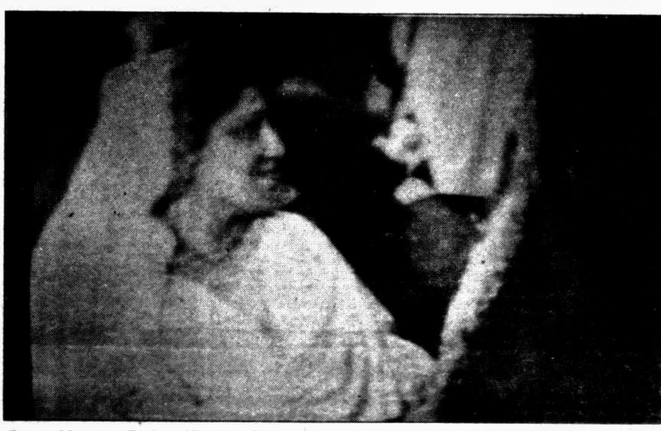
Prime Minister Begum Khaleda Zia at the opening session of the sixth OIC summit in Dakar, Senegal on Monday.

DAKAR (Senegal), Dec 10: Prime Minister Begum Khaleda Zia today made a call to the Muslim Ummah to respond to the challenges posed by unprecedented political, economic and social changes throughout the world with solidarity, commitment, imagination and innovation, reports BSS. Making a statement at the plenary session of the sixth Islamic summit here, Begum Zia stressed the importance of safeguarding the individual and collective interests of Islamic community on the threshold of the new era. She expressed her belief that the Muslim Ummah would prove equal to the challenges posed by these developments. The Prime Minister reiterated Bangladesh's commitment to the cause of the Islamic Ummah and pledged to make its own modest contribution to common objectives. Begum Zia said, "Our fun- See Page 12 Col. 7