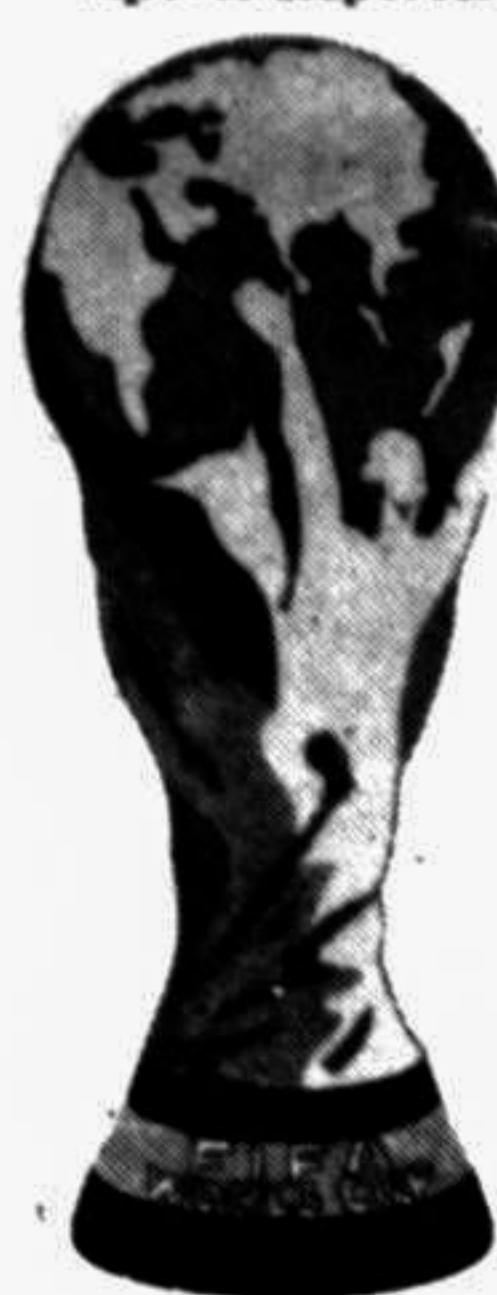
Bangladesh finds herself in an extremely difficult group along

Bangladesh will be playing in Group F of the Asian zone qualifying competition for the 1994 World Cup, according to the draw made in New York last Sunday.