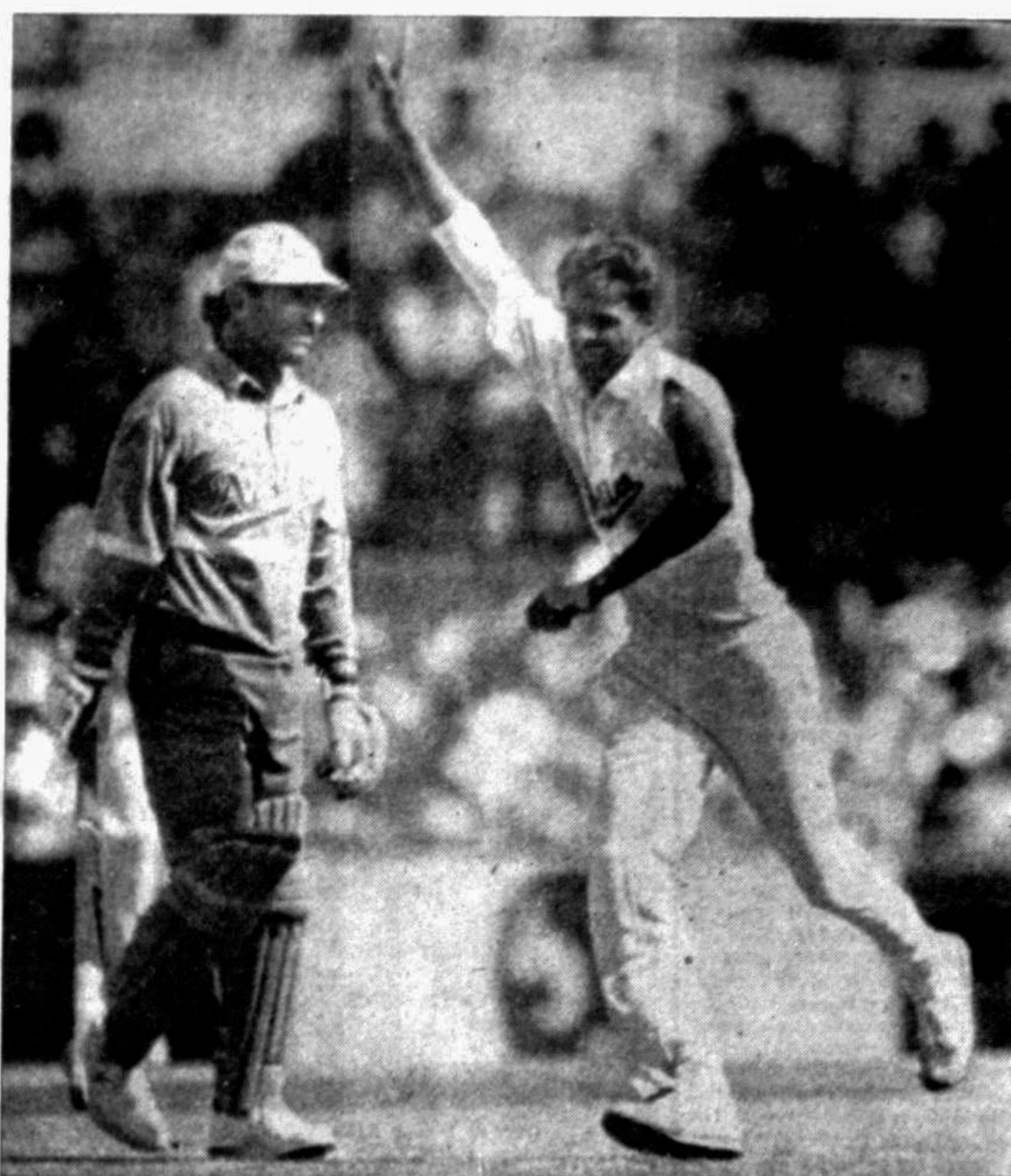
Indian bowler Jawagal Srinath is delighted as he takes the prize wicket from Australia's captain Allan Border (L) who walks away from the wicket in Perth, Australia on Dec 8 in the World Series Cup cricket championship. Border was caught by wicket keeper Kiran More for 32 runs. India beat Aussies by 101 runs.