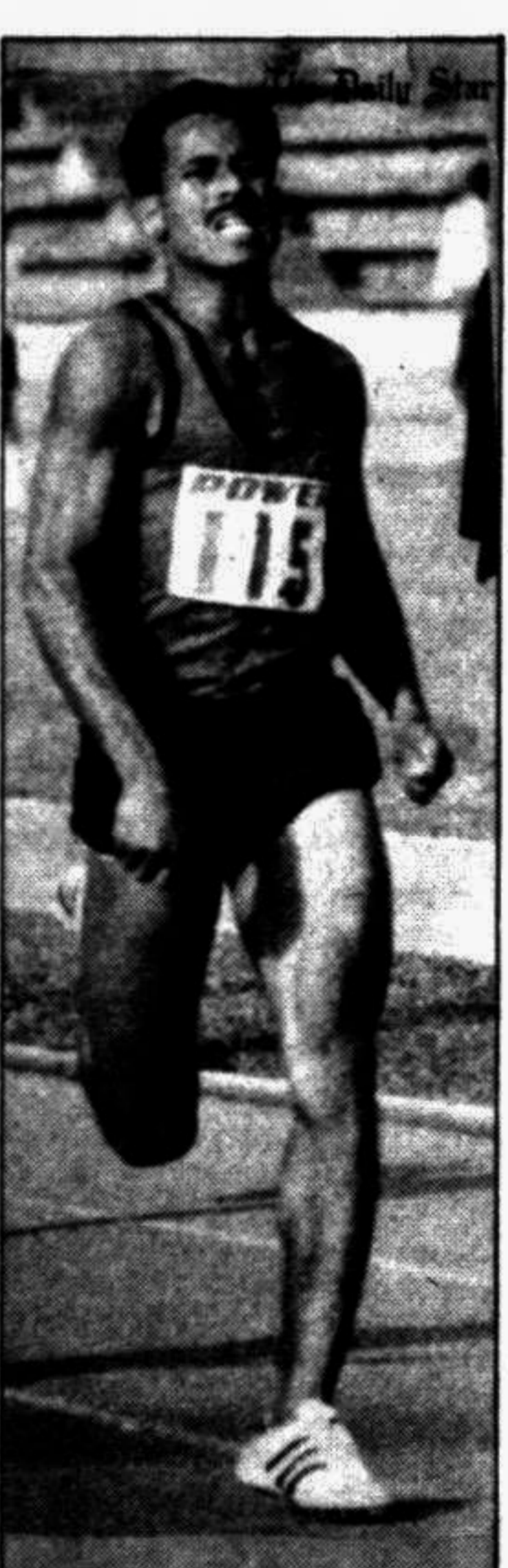
G. AMBIA...10.30 secs

The three-day inter-services athletics competition-91 concluded at the Bangladesh Army Stadium, Dhaka Cantonment yesterday afternoon with the improvement of a national record and eight inter-services records, an ISPR press release said.