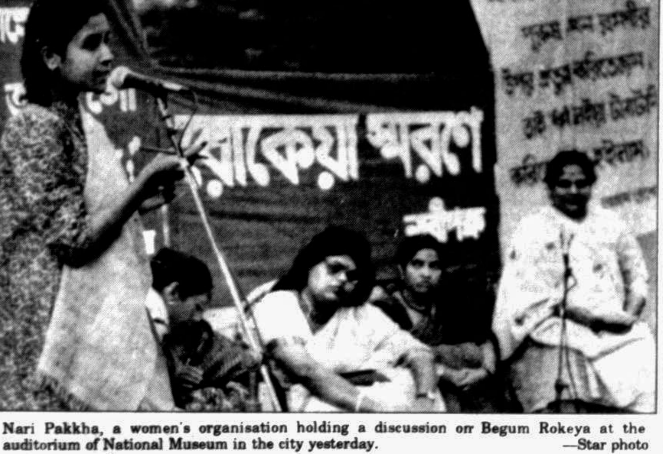
Nari Pakkha, a women's organisation holding a discussion on Begum Rokeya at the auditorium of National Museum in the city yesterday.