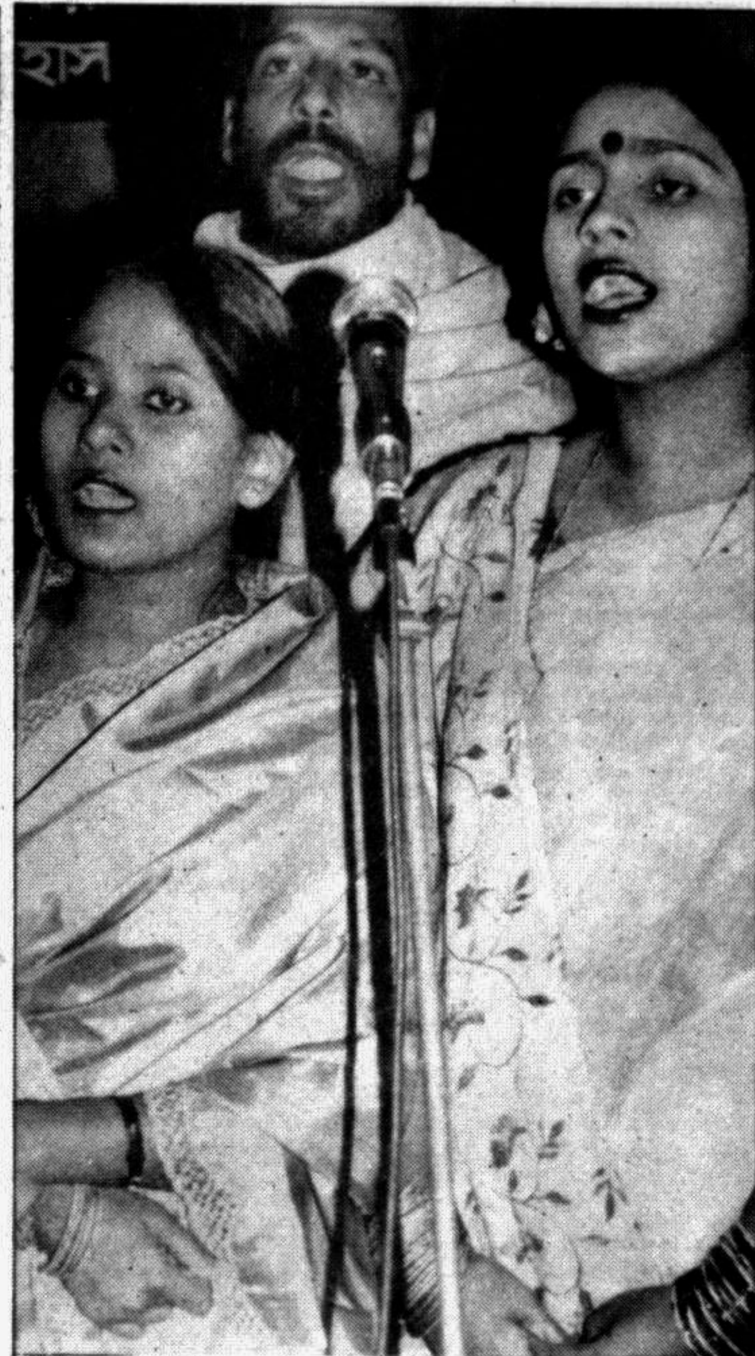
Artists of Chhayana rendering songs at the auditorium of Central Public Library on Sunday on the occasion of the 70th birth anniversary of Patua Quamrul.

The lowest temperature was at Jessore on the day. Sun set at Dhaka on Monday at 5-12 pm and Sun rise Tuesday at 6-31 am.