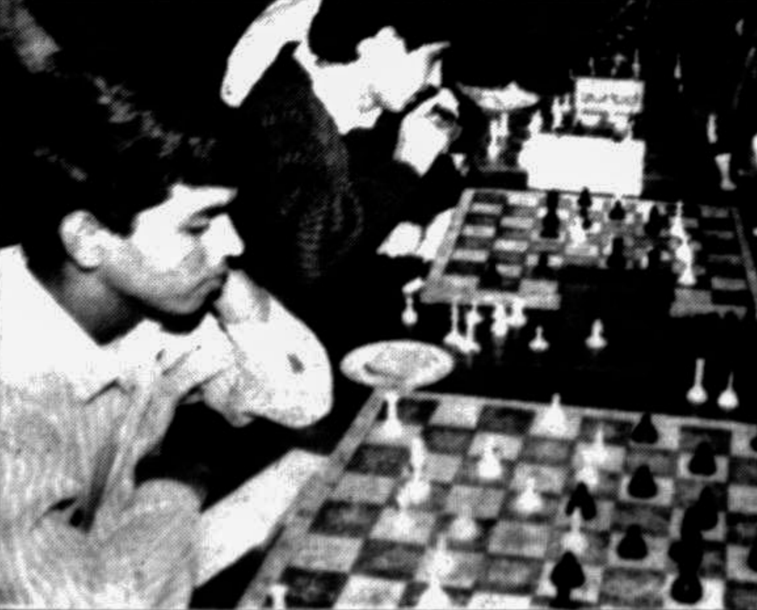
Scene from yesterday's First Division league play at the NSC chess room.