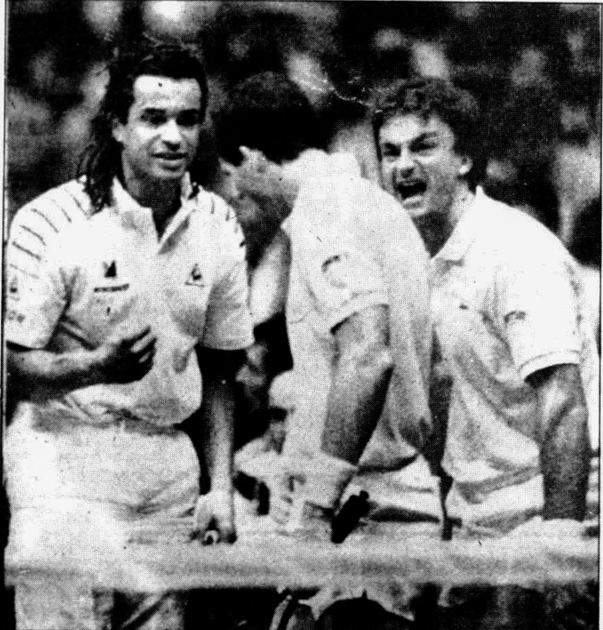
French team captain Yannicke Noah (L) encourages French pair Leconte (R) and Guy Forget during the Davis Cup doubles final match between France and USA in Lyon on Nov 30. France won 6-1, 6-4, 4-6, 6-2.

An earlier report said: Leconte, who pulled off a sensation when he beat Pete Sampras in the second singles on Friday, teamed with Guy Forget to beat the experienced American partnership of Ken Flach and Robert Seguso 6-1, 6-4, 4-6, 6-2.