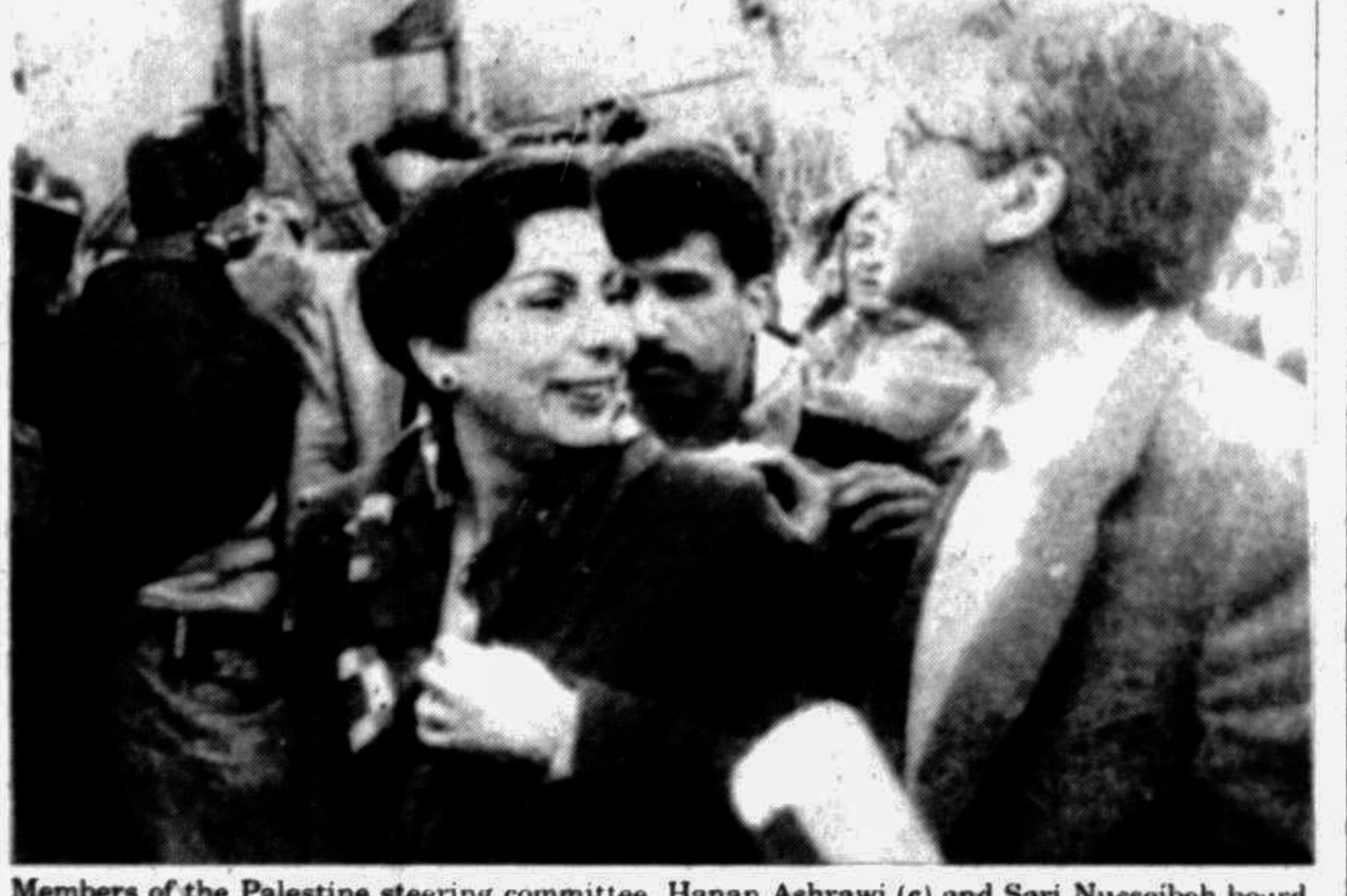
Members of the Palestine steering committee, Hanan Ashrawi (c) and Sari Nusseibeh board a bus in Jerusalem on Friday to attend the second round of the Middle East peace talks in Washington.

COLOMBO, Nov 29: Leaders of the seven-nation South Asian Association for Regional Cooperation (SAARC) are likely to meet here on December 21 for a one-day summit, diplomatic sources said, reports PTI. The Maldivian Foreign Minister Fathulla Jameel recently completed consultations with India, Nepal and Bhutan and has been reported to have said that the aborted sixth summit may be held sometime during the last ten days of December for a brief businesslike session under the chairmanship of Sri Lanka. Parliament session in Sri Lanka, which is keen to have the summit before the year-end, would end by that time. The current session of the Indian parliament would also end on December 20.